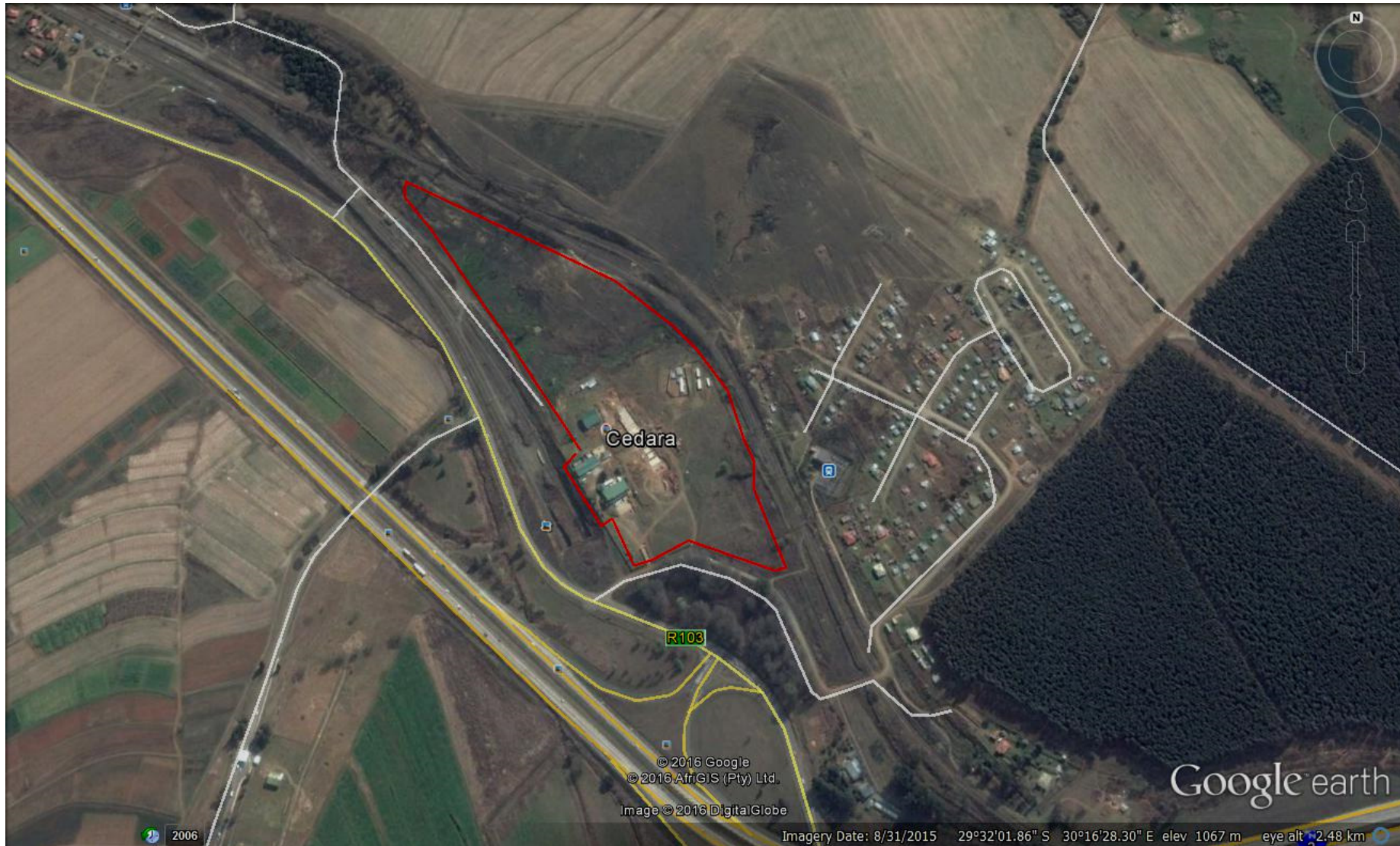
Figure 1 Locality Map of Madrasa An-Noor for the Blind Facility