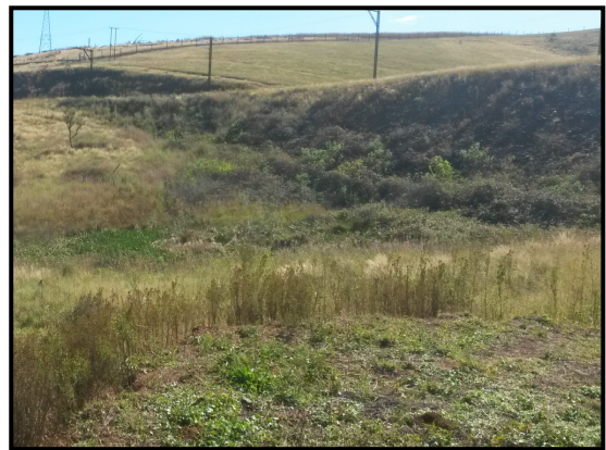
Wetland within the Property