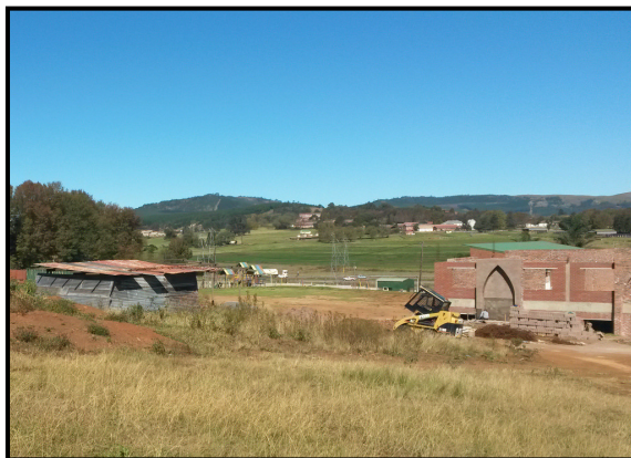
South West view of the Construction Site