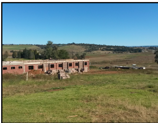
Westerly View of the Construction Site

The construction of this facility will be to cater for the education of the blind.