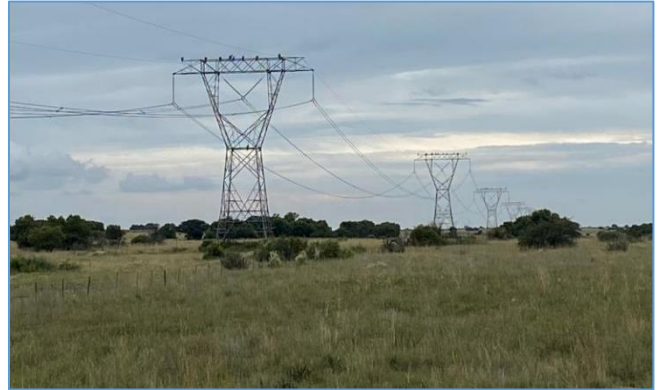
Figure 4: White-backed vultures roosting on the 400kV Hermes- Pluto transmission lines.

A large proportion of the project area is classified as an Ecological Support Area (ESA category 1), with a small portion along the northern boundary of the project area overlapping a Critical Biodiversity Area (CBA level 2).