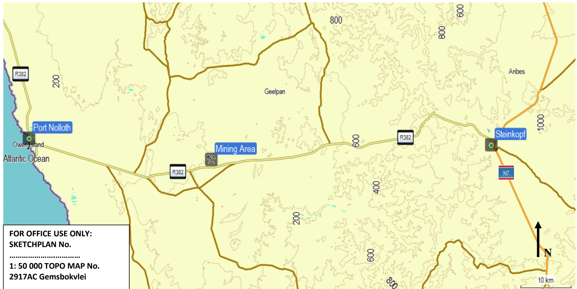
Diagram 1: Locality plan contemplated in regulation 2(2) read with regulation 2(3) of the MPRDA Act, 2002 (Act No. 30 of 2002)