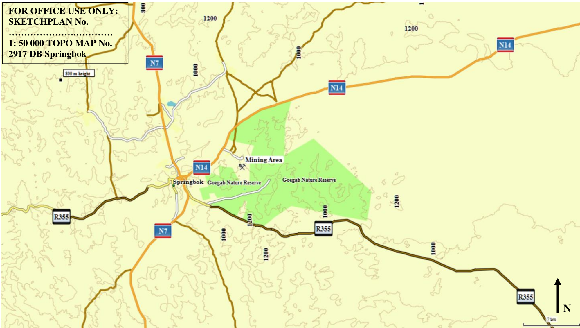
Diagram 1: Locality plan contemplated in regulation 2(2) read with regulation 2(3) of the MPRDA Act, 2002 (Act No. 30 of 2002)