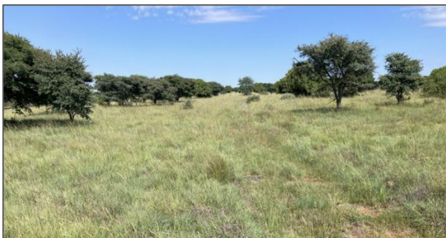
Figure 3: Typical vegetation in the project area.

The vegetation in the project area mainly consists of grassland-woodland vegetation with occasional rocky ridges. The habitat in most of the project area is degraded due to overgrazing and other agricultural practices. While the area is not entirely transformed, ongoing disturbance prevents recovery of these areas to a more natural state. Camel Thorn ( Vachellia erioloba ) is the only SCC recorded in the project area and these trees are widely distributed across the site (see Figure 3). Camel thorn trees are protected under the National Forests Act 84 of 1998 and their removal requires a permit. The Critically Endangered White-backed Vulture ( Gyps africanus ) is the only faunal SCC recorded in the Stilfontein Cluster area, recorded roosting on the 400kV Hermes / Pluto 2 powerline (see Figure 4).