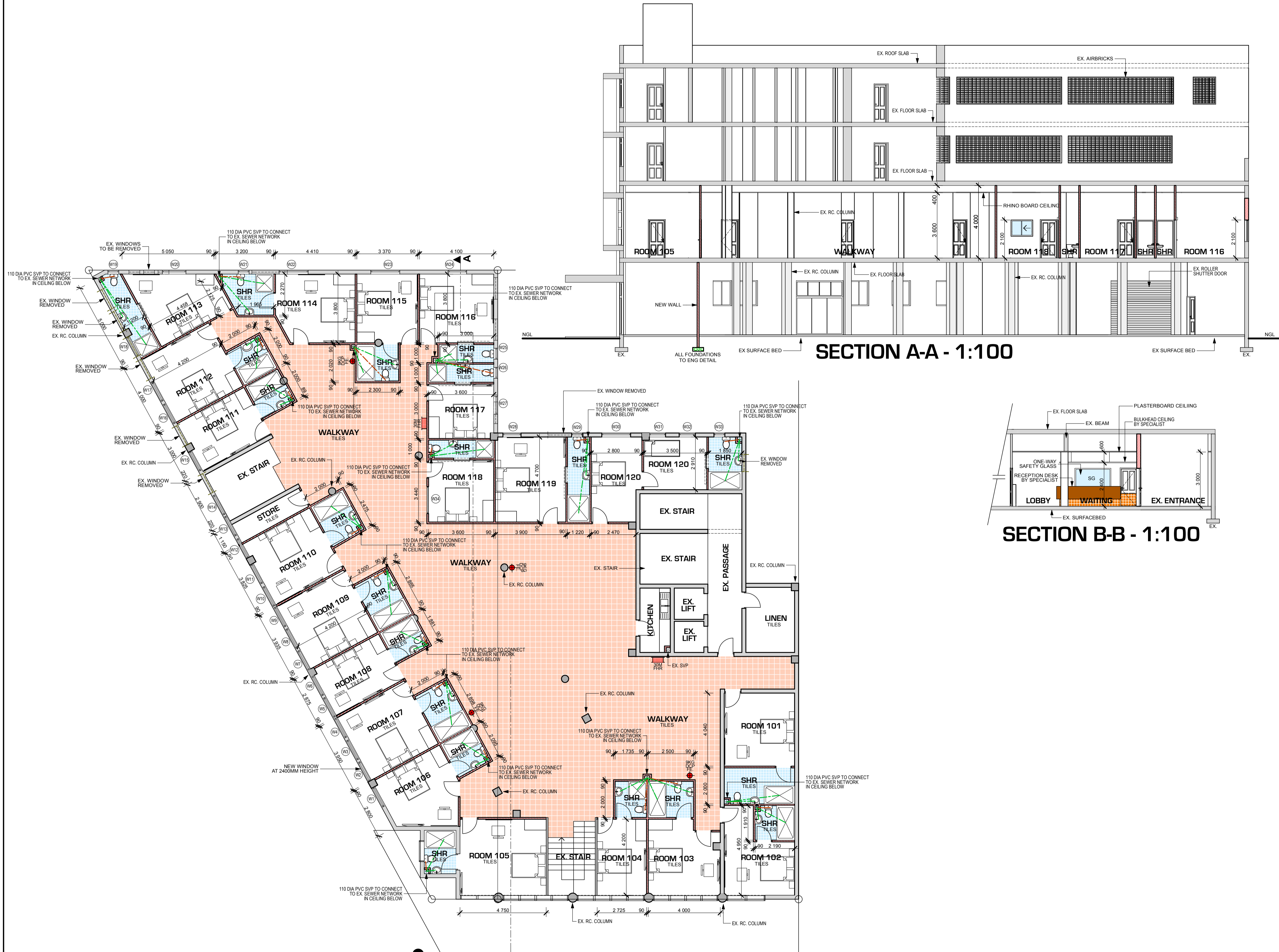
SECTION A-A - 1:100