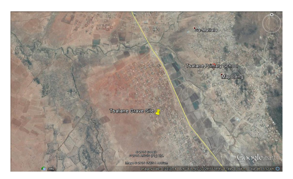
Fig 1. Map showing location of the burial in Tsatane Village.

Rural electrification is part of government's on-going programme to provide basic needs in rural areas. Operation was suspended immediately after the discovery. Members of the South African Police Service were informed and they visited the site on 29 March 2015 and prepared a record for their files.