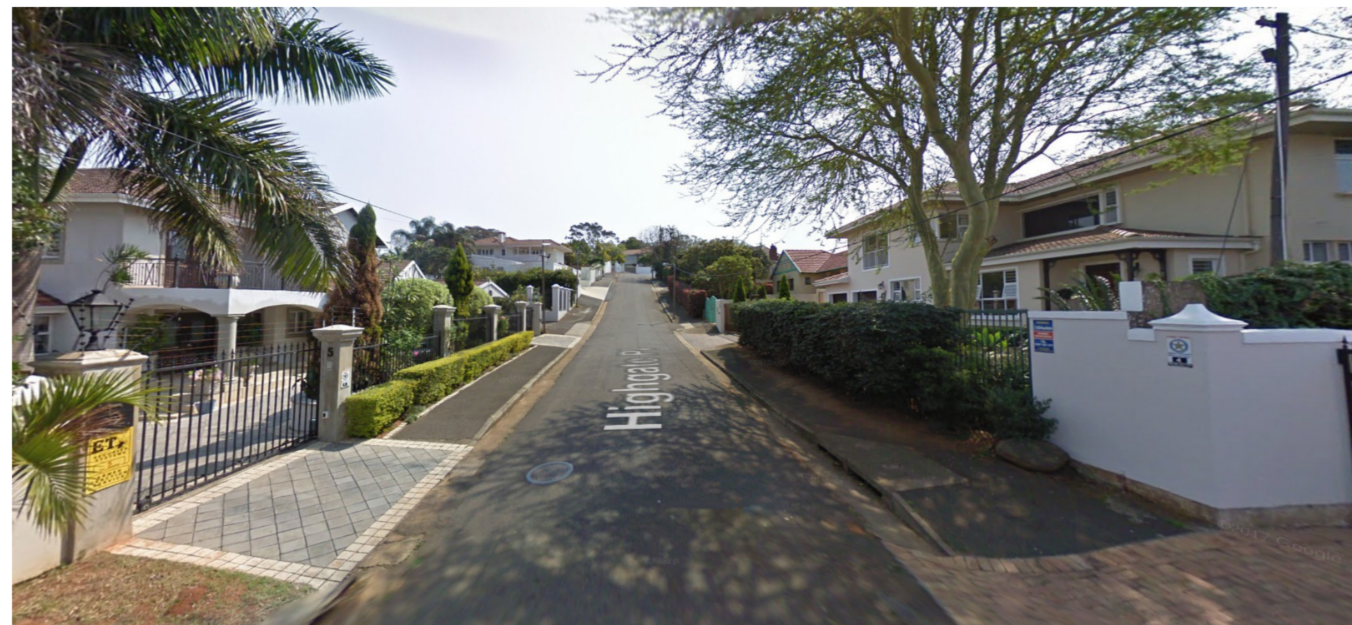
STREET VIEW LOOKING UPHILL / WESTWARDS