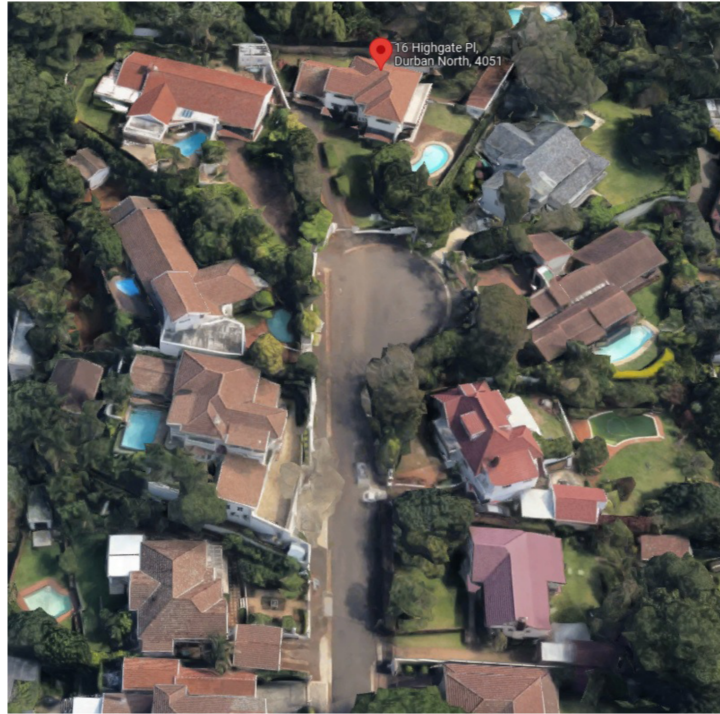
HIGHGATE PLACE - CONTEXT

THE HOME IS THE ONLY ONE OF ITS TYPE ON THE ROAD. ALL THE OTHER PROPERTIES ARE PLASTERED.