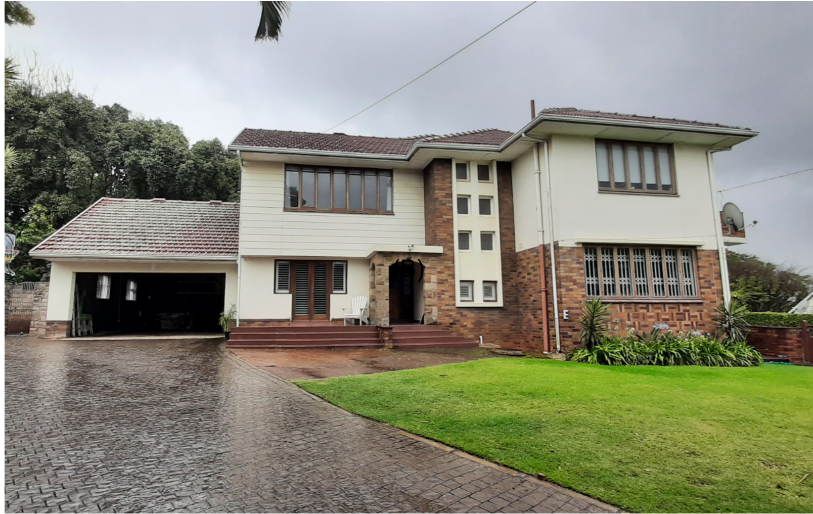
Front Elevation - Stone arch and win-block windows est. added later than main original part of house.

THIS FAÇADE WE ESTIMATE WAS ALTERED LATER THAN THE MAIN ORIGINAL PART OF THE HOME PARTICULARLY THE SQUARE WIN-BLOCK WINDOWS AND STONE ARCH (B).