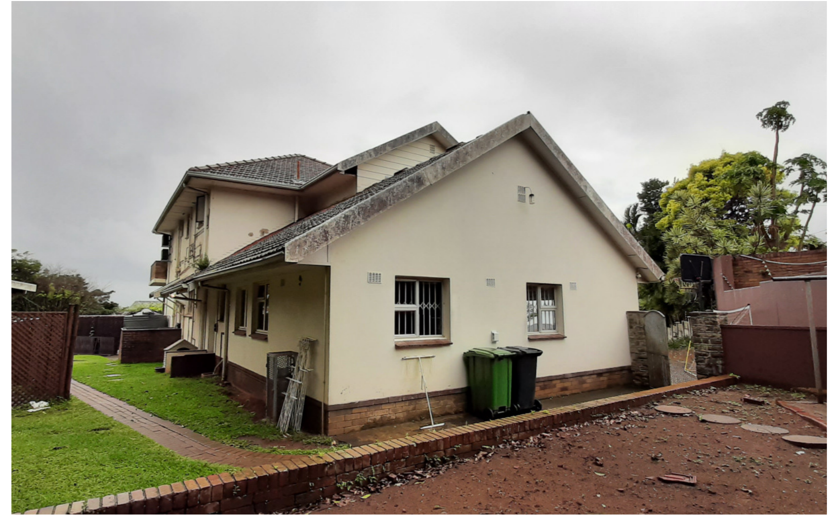
Other elevations of house - plaster and paint dominant.