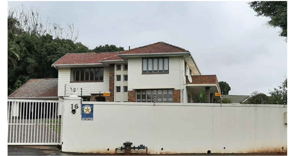
16 HIGHGATE PLACE