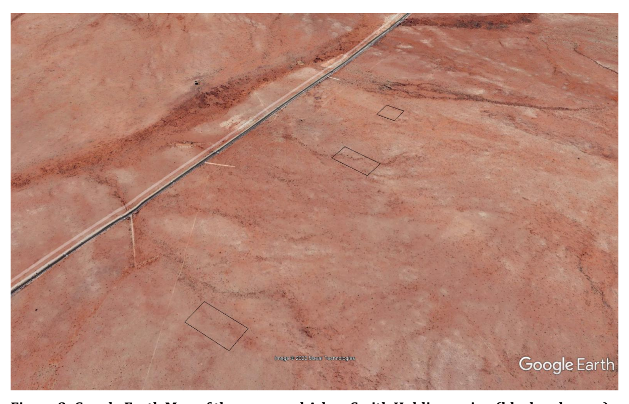
Figure 2: Google Earth Map of the proposed Adam Smith Holdings mine (black polygons) adjacent to the road and railway line. Note previous mining impact.