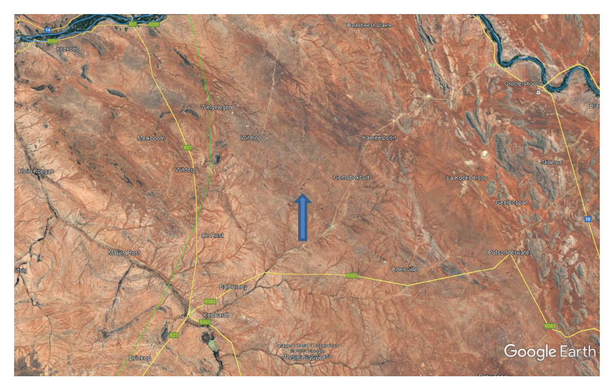
Figure 1: Google Earth map of the general area to show the relative land marks and the Adam Smith MRA areas (black) is indicated with the arrow.