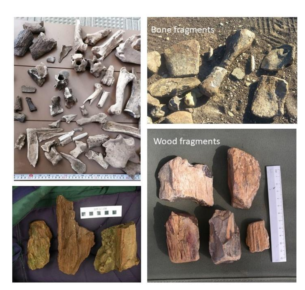
Figure 6: Photographs of fragmented and transported fossils from Quaternary deposits.

9. Appendix A – Examples of fossils from the Quaternary fluvial and pan settings