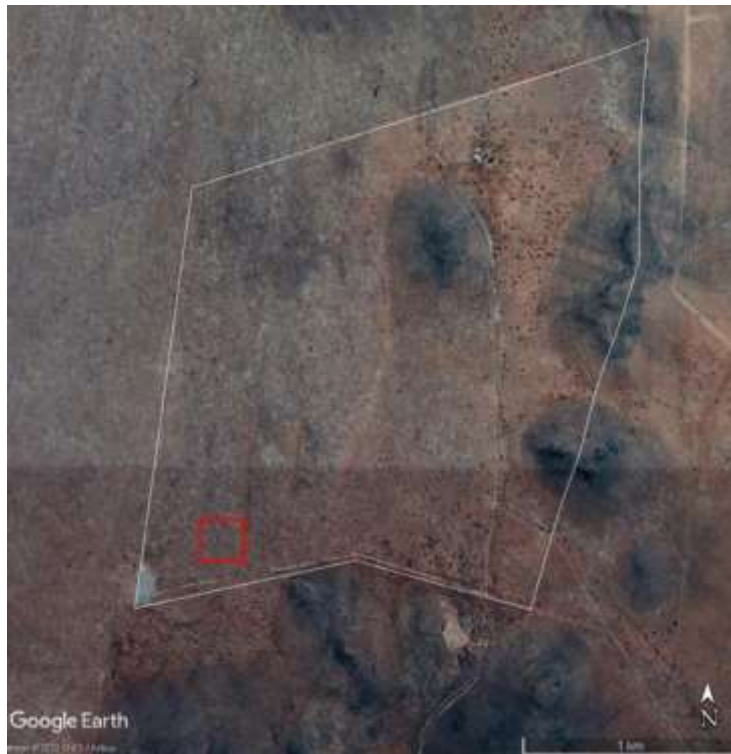
Figure 1: Position of the proposed BESS in red, in the lower south-west corner near the substation.