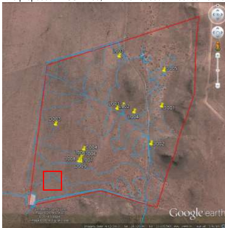
Figure 2: Location of BESS (red) with respect the survey paths and recorded sites (Google Earth 2014).