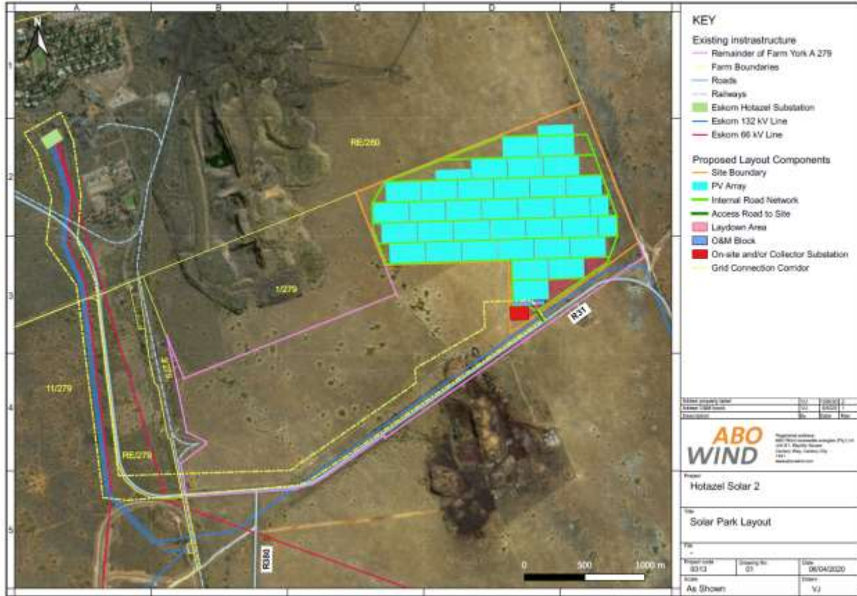
Figure 1. Layout of Hotazel 2, showing the location of the facility within the property (study area) as well as the grid connection corridor to the Eskom Hotazel Substation.