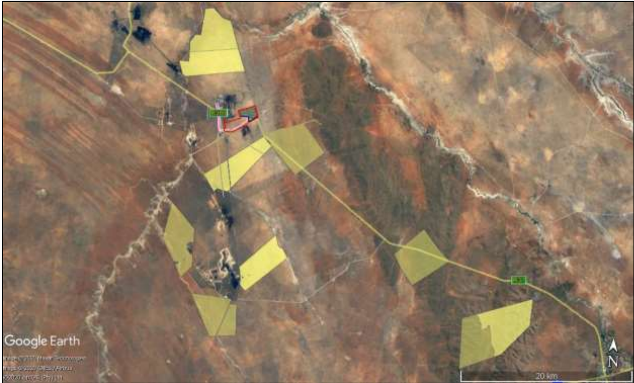
Figure 6. Map of other renewable energy projects near the site. It is important to note that these are the cadastral units and not the actual footprint of the developments, which is usually only a small proportion of the unit.

of high significance as avifaunal habitat or breeding area for species of concern. The overall extent of cumulative impact due to the solar energy development in the area is seen to be relatively low and the contribution of the current development to cumulative impact is seen as low and of local significance only. The specific contribution of the current development is up to 230ha of habitat loss which is seen to have a largely local impact.