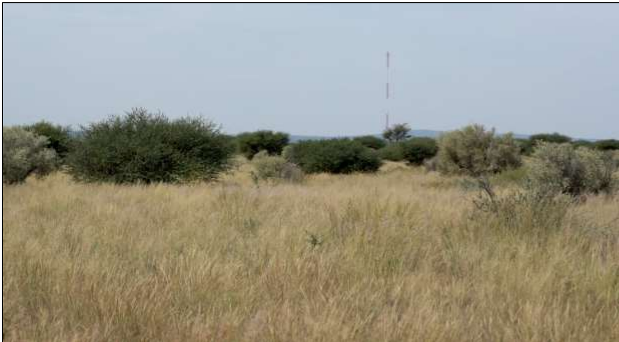
Figure 5. The south-eastern corner of the development area, showing the higher density of trees in this area which are comprised mostly of Senegalia mellifera with occasional Vachellia haematoxylon and V.erioloba .