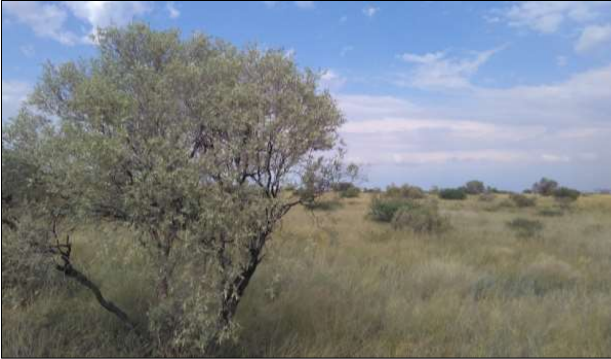
Figure 4. Acacia haematoxylon savanna within the eastern half of the study area, showing the typical vegetation and avifaunal habitat within the footprint of the Hotazel 2 Solar Facility.