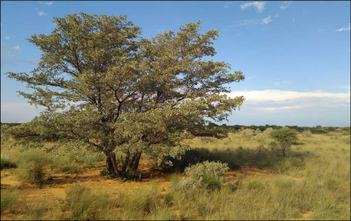
Figure 2. Acacia haematoxylon and Acacia mellifera savanna within the western half of the study area. The Terminalia sericea tree in the foreground is a rare occurrence on the property. This area is outside of the Hotazel 2 footprint.

Eragrostis and the species Schmidtia pappophoroides . This microhabitat is considered to have a Medium sensitivity from an avifaunal perspective.