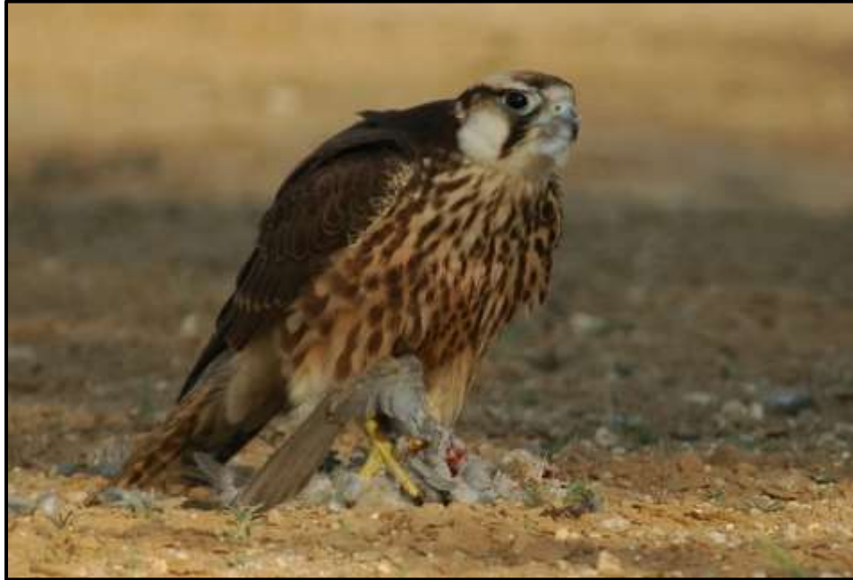
The Vulnerable Lanner Falcon Falco biarmicus (immature)