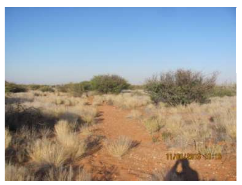
Plate 3: Showing one of the larger drainage channels that will be avoided by the development