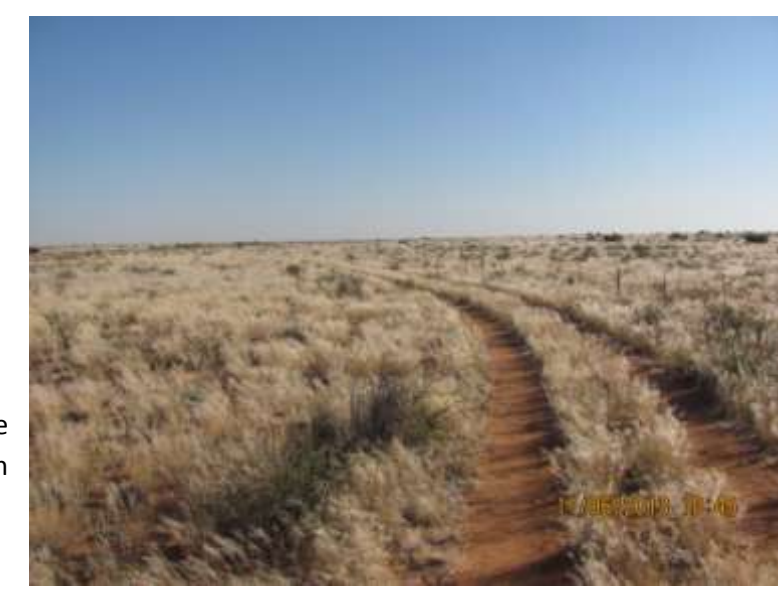
Plate 4: Showing the existing access track on the property.