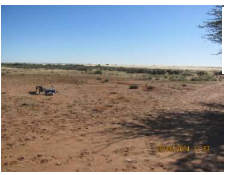
Plate 1: Showing section of overgrazed veld in the vicinity of one of the boreholes to the south of the RE Capital 11 Study site.