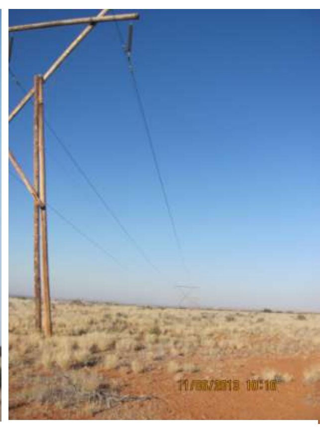
Plate 7: Showing the existing 132 KV power line.