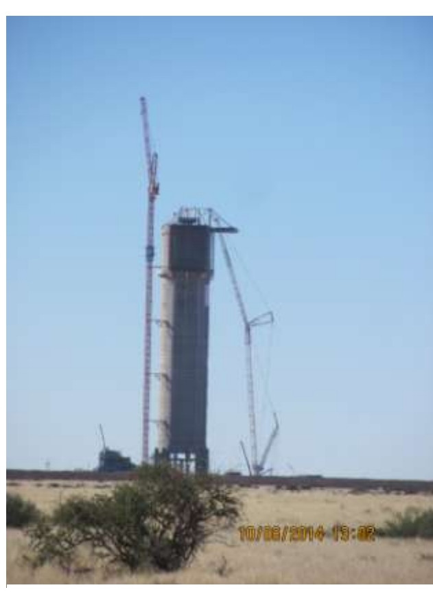
Plate 6: Showing the Existing Khi Solar One – Concentrated solar project (CSP) on the adjacent property.