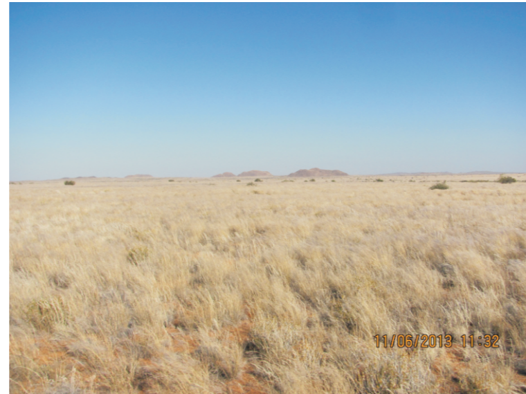
Figure 4: Typical vegetation and topography on central site alternative.