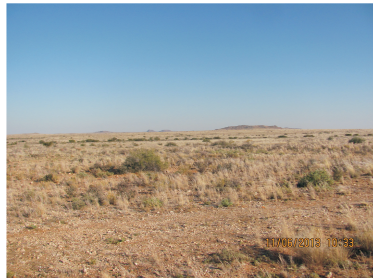
Figure 6: Showing typical vegetation and topography on norther site alternative.