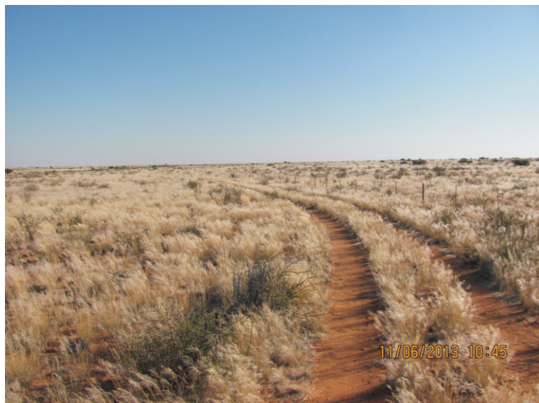
Figure 3: .Showing existing access track on the property.