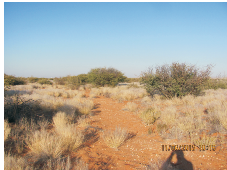
Figure 5: Showing main drainage channel on the property.