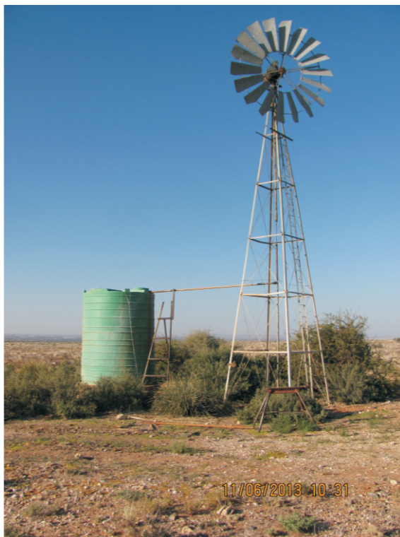
Figure 8: Showing existing borehole on site which is been investigated as a potential water source for the washing of panels.