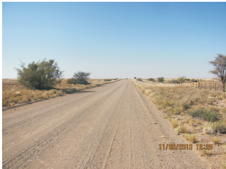
Figure 2: Showing District Road D3276