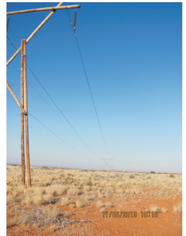
Figure 9: Existing 133Kv Powerline on the adjacent property.