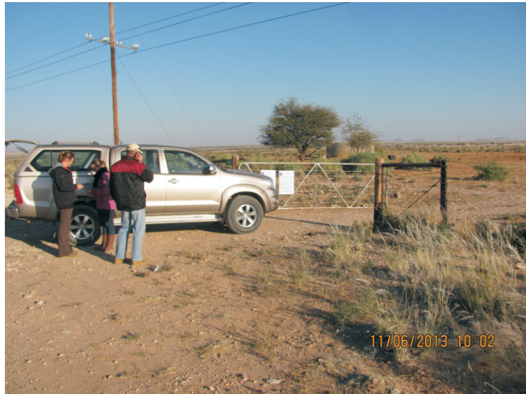
Figure 1: Showing existing farm access off the N14