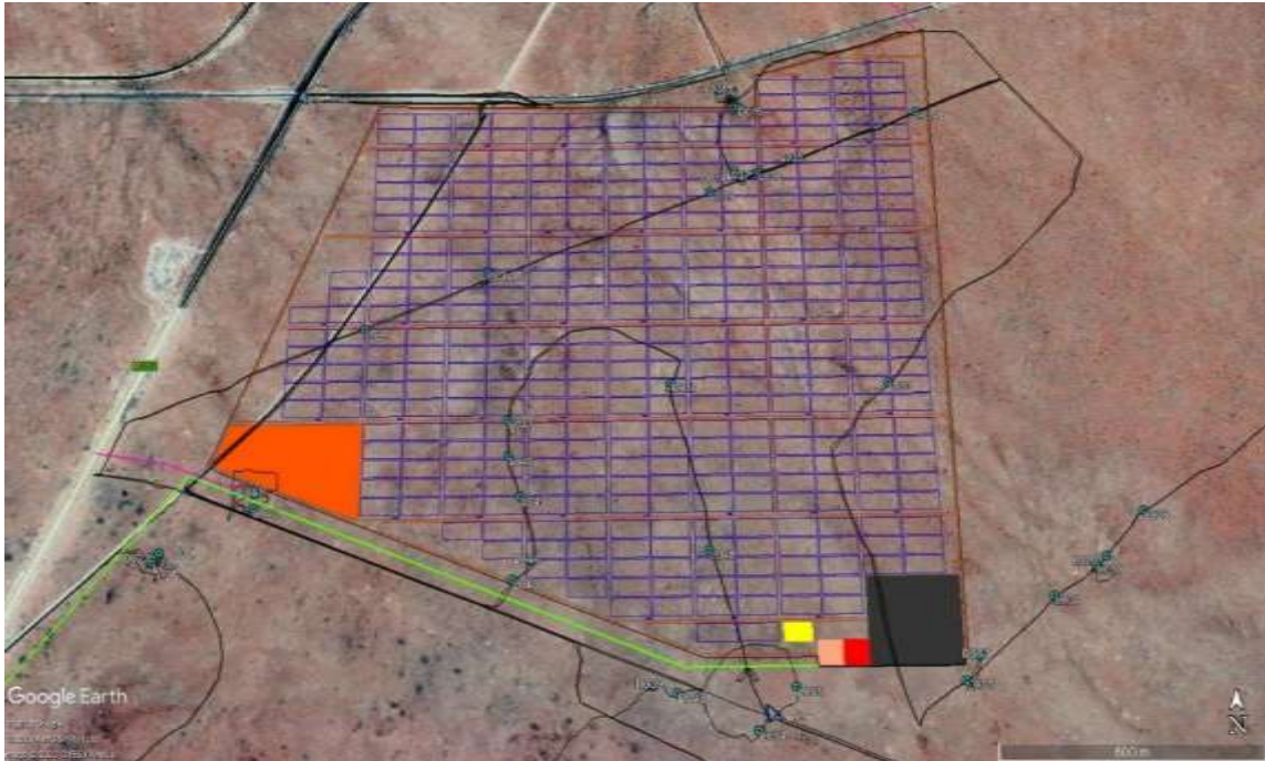
Figure 2: Location of BESS with respect the survey paths and recorded sites (Google Earth 2014).