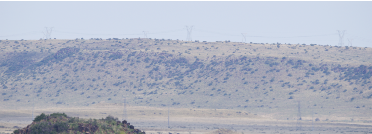
Figure 12: View of the existing OHL's spanning farm Carolus Poort in the foreground (30°39'17.02"S; 24°12'25.30"E, Direction NW).