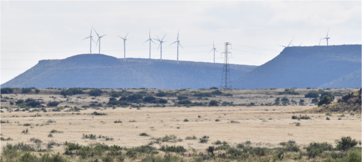
Figure 14: View of the existing OHL's spanning farm Slingershoek with the De Aar South windfarm in the background (30°39'5.63"S; 24°12'58.95"E, Direction N).