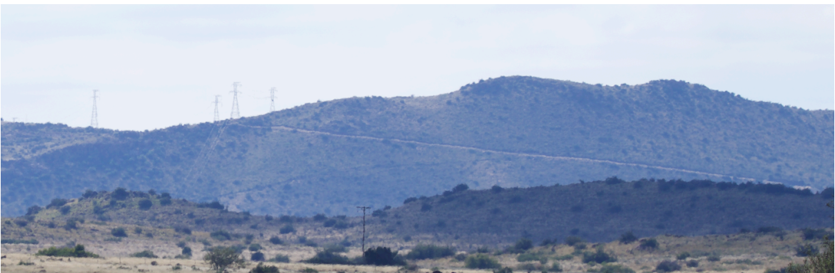
Figure 13: View of the existing OHL's spanning farm Slingershoek and heading up the ridgeline to Farm Vendussie Kuil (30°37'45.49"S; 24°14'19.65"E, Direction NE).