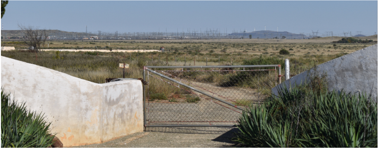
Figure 7: View from one of the farmstead access roads towards the Hydra MTS. Note the wind turbines on the ridge in the background (30°42'34.74"S; 24° 7'22.96"E, Direction WSW).