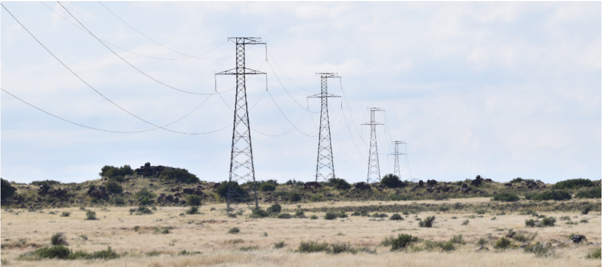
Figure 15: View of the existing OHL's spanning farm Carolus Poort (border of Portion 3 and 4 on the ridgeline) this is where Section A (new OHL) and B (Upgraded OHL) will connect (30°38'28.01"S; 24°12'1.85"E, Direction SW).