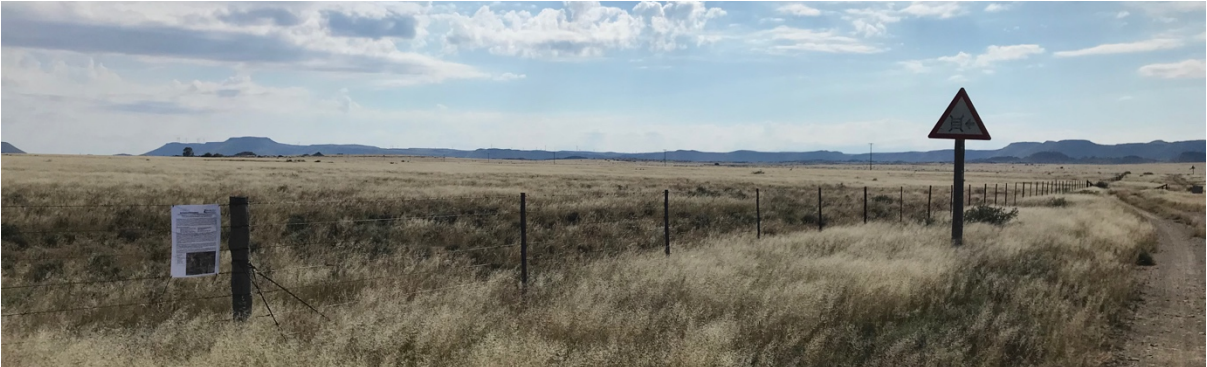
Figure 11: View of the properties over which the proposed OHL's will span, Carolus Poort in the foreground and Slingershoek in the background (30°40'36.11"S; 24°13'18.69"E, Direction NW).