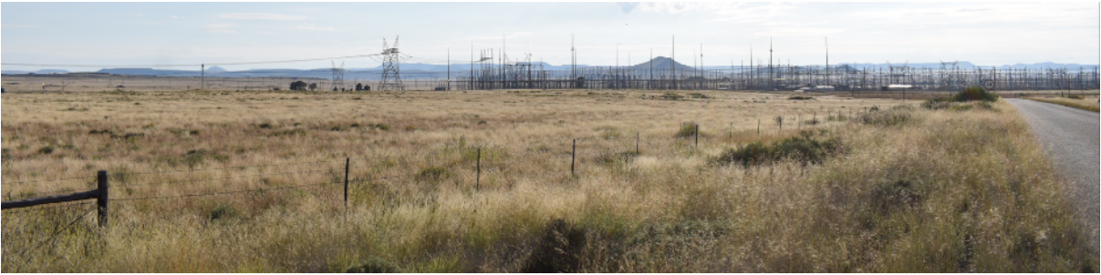
Figure 3: Access road from the N10 towards Hydra MTS in the background (30°43'4.47"S; 24° 4'33.16"E, Direction NE).