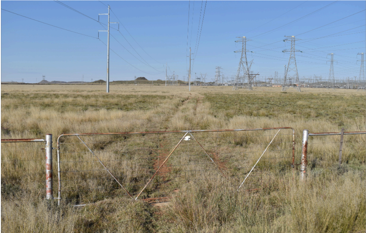
Figure 4: Existing OHL's feeding into Hydra MTS. The proposed OHL will run in parallel to these existing lines along Section B. Note the nature of the track required for maintenance of the OHL (30°42'35.40"S; 24° 5'52.22"E, Direction SW).