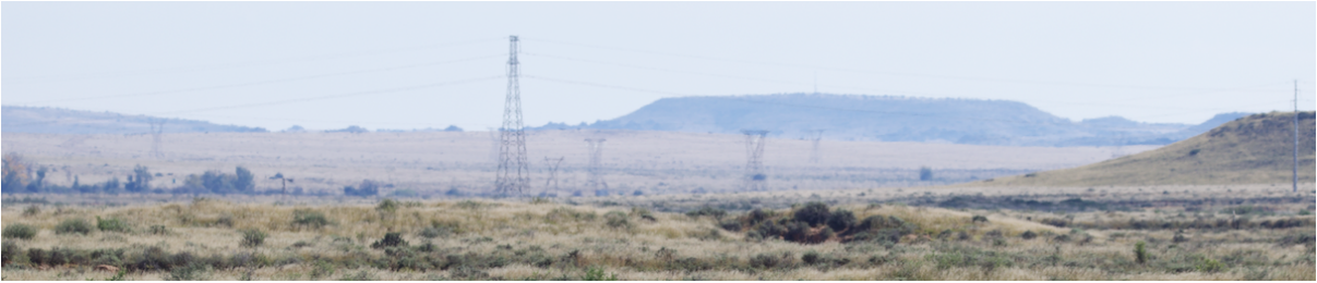
Figure 10: View of existing OHL's on Carolus Poort along which the proposed OHL will run (30°41'21.04"S; 24° 7'25.53"E, Direction NW).