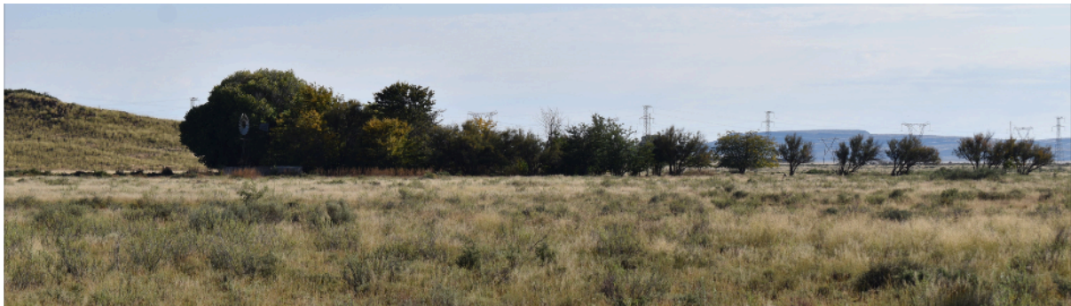
Figure 5: Typical landscape in the area with trees close to farmsteads and waterholes and the rest of the area dominated by low karoo vegetation with a strong grass element evident after good seasonal rains. OHL's visible in the background (30°42'32.47"S; 24° 6'13.93"E, Direction N).