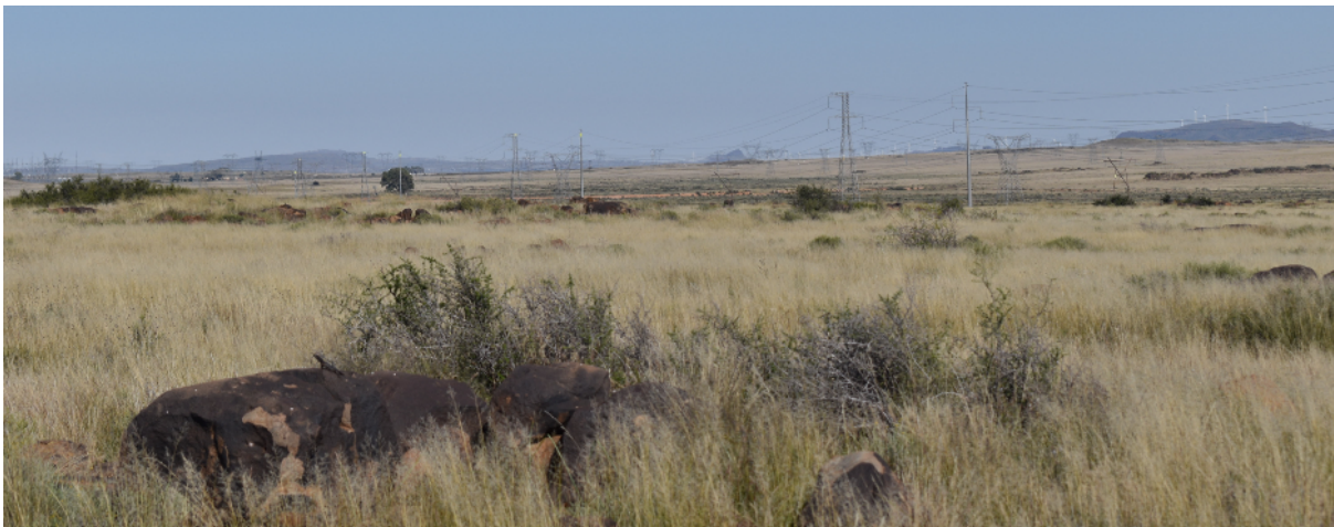
Figure 8: View of existing OHL's on Farm Wag 'n Bietjie (30°41'55.52"S; 24° 7'32.97"E, Direction WSW).