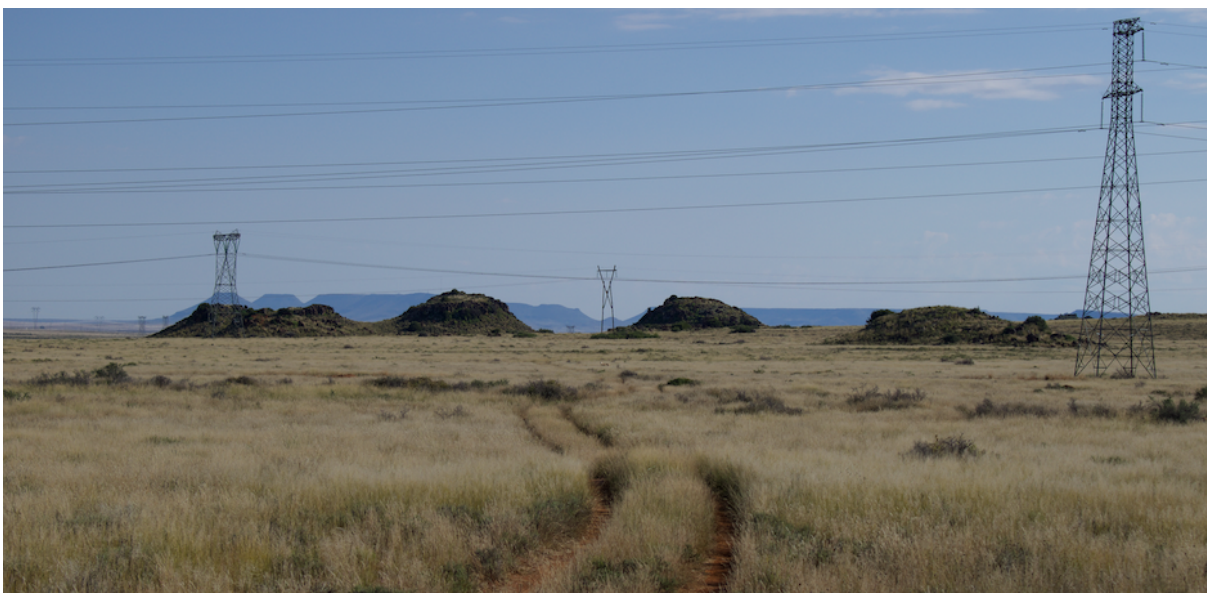
Figure 9: View of existing OHL's on Farm Wag 'n Bietjie along which the proposed OHL will run (30°41'21.04"S; 24° 7'25.53"E, Direction NW).