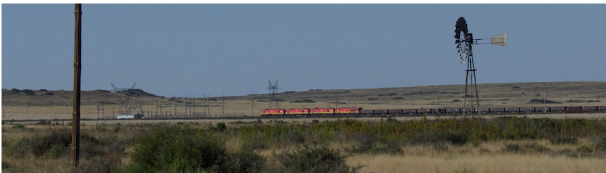
Figure 6: Railway line which crosses the proposed OHL route just before the Hydra MTS (30°42'45.26"S; 24° 6'54.83"E, Direction SE).