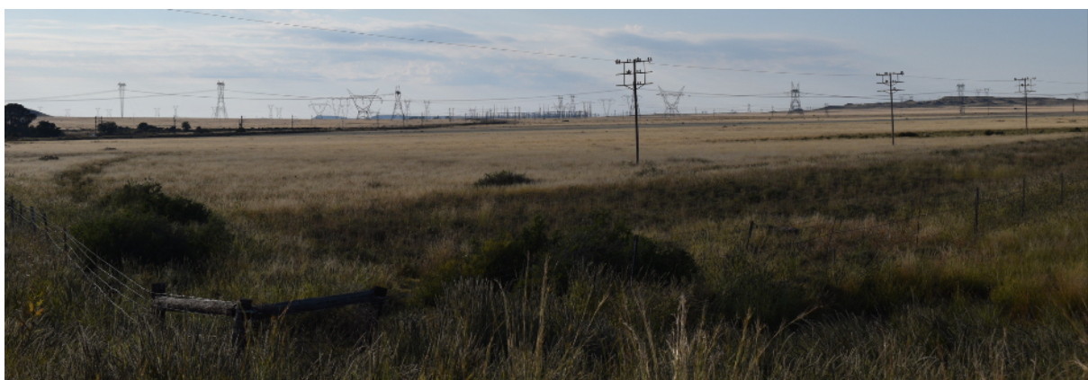
Figure 1: Hydra MTS where the proposed Castle to Hydra OHL will connect into the national Eskom grid in the background with numerous transmission lines feeding into it in the foreground ( 30^{\circ}42'0.59''S ; 24^{\circ}2'31.68''E , Direction SE).