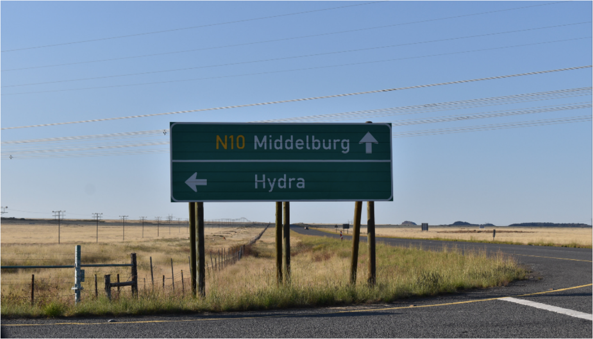
Figure 2: Turnoff towards Hydra MTS from the N10 (30°43'21.14"S; 24° 3'36.48"E, Direction SE).