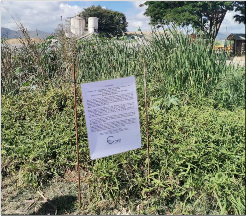
Figure 1: Proof of site notice placed at 25° 30'14.88"S 31° 29'57.77"E