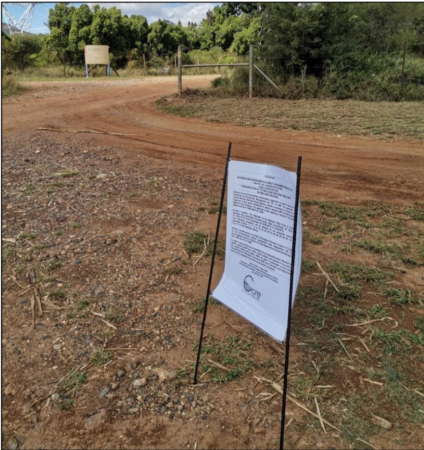
Figure 2: Proof of site notice placed at the Eskom sub-station