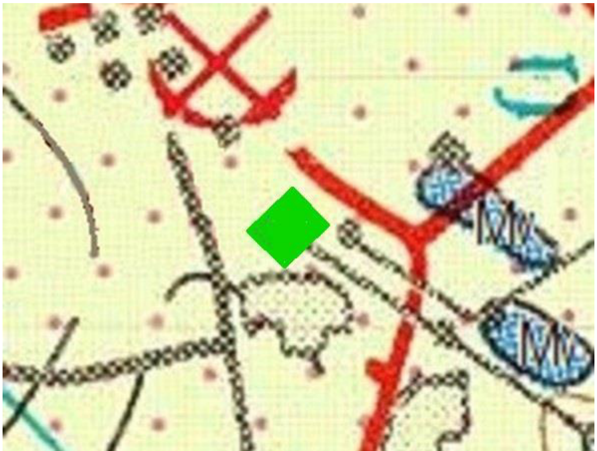
The study area is indicated by the green rectangle.