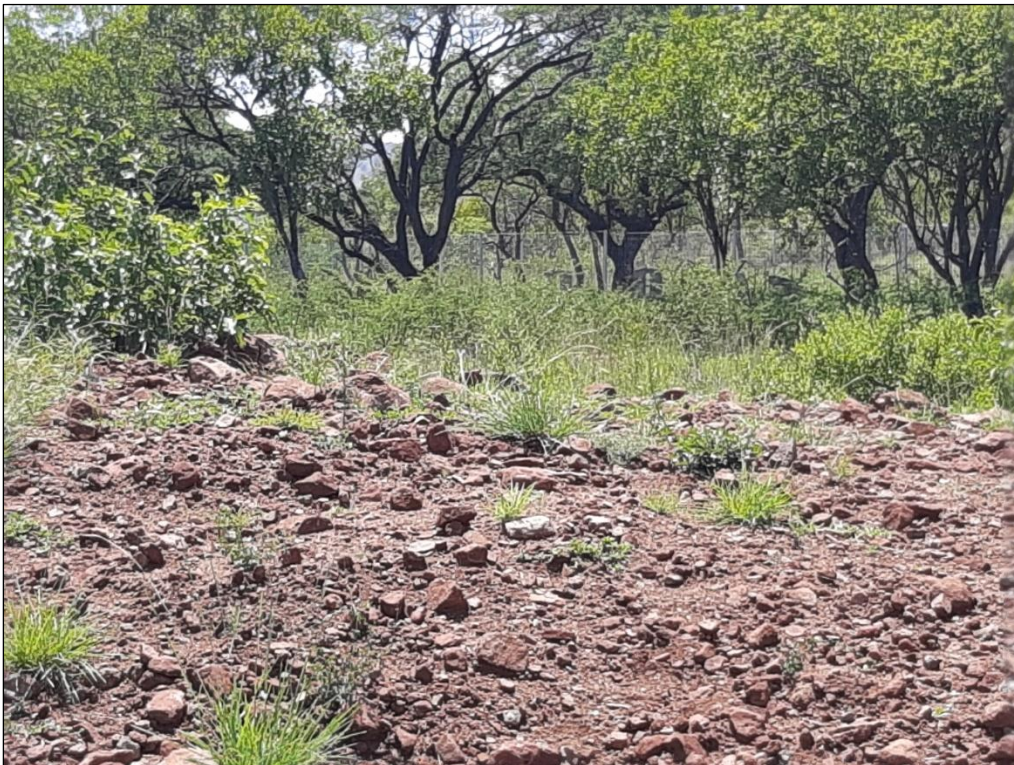
Figure 4: The graves seen from the pipeline at the shortest distance