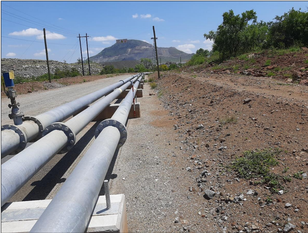
Figure 3: A view of the pipeline at the shortest distance to the graves located on the right side (not in the picture)