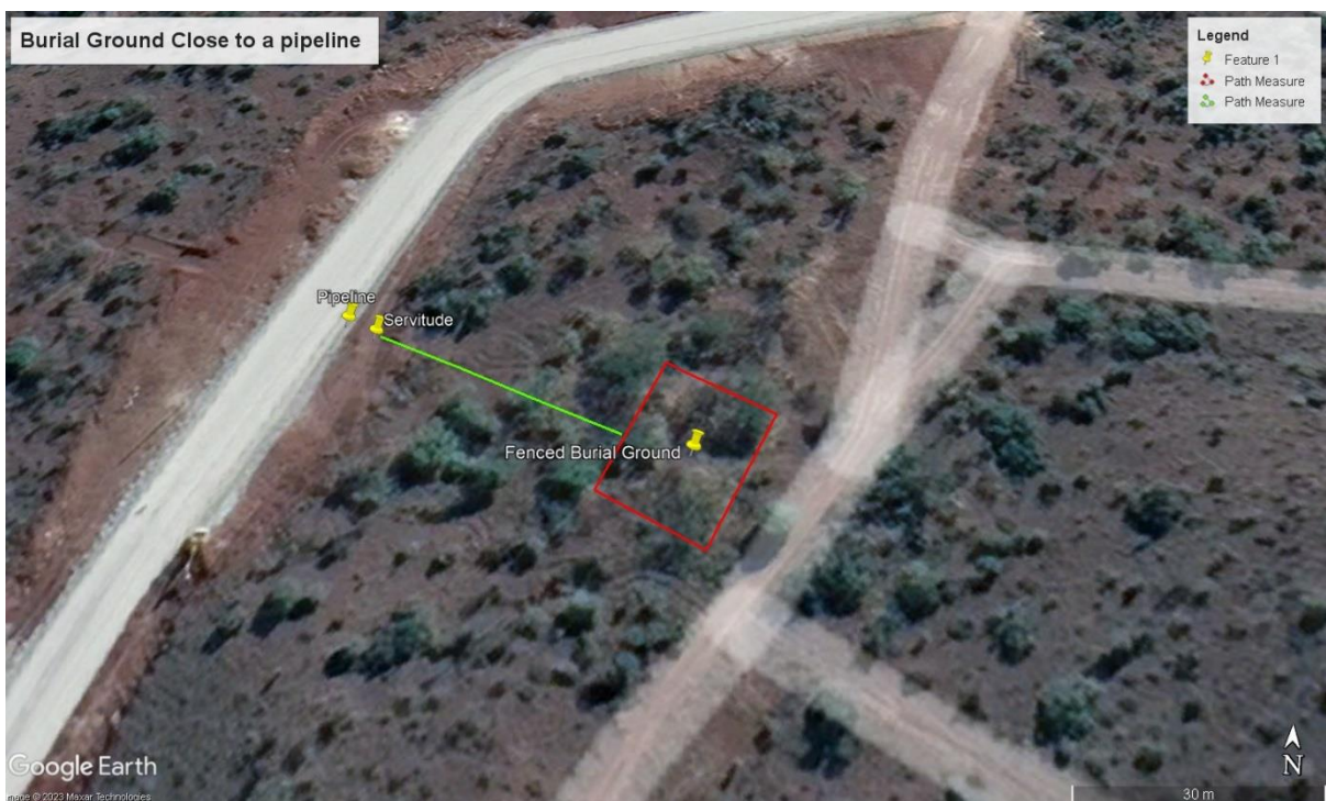
Figure 2: The distance between the graves and the pipeline servitude is 50 m The recommended buffer is 100 m