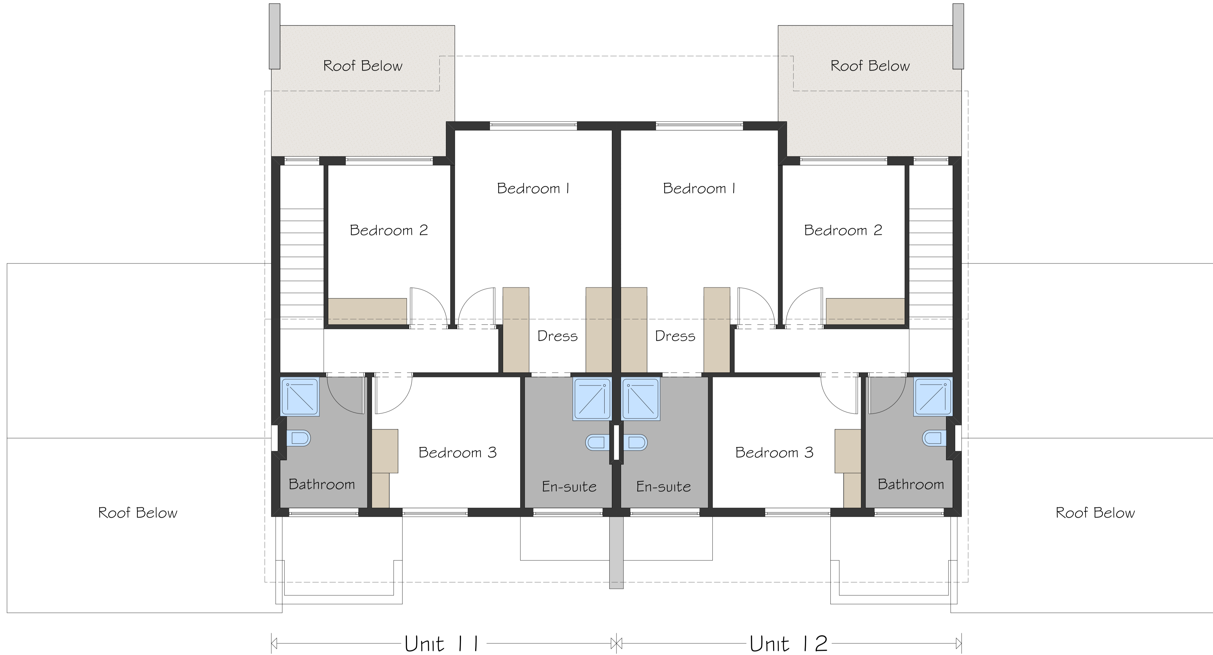
first storey 1:50