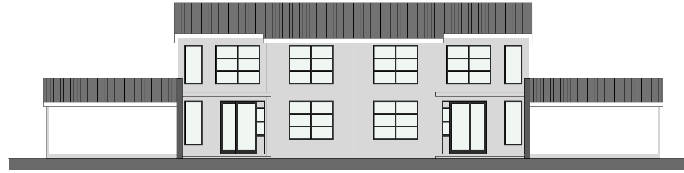
north elevation 1:100