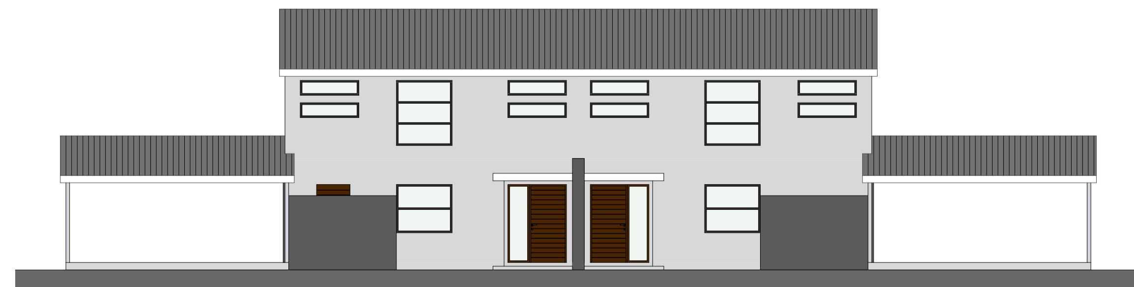
south elevation 1:100