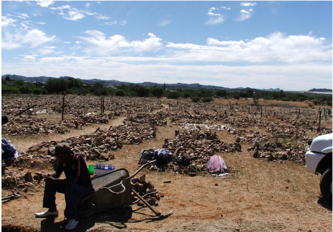
Image of the existing cemetery at Augrabies. Looking at the covering material it can clearly be seen that the underlying material is very hard and inaccessible to a great extent if it must be excavated by manual labour.