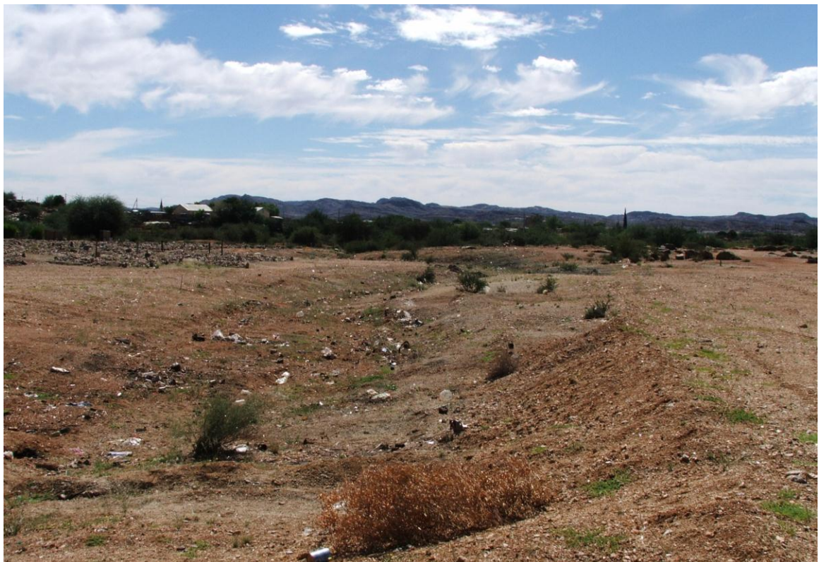
Photo of site looking northeast. The storm water channel can here be seen in the middle of the photo.