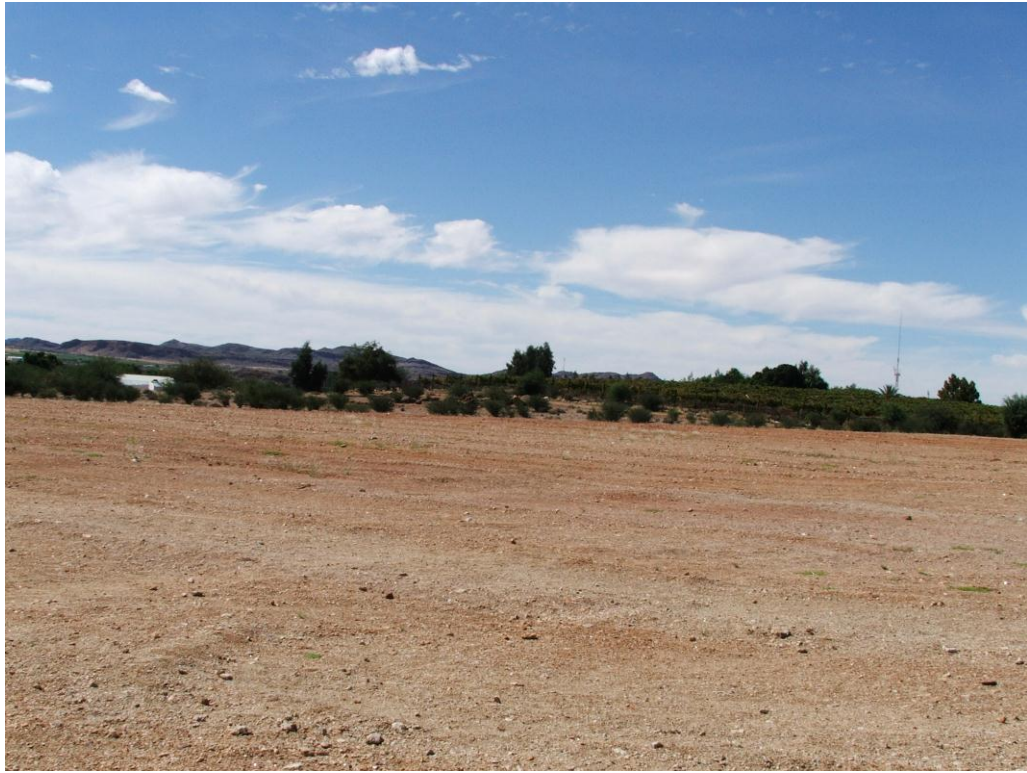
The slight slanting of the proposed site from east to west is shown on the photo.