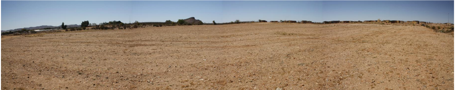
View of the proposed development area