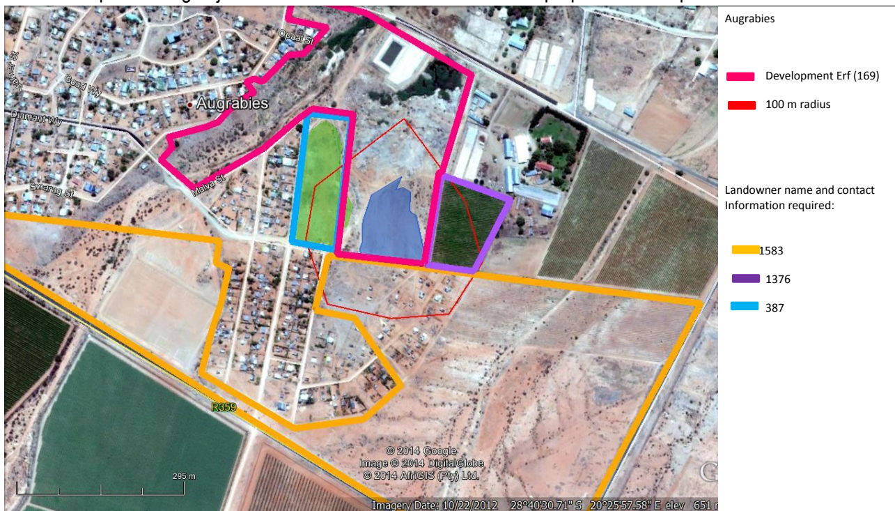
Map indicating adjacent landowners within 100m from the proposed development area:

*Please note that adjacent landowners within the informal settlement were notified by means of a pamphlet distribution process that was undertaken on 19 June 2014.