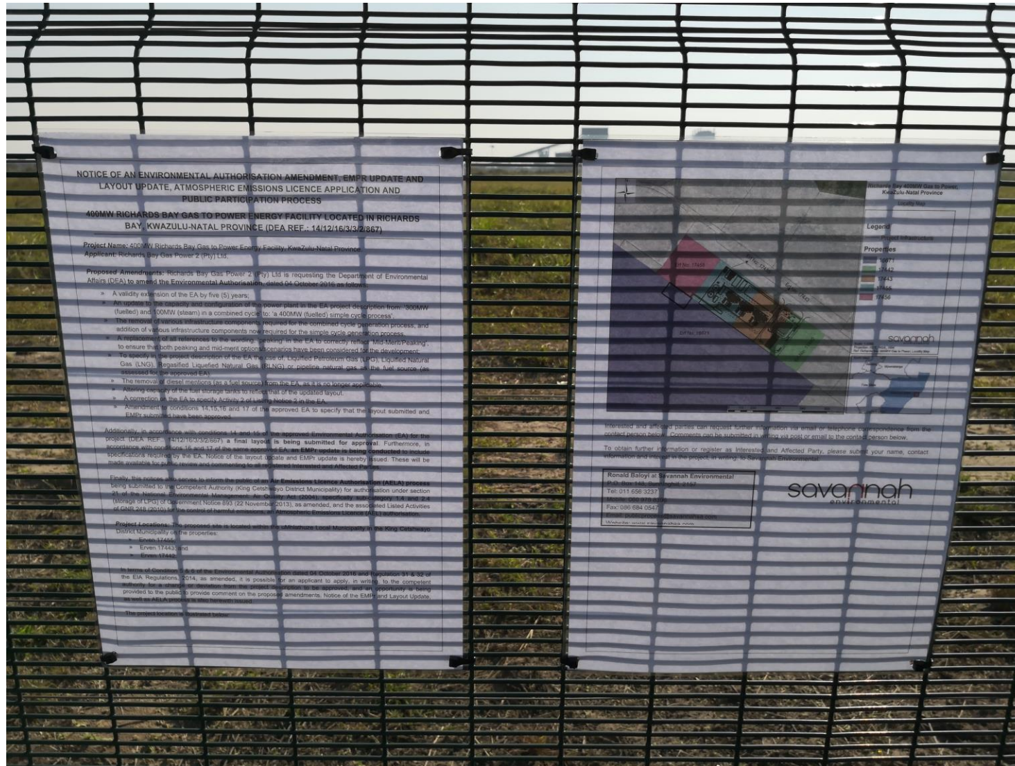
Figure 3: Site notice placed along the boundary fence of the RBIDZ Phase 1F, Alton, Richards Bay (28°44'49.32"S; 32° 1'57.06"E).