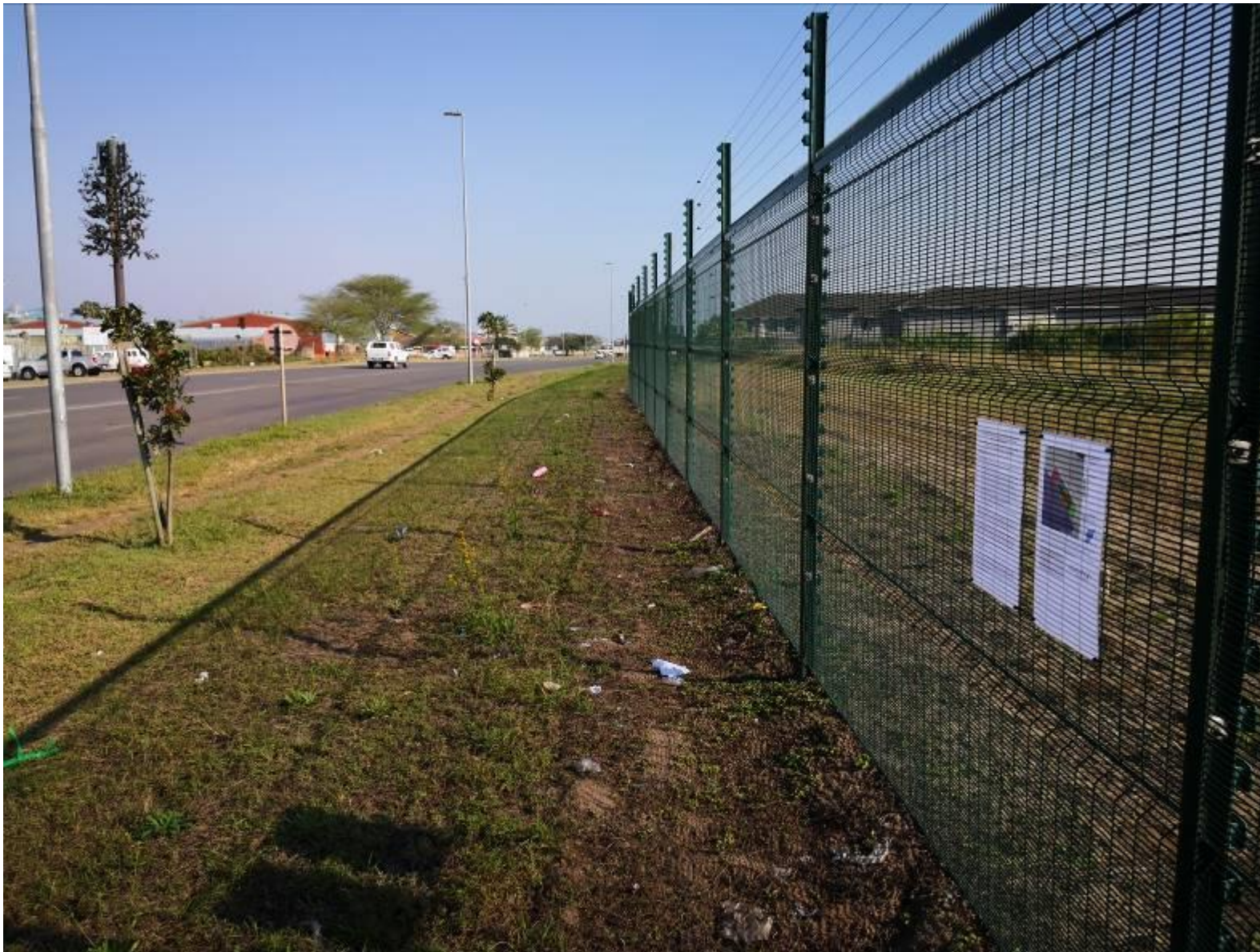
Figure 4: Site notice placed along the boundary fence of the RBIDZ Phase 1F, Alton, Richards Bay (28°44'49.32"S; 32° 1'57.06"E).