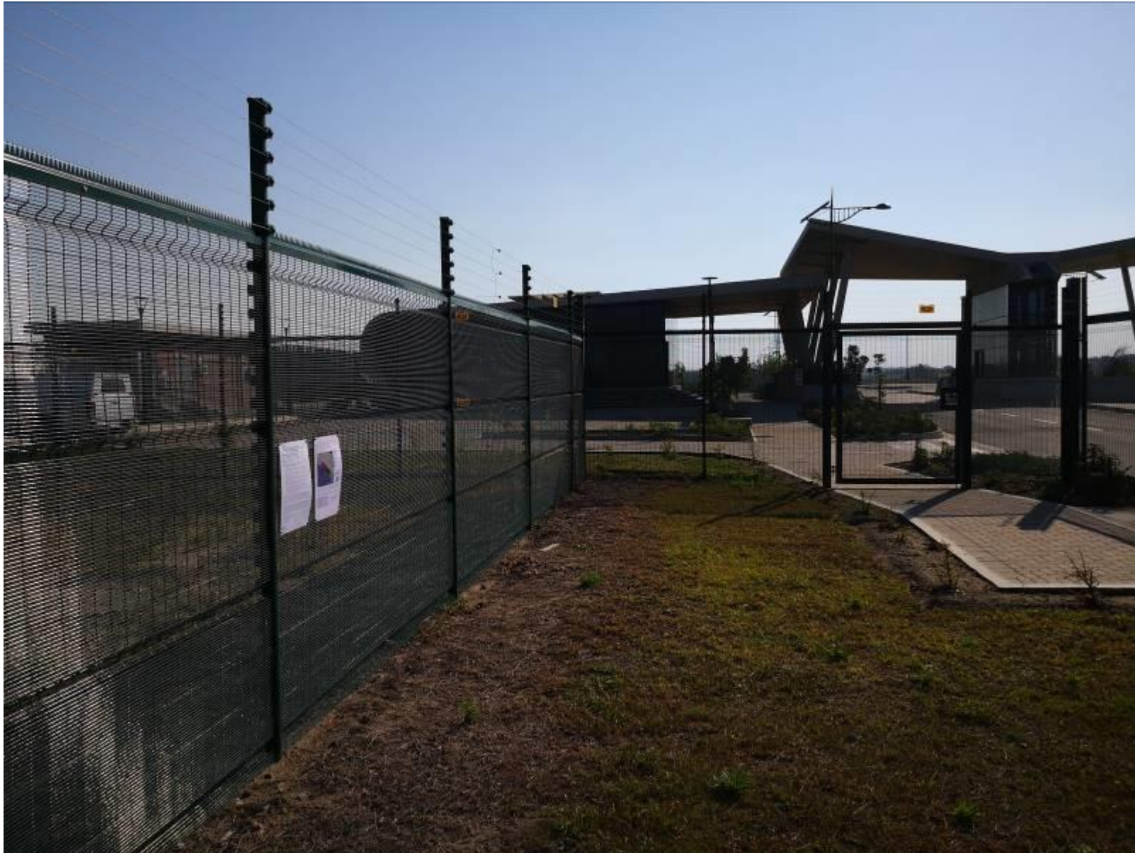
Figure 2: Site notice placed at the site entrance immediately off Alumina Allee Street, Alton, Richards Bay (28°44'34.96"S; 32° 1'59.11"E).