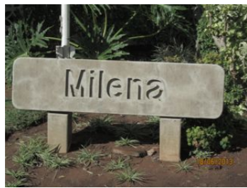
"E" : Milena - Administration Building