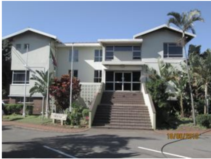
"E" : Milena - Front - West Elevation