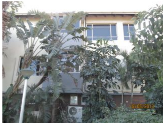
"E" : Milena - South Elevation