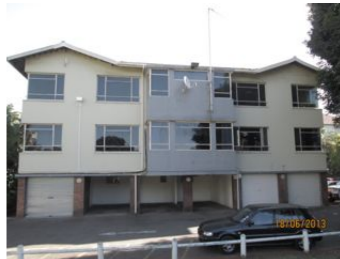
"E" : Milena - East Elevation