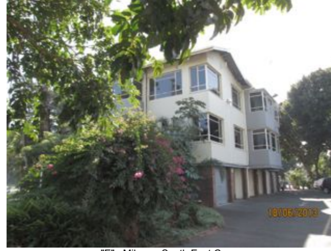
"E" : Milena - South East Corner