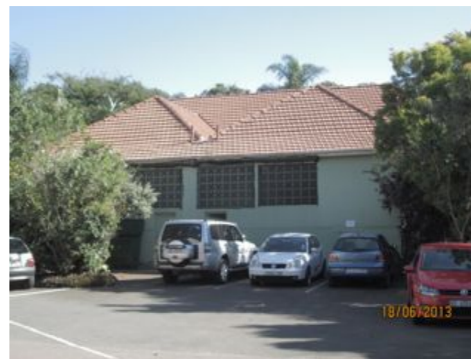
"D" : Administration Building