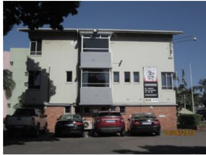
"E" : Milena - North Elevation