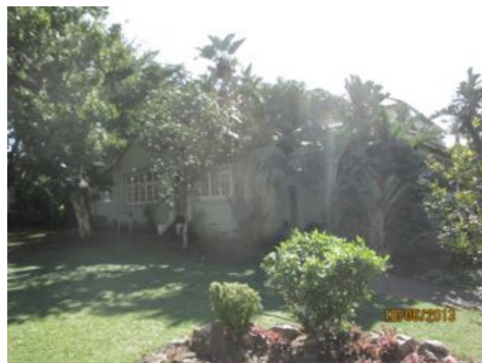
"D" : Administration Building