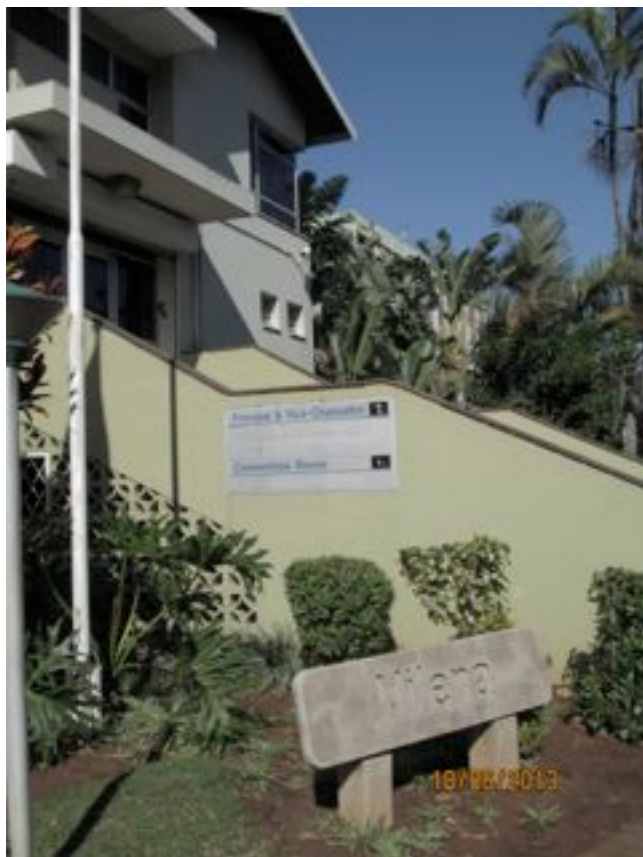
"E" : Milena - Administration Building