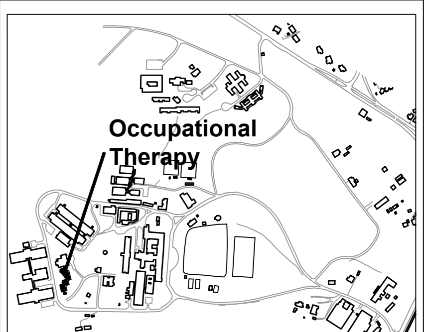
Occupational Therapy Locality Plan Site