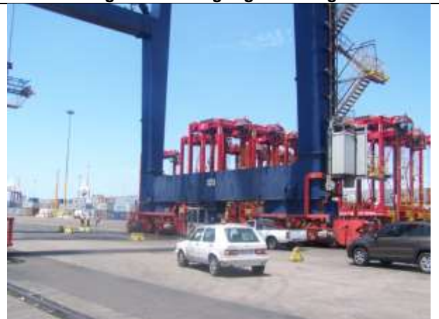
Image 6 – Cranes