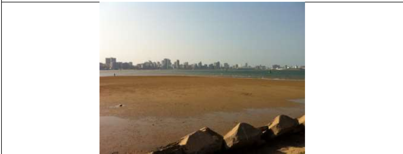
Image 1- View of Central Sandbank from outside of the site