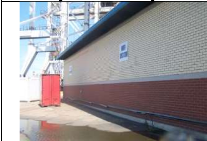
Image 5 – Existing North Substation