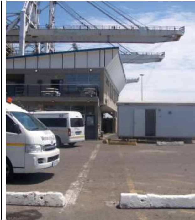
Image 3 – West view – Existing offices