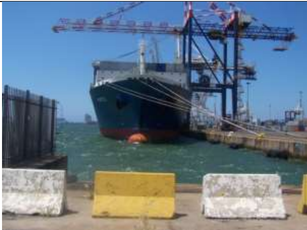
Image 1 – Eastern View – Berth 205