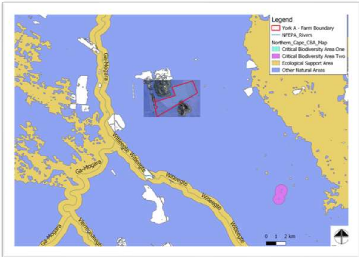
Figure 3: The property in relation to Northern Cape Critical Biodiversity Areas (Holness & Oosthuysen, 2016).

The following figure indicates the Northern Cape Critical Biodiversity Areas, which substantiates that no aquatic related areas are associated with the study area.