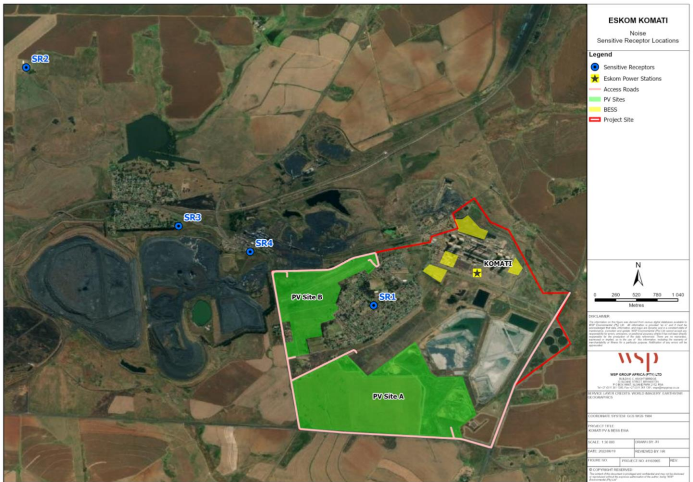
Figure 1: Site layout and sensitive receptors for the proposed project