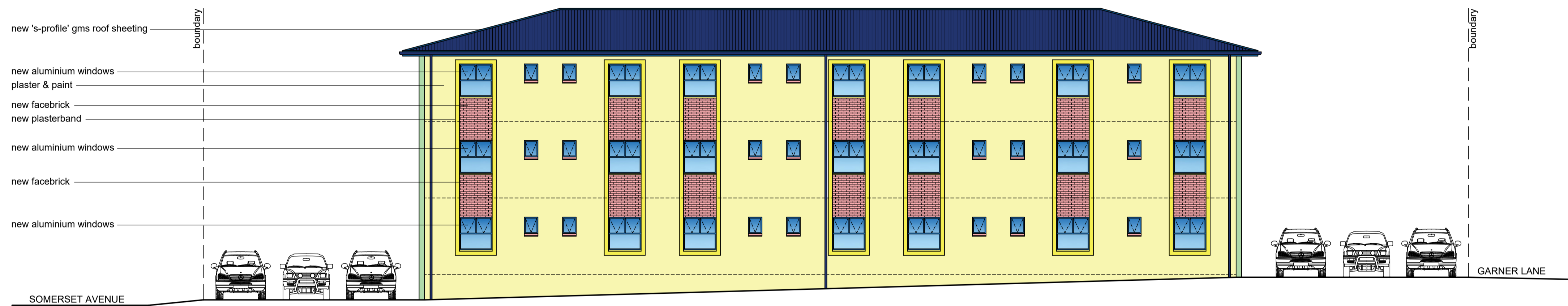
NORTH EAST ELEVATION (1 : 100)