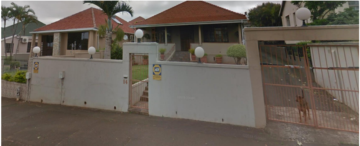
ZK Matthews rd, tinted windows