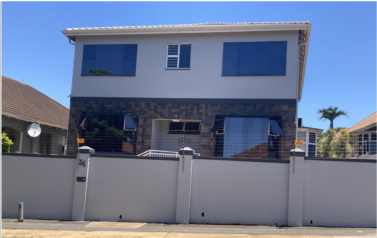
36 Evans rd, Glenwood