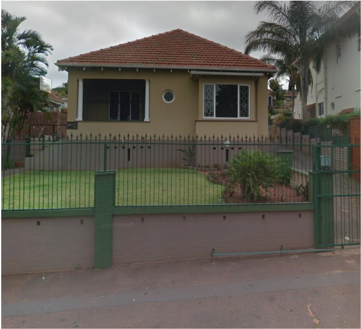
Example of tinted windows, zk Matthews rd