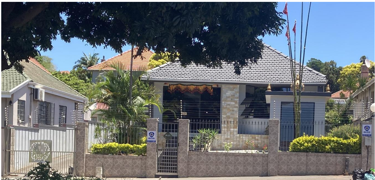
Today, with full tinted windows and front of property structure