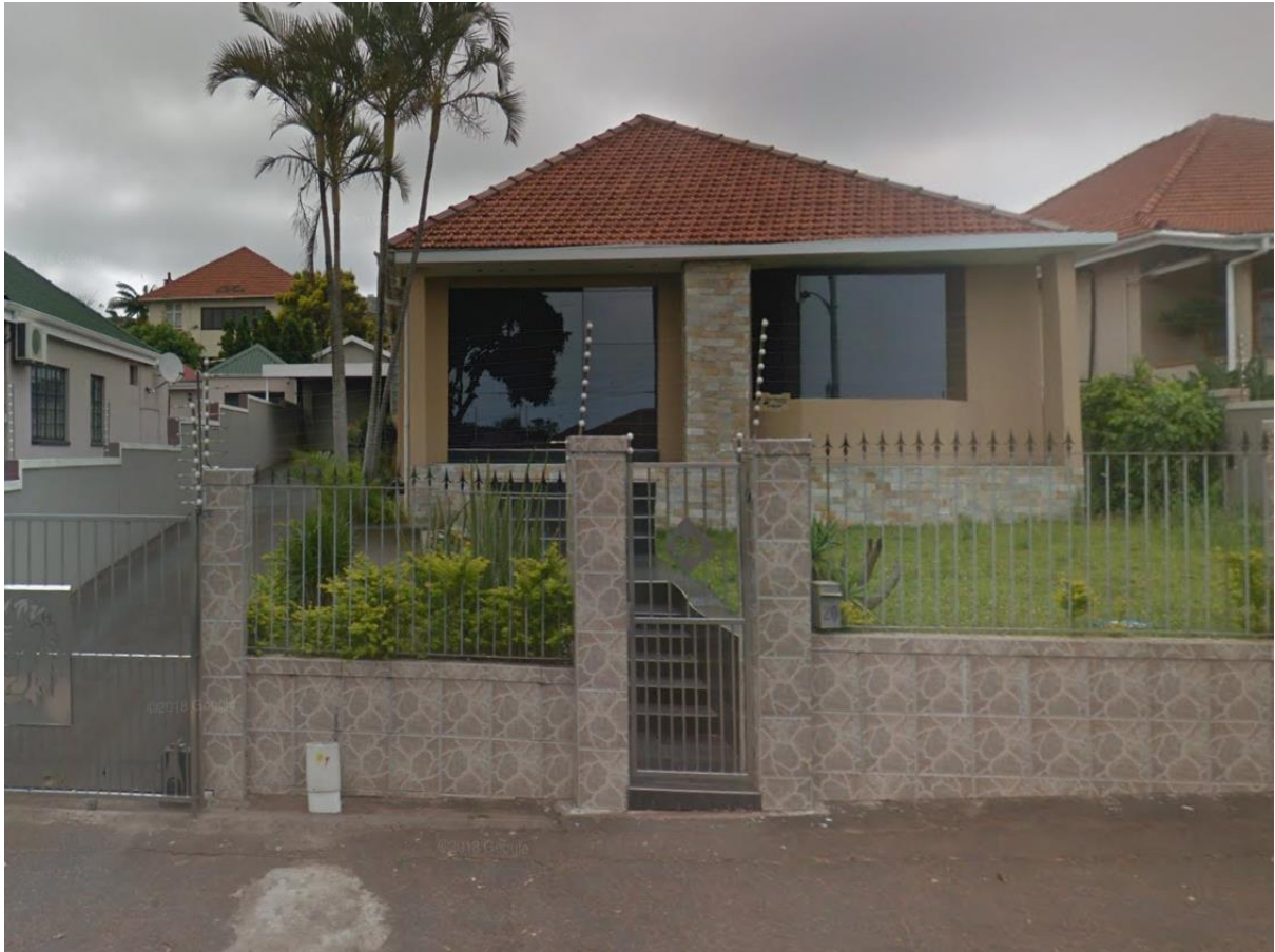
20 ZK Matthews RD, Before, Tinted Windows