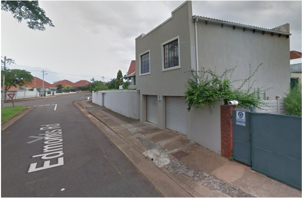
Edmonds rd, Glenwood property on the boundary.