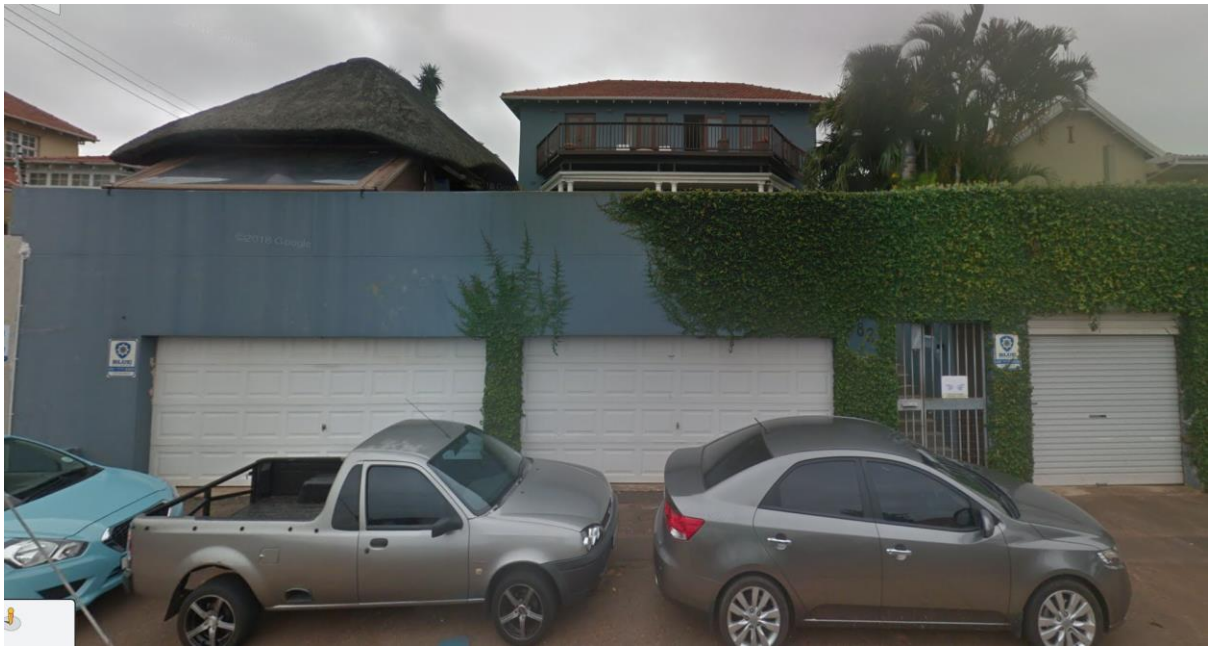
82 ZK Matthews rd, BEFORE