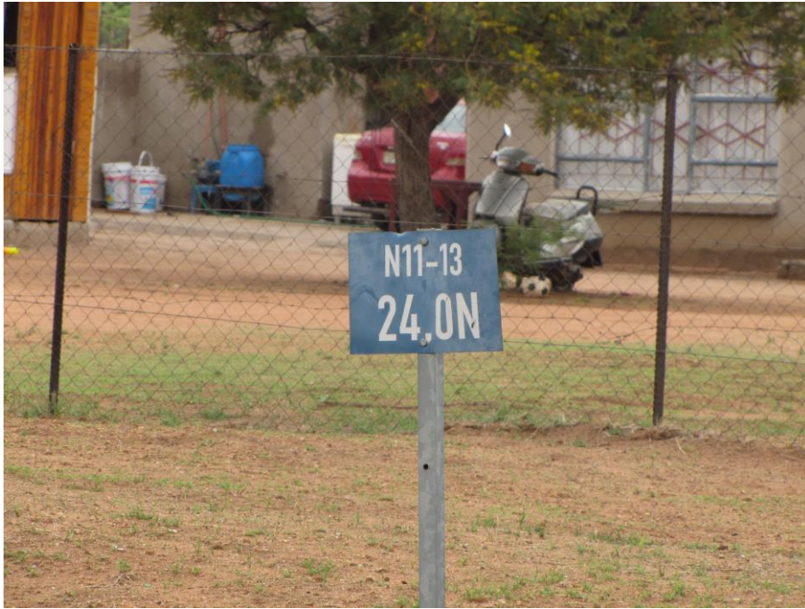
Picture 13: The last Km sign board before the Groot Sandsloot River Bridge was on the opposite side of the N11 where the site notice was placed.