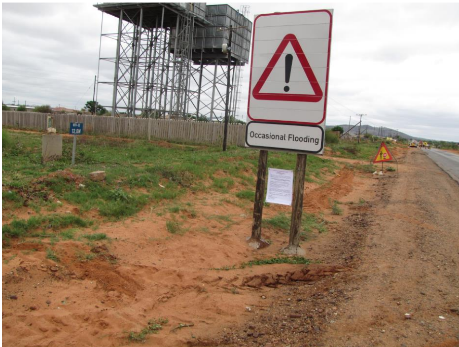
Picture 6: The second site notice was erected at Km 12.0 which is also the centre of the project.

(GPS- S 24° 05' 49.65" E 28° 58' 05.59")