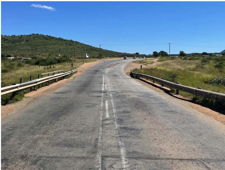
Picture 8: The Dithokeng River Bridge at Km 15.61 will be replaced by a new structure.