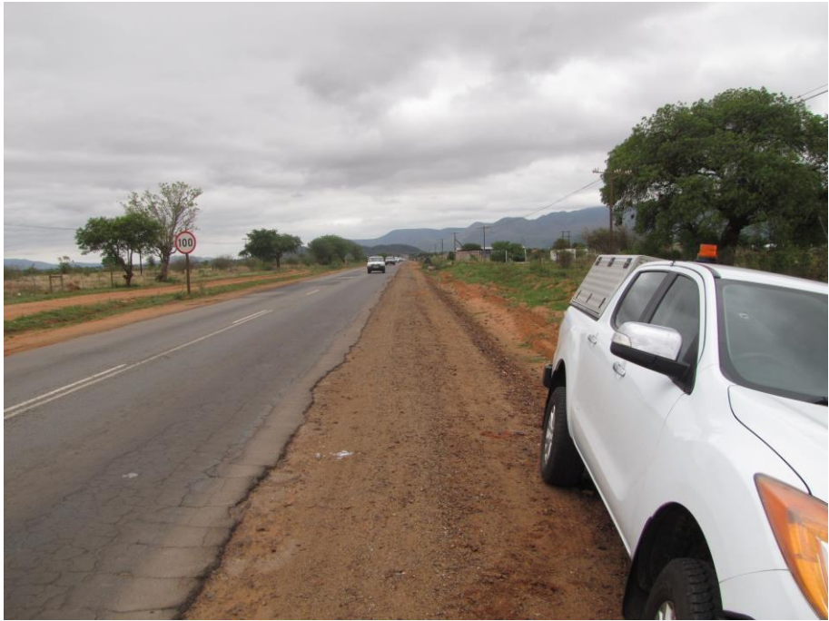
Picture 19: Another image of Marula trees in close proximity to the existing road surface.