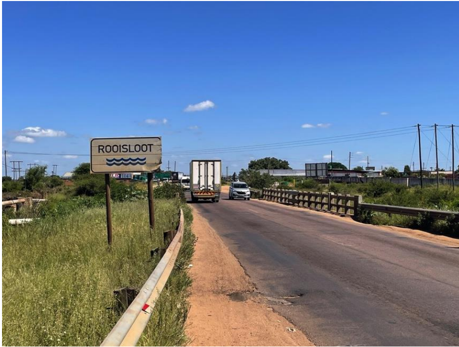
Picture 5: The Rooisloot River Bridge at Km7.75 will be replaced by a new structure.