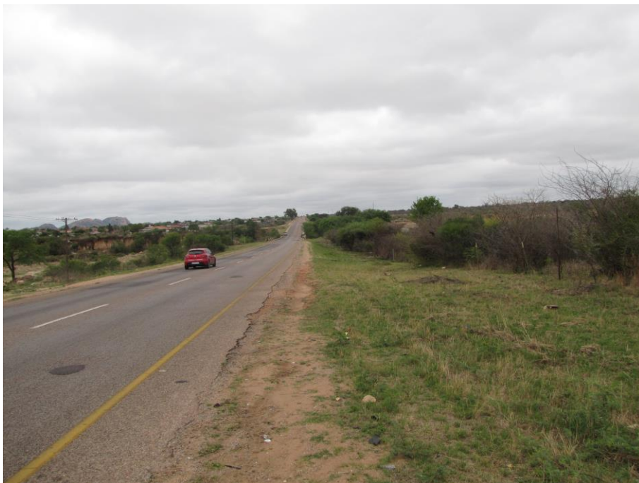
Picture 10: The project ends just before the Groot Sandsloot Bridge visible in the distance. The bridge will not be affected by the project.