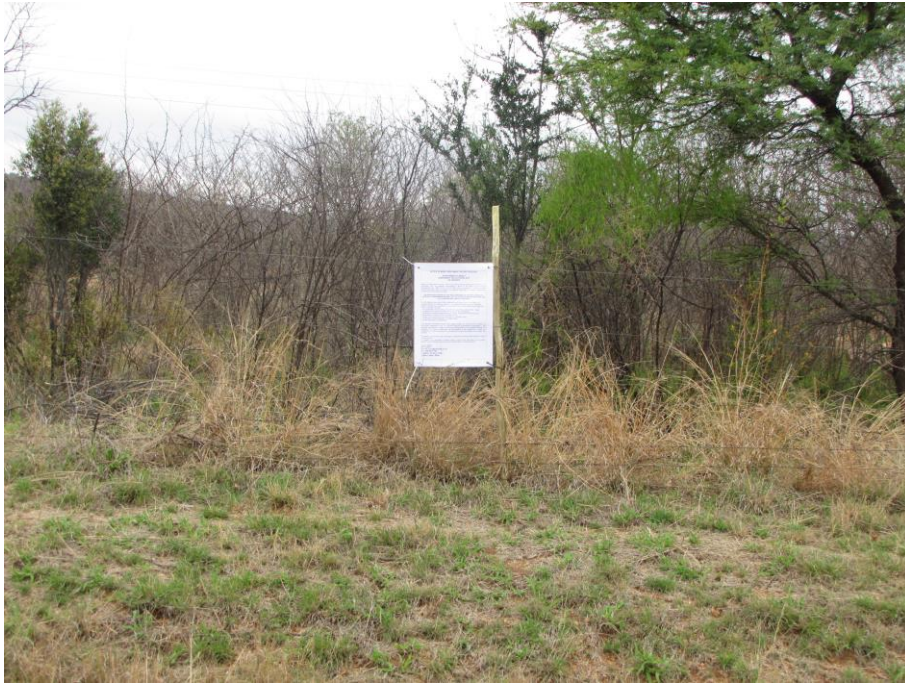
Picture 11: The third site notice was placed near the end of the project (Km 24.0) (GPS- S 23° 59' 39.86" E 28° 57' 37.25")