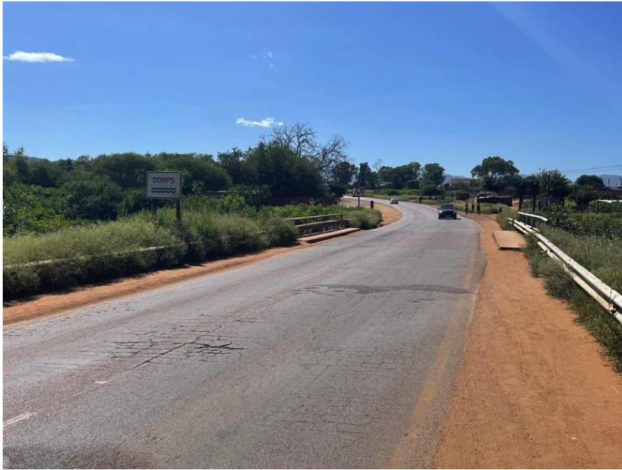
Picture 3: Dorps River Bridge at km 2.92. The bridge will be replaced by a new structure.