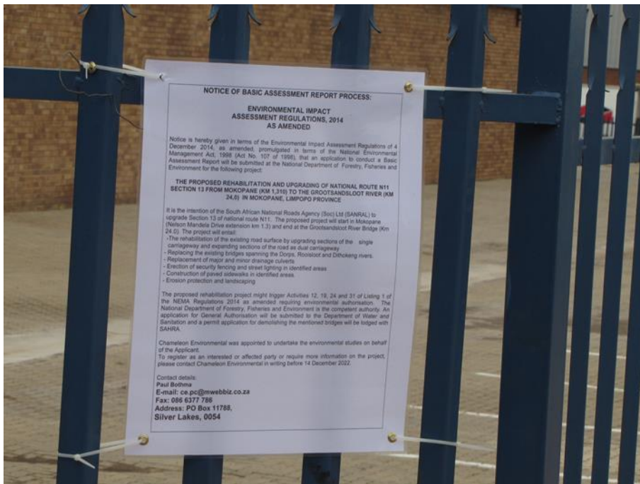
Picture 1: Site notice at the start of the project on the corner of Nelson Mandela Dr – N11 Section 13 and Dudu Madisha Dr. (GPS- S 24°10' 37.82" E 29° 00' 06.66")