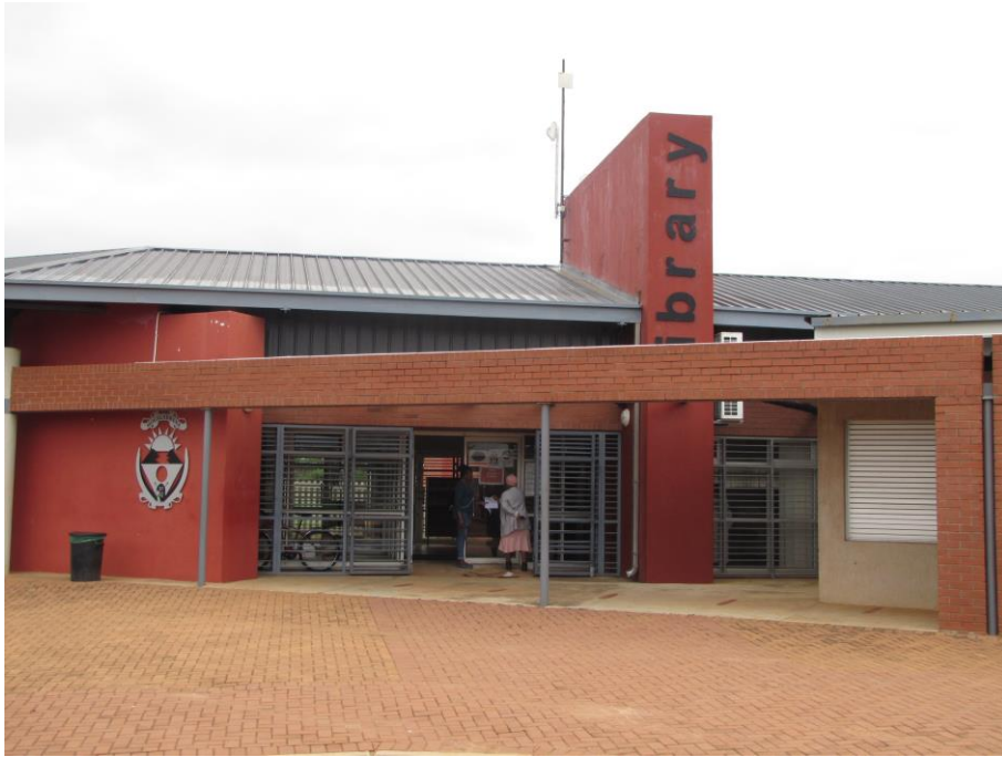
Picture 17: A site notice was also erected at the Mahwereleng public library. The site notice is visible to the right of the person wearing the pink dress.