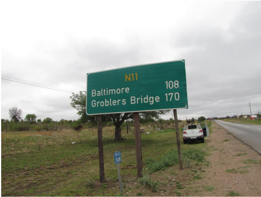
Picture 9: Road signage at Km 18.0. A Marula tree (protected species) is close to the roadside and might be impacted on by the project.