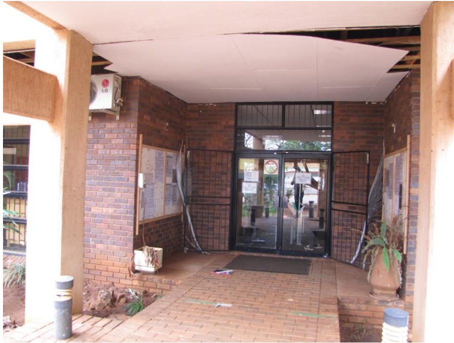
Picture 15: The notice boards are visible on both sides at the entrance to the library.