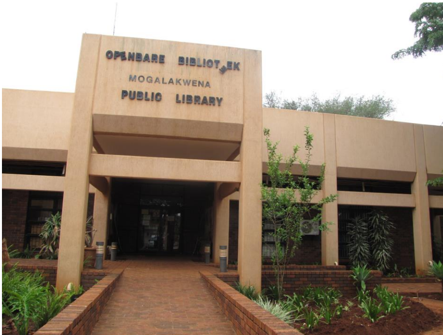
Picture 14: A site notice was placed on the notice board just outside the entrance to the Mogalakwena Public Library.