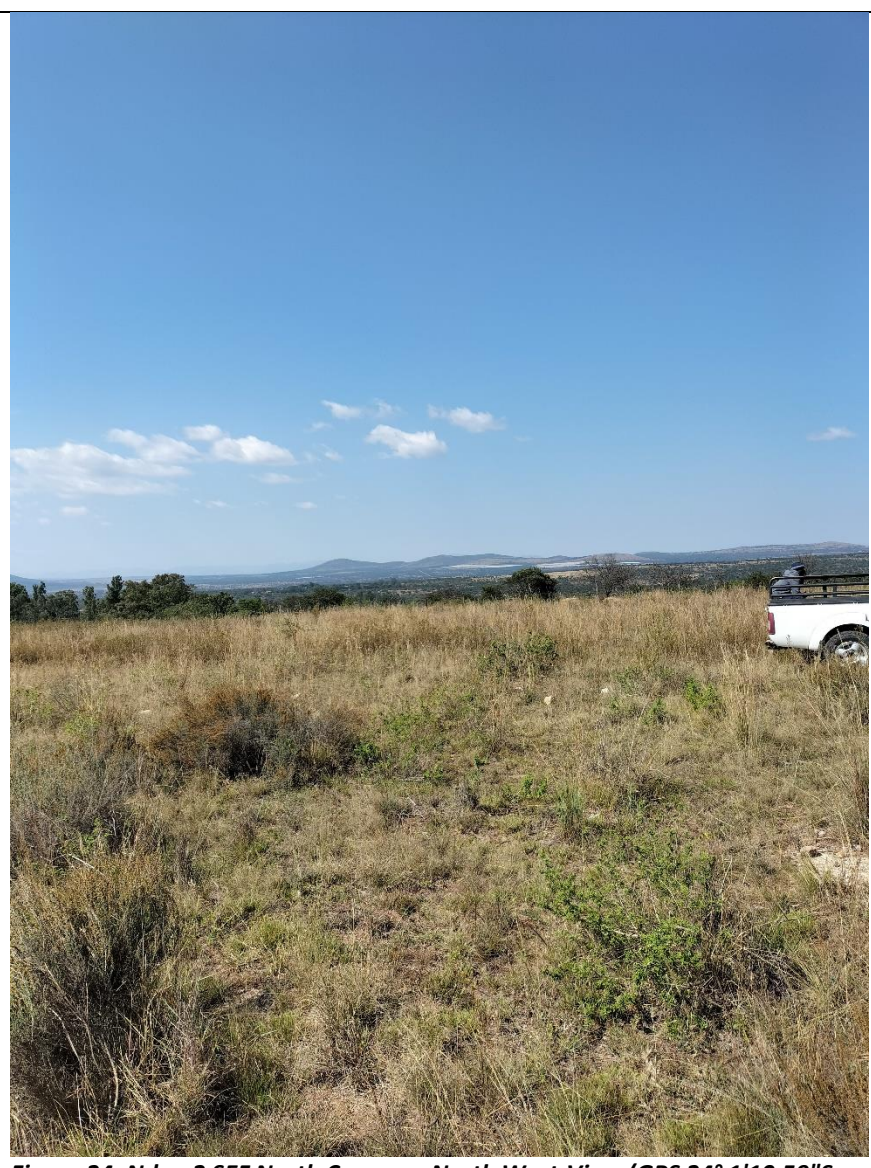
Figure 24: Ndau 2 SEF North Corner – North West-View (GPS 24° 1'10.59"S 29°12'55.31"E)