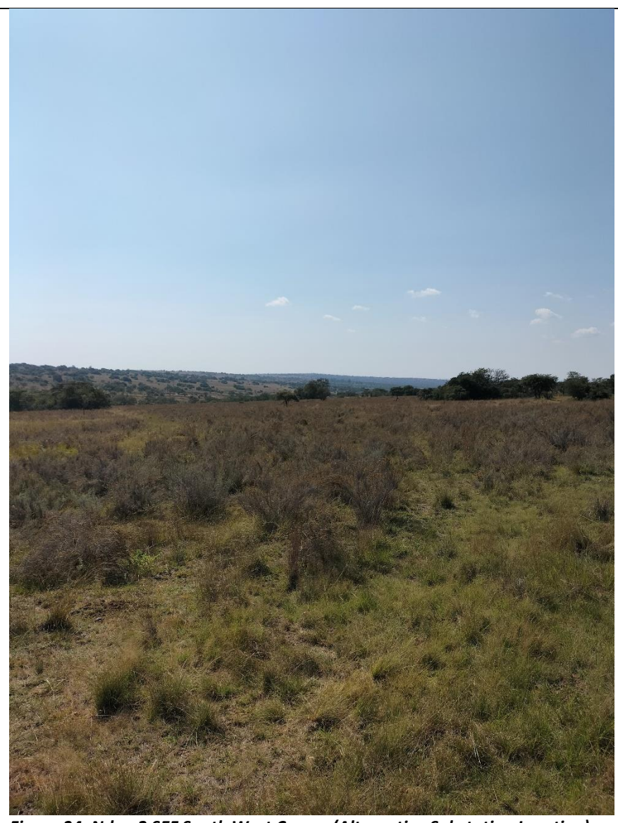
Figure 34: Ndau 2 SEF South West Corner (Alternative Substation Location) – North East View (GPS 24° 1'47.36"S 29°12'42.98"E)