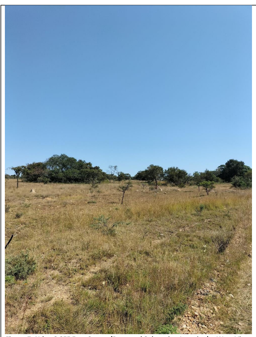
Figure 7: Ndau 2 SEF East Corner (Proposed Substation Location) – West View (GPS 24°1'19.74"S 29°13'21.29"E)