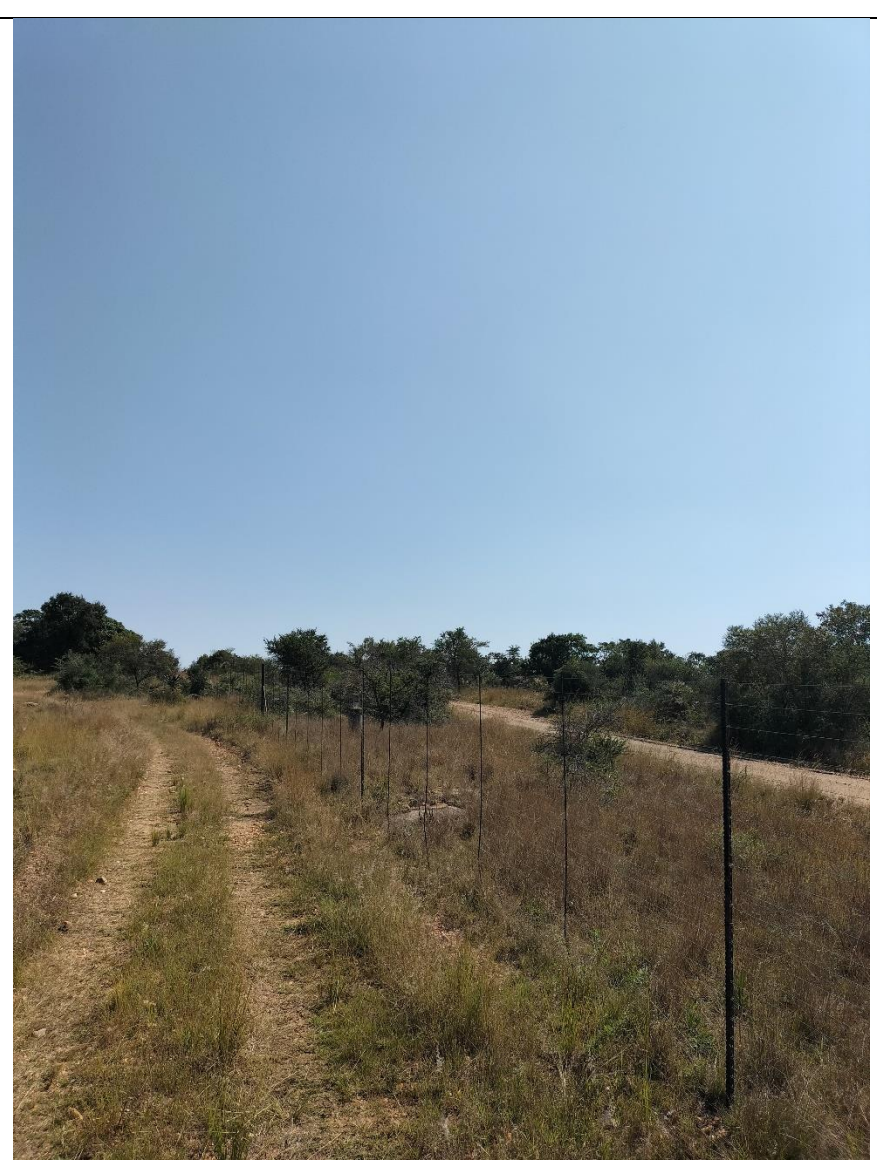
Figure 8: Ndau 2 SEF East Corner (Proposed Substation Location) - North West View (GPS 24°1'19.74"S 29°13'21.29"E)