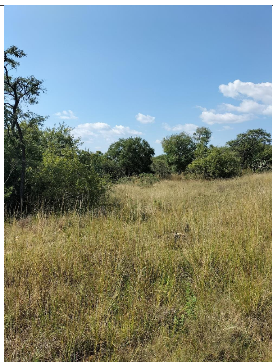
Figure 28: Ndau 2 SEF West Side – South East View (GPS 24° 1'26.63"S 29°12'41.03"E)