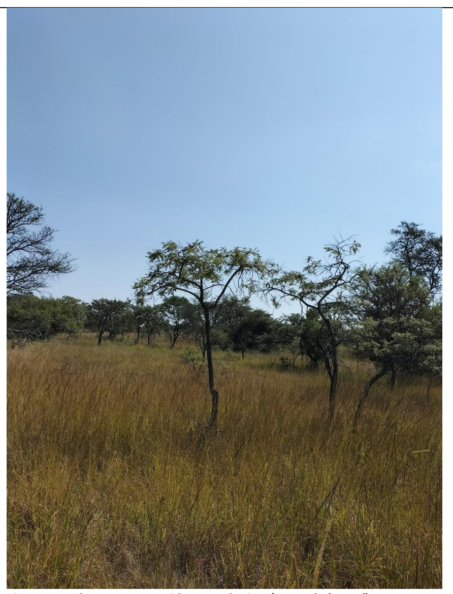
Figure 25: Ndau 2 SEF West Side - North View (GPS 24° 1'26.63"S 29°12'41.03"E)