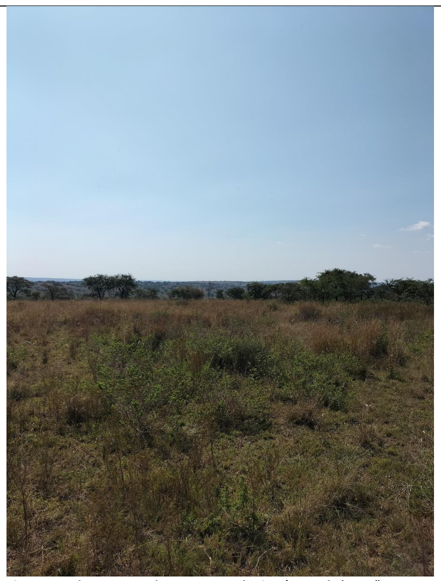
Figure 21: Ndau 2 SEF North Corner — South-View (GPS 24° 1'10.59"S 29°12'55.31"E)