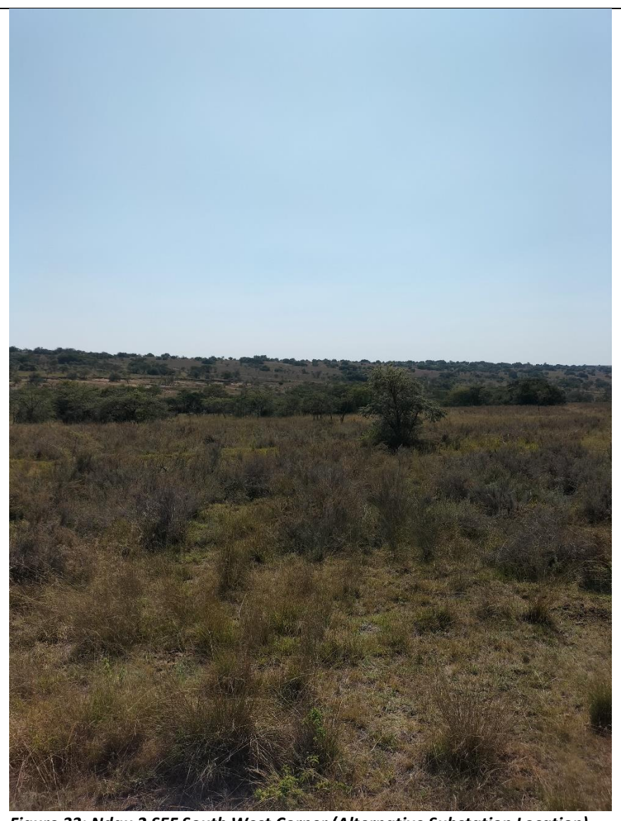
Figure 33: Ndau 2 SEF South West Corner (Alternative Substation Location) – North View (GPS 24° 1'47.36"S 29°12'42.98"E)