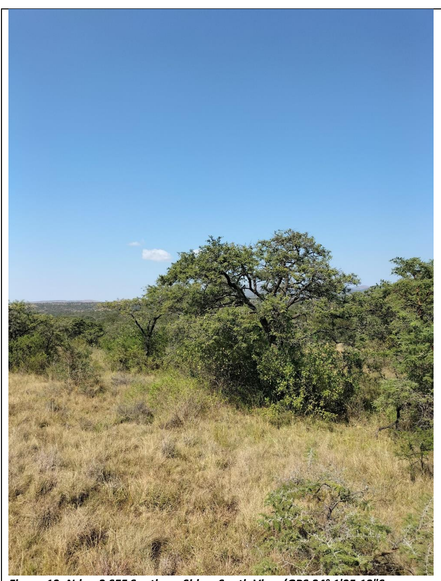
Figure 13: Ndau 2 SEF Southern Side – South View (GPS 24° 1'35.12"S 29°13'5.48"E)