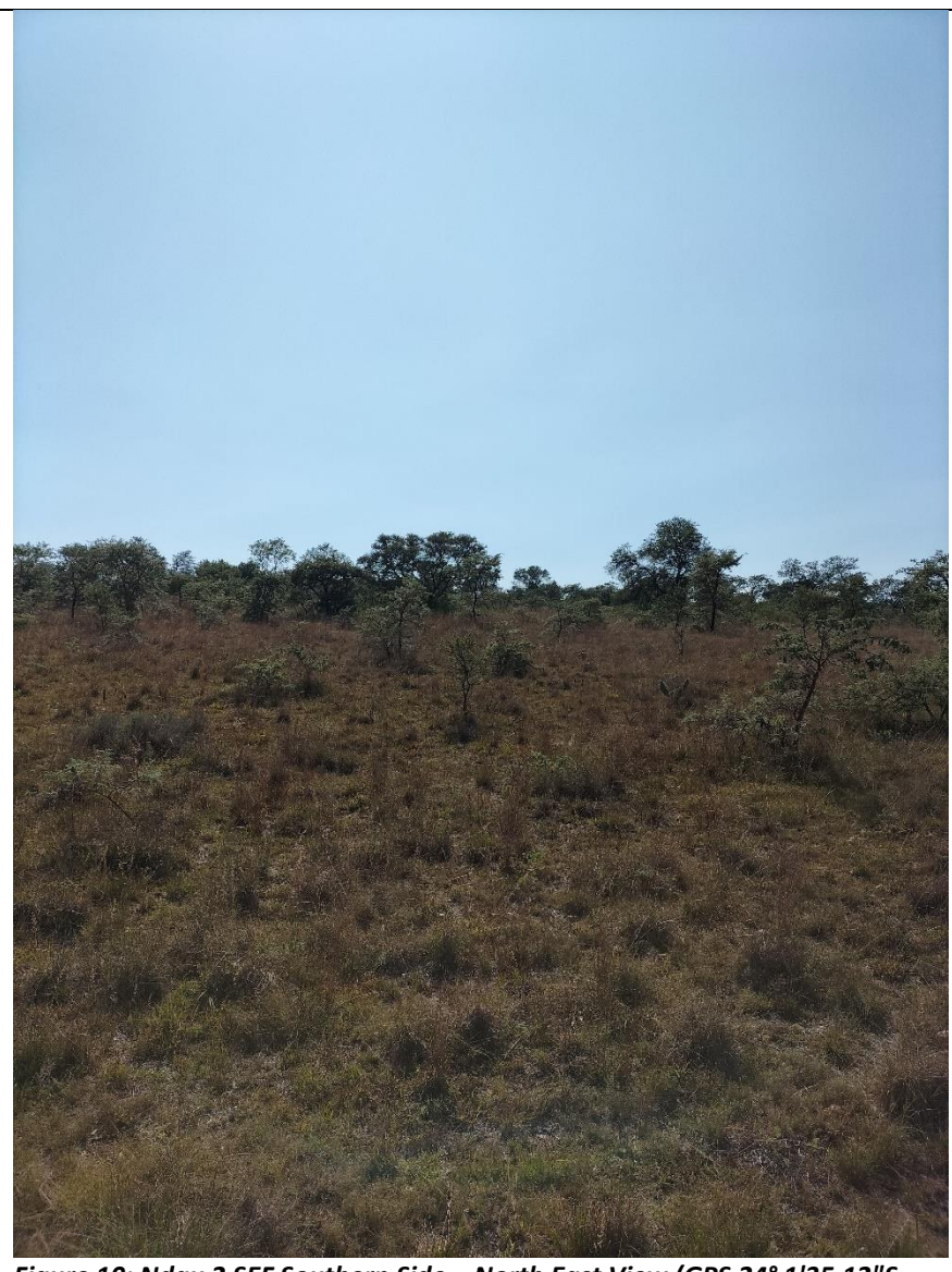
Figure 10: Ndau 2 SEF Southern Side – North East View (GPS 24° 1'35.12"S 29°13'5.48"E)