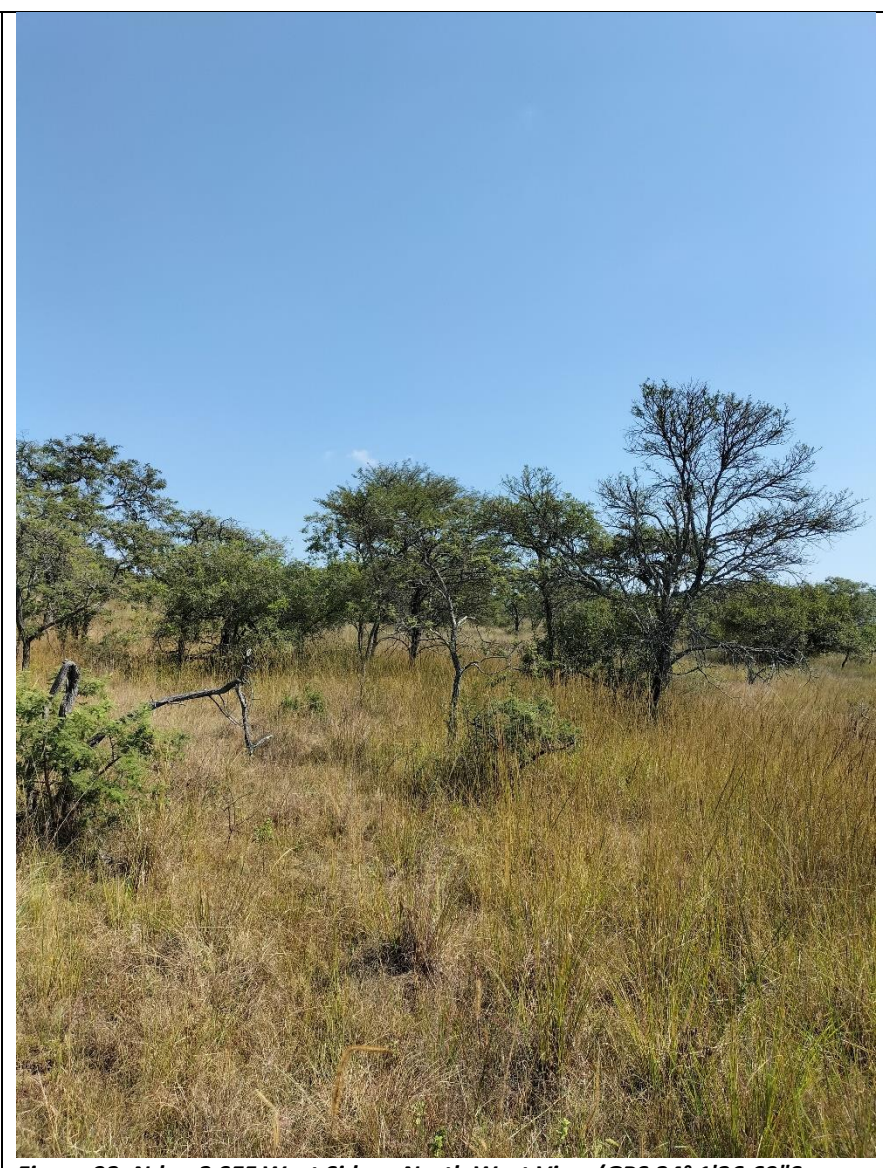
Figure 32: Ndau 2 SEF West Side - North West View (GPS 24° 1'26.63"S 29°12'41.03"E)