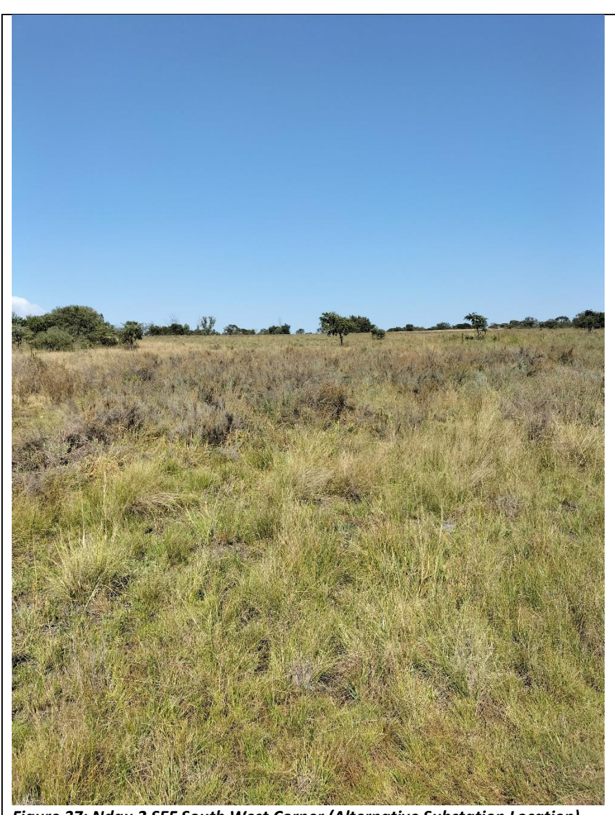
Figure 37: Ndau 2 SEF South West Corner (Alternative Substation Location) – South View (GPS 24° 1'47.36"S 29°12'42.98"E)