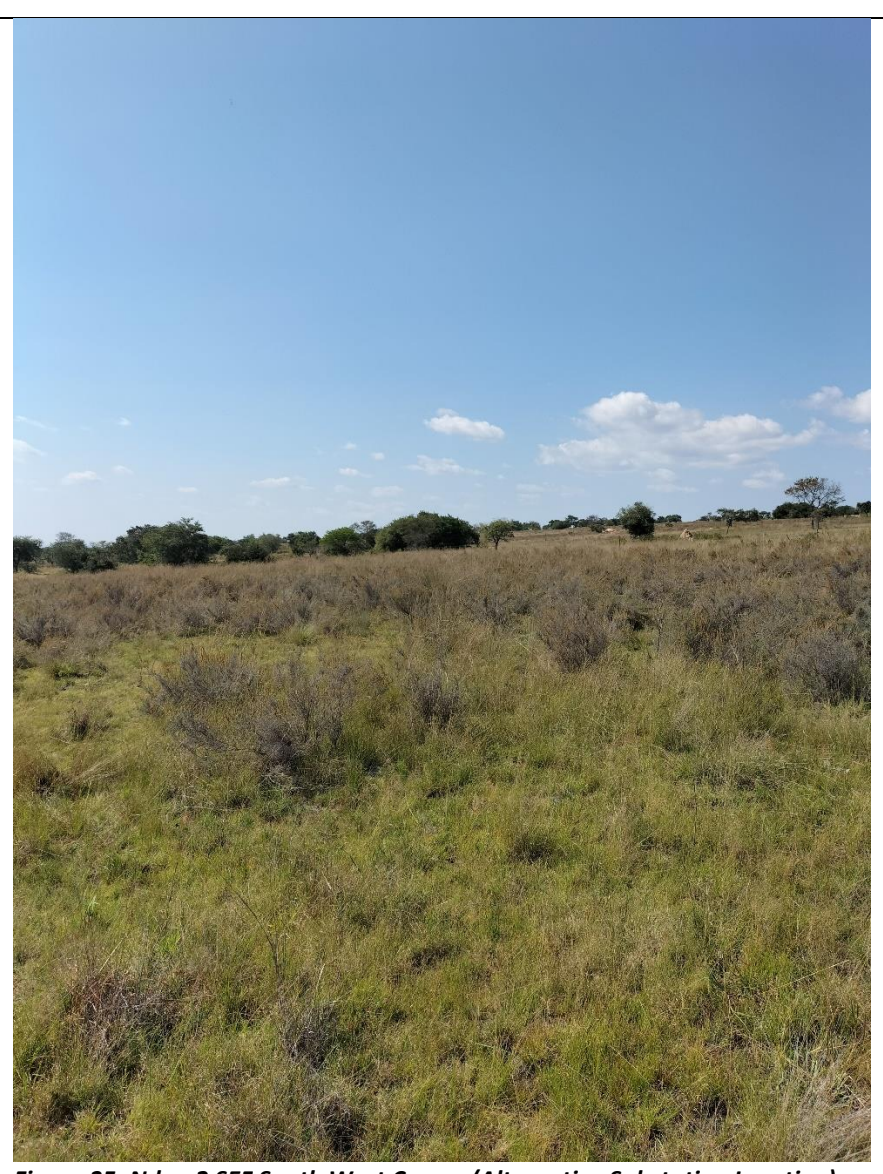
Figure 35: Ndau 2 SEF South West Corner (Alternative Substation Location) – East View (GPS 24° 1'47.36"S 29°12'42.98"E)