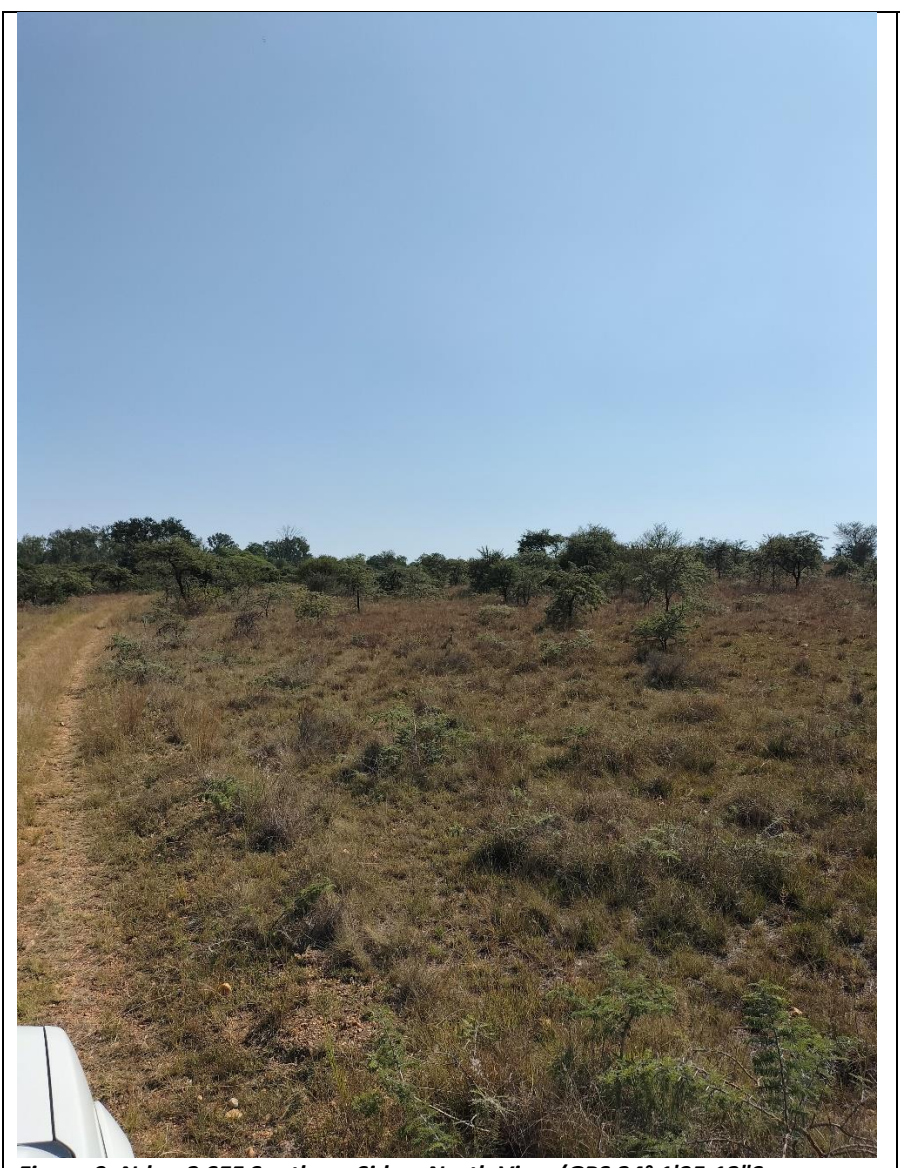
Figure 9: Ndau 2 SEF Southern Side – North View (GPS 24° 1'35.12"S 29°13'5.48"E)