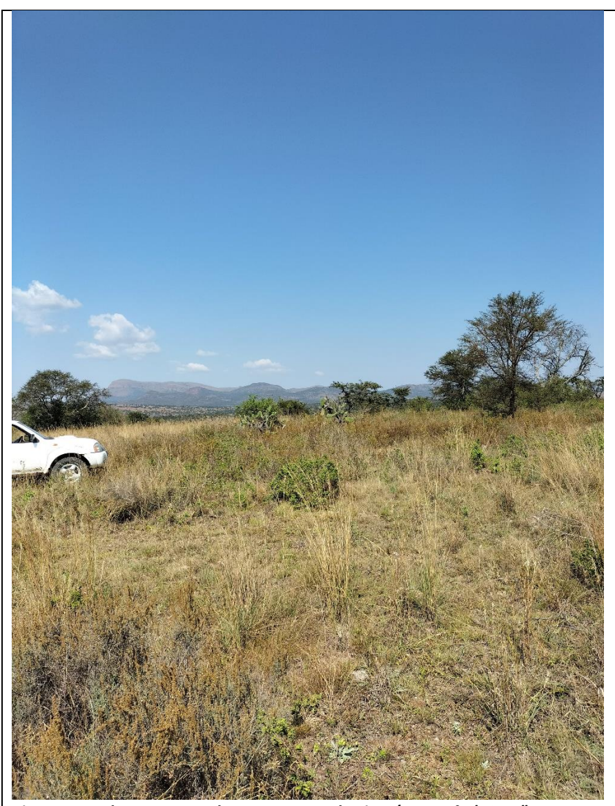
Figure 17: Ndau 2 SEF North Corner — North-View (GPS 24° 1'10.59"S 29°12'55.31"E)