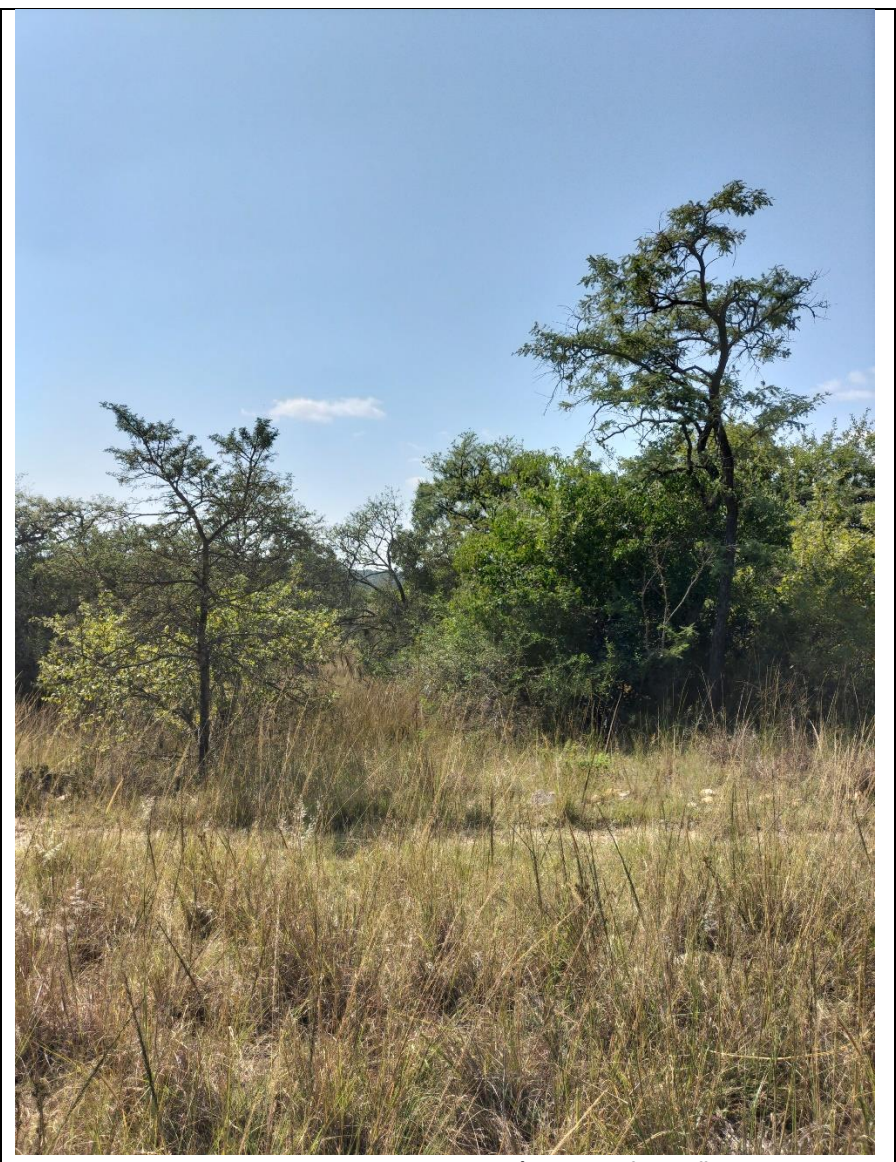
Figure 27: Ndau 2 SEF West Side – East View (GPS 24° 1'26.63"S 29°12'41.03"E)