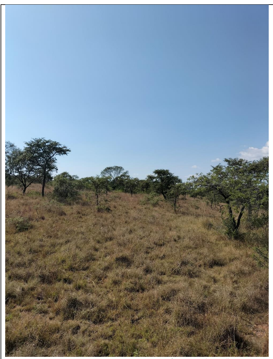
Figure 11: Ndau 2 SEF Southern Side – East View (GPS 24° 1'35.12"S 29°13'5.48"E)