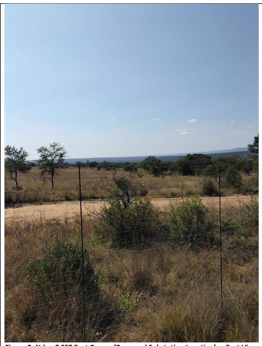
Figure 3: Ndau 2 SEF East Corner (Proposed Substation Location) — East View (GPS 24°1'19.74"S 29°13'21.29"E)