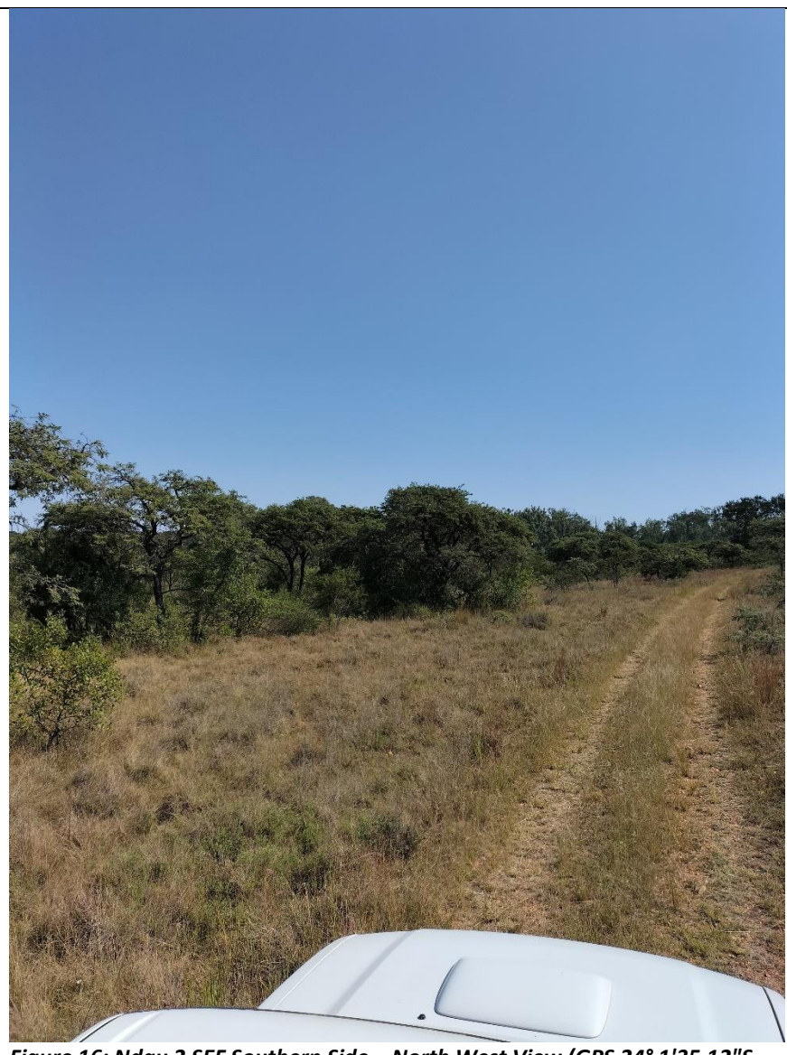
Figure 16: Ndau 2 SEF Southern Side – North West View (GPS 24° 1'35.12"S 29°13'5.48"E)