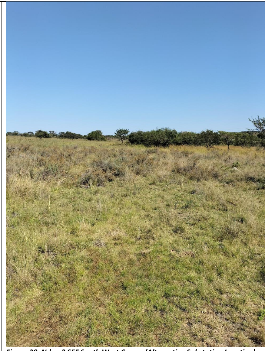
Figure 38: Ndau 2 SEF South West Corner (Alternative Substation Location) – South West View (GPS 24° 1'47.36"S 29°12'42.98"E)