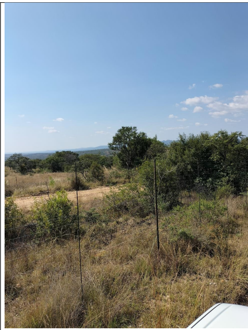
Figure 4: Ndau 2 SEF East Corner (Proposed Substation Location) — South East View (GPS 24°1'19.74"S 29°13'21.29"E)