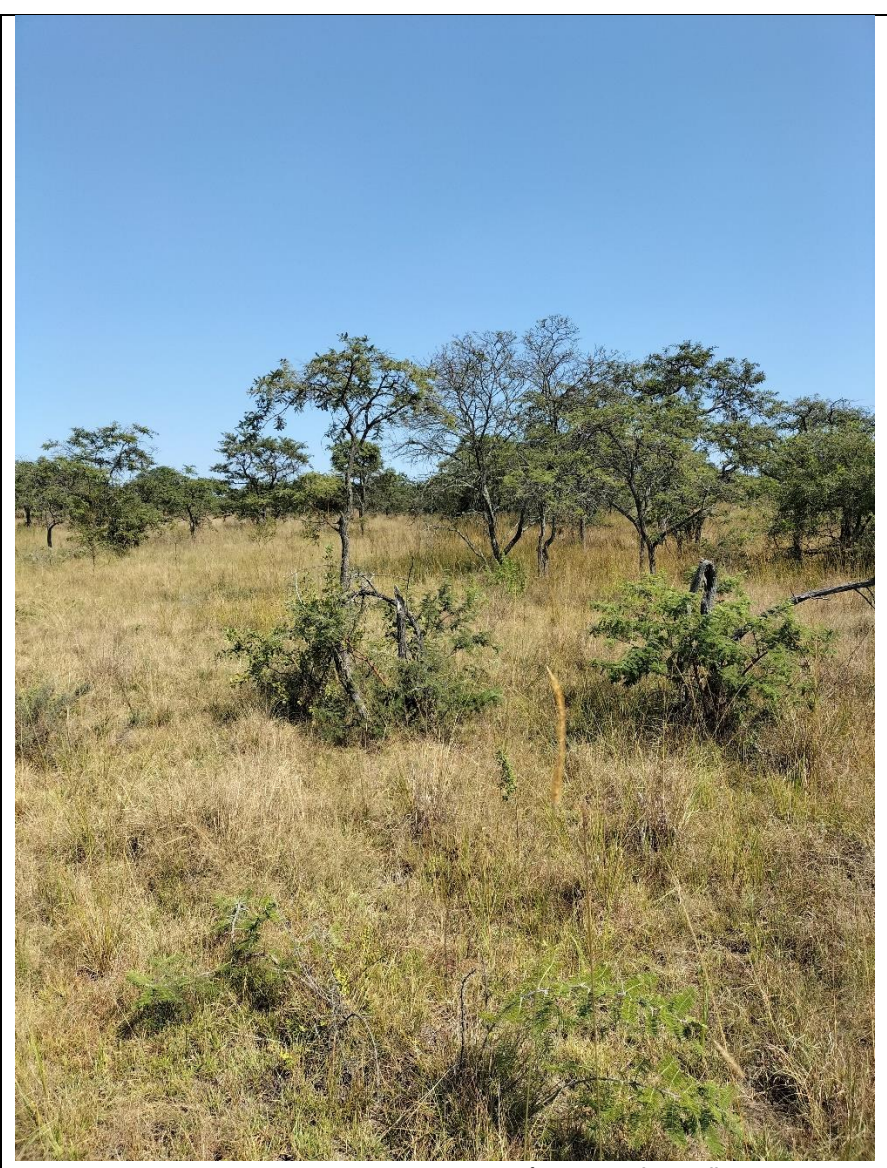
Figure 31: Ndau 2 SEF West Side – West View (GPS 24° 1'26.63"S 29°12'41.03"E)