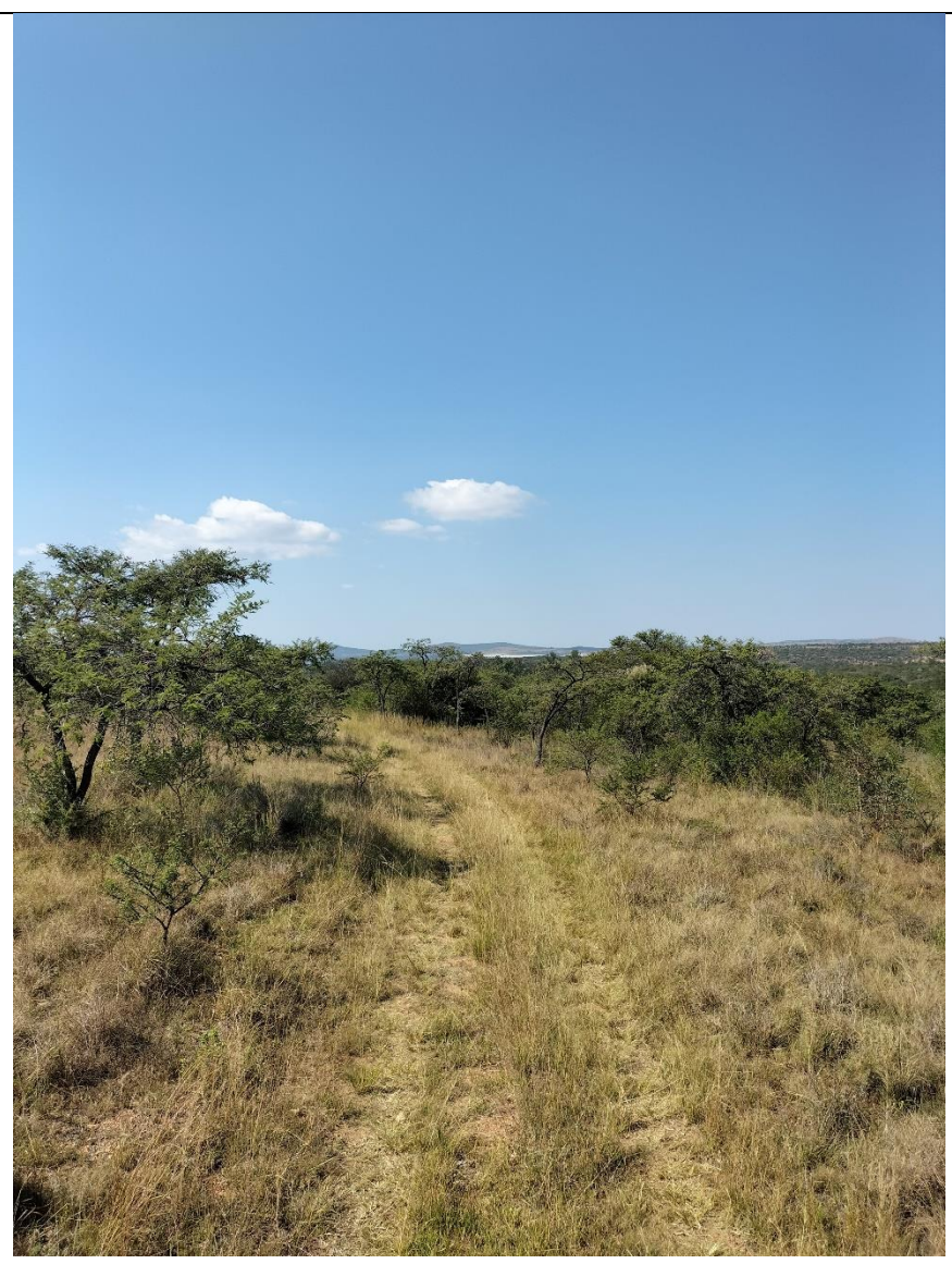
Figure 12: Ndau 2 SEF Southern Side – South East View (GPS 24° 1'35.12"S 29°13'5.48"E)