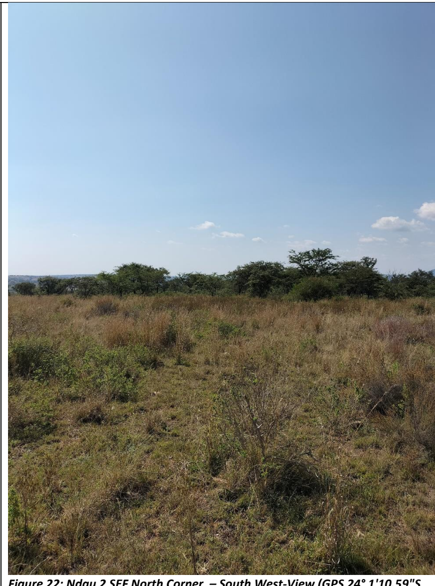
Figure 22: Ndau 2 SEF North Corner - South West-View (GPS 24° 1'10.59"S 29°12'55.31"E)