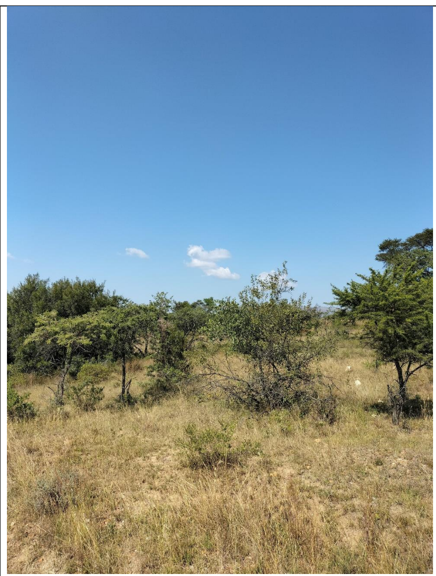
Figure 6: Ndau 2 SEF East Corner (Proposed Substation Location) - South West View (GPS 24°1'19.74"S 29°13'21.29"E)