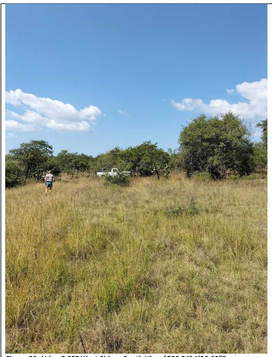
Figure 29: Ndau 2 SEF West Side - South View (GPS 24° 1'26.63"S 29°12'41.03"E)