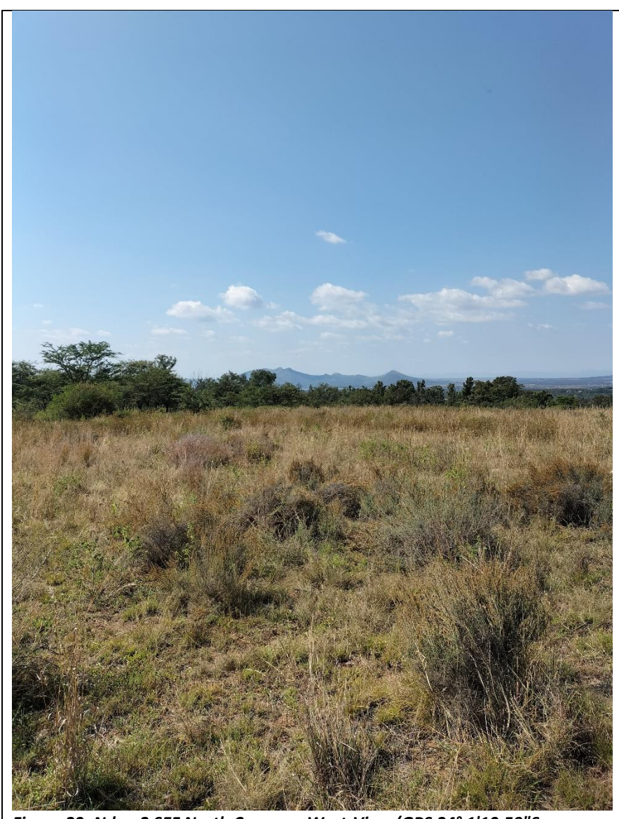
Figure 23: Ndau 2 SEF North Corner — West-View (GPS 24° 1'10.59"S 29°12'55.31"E)