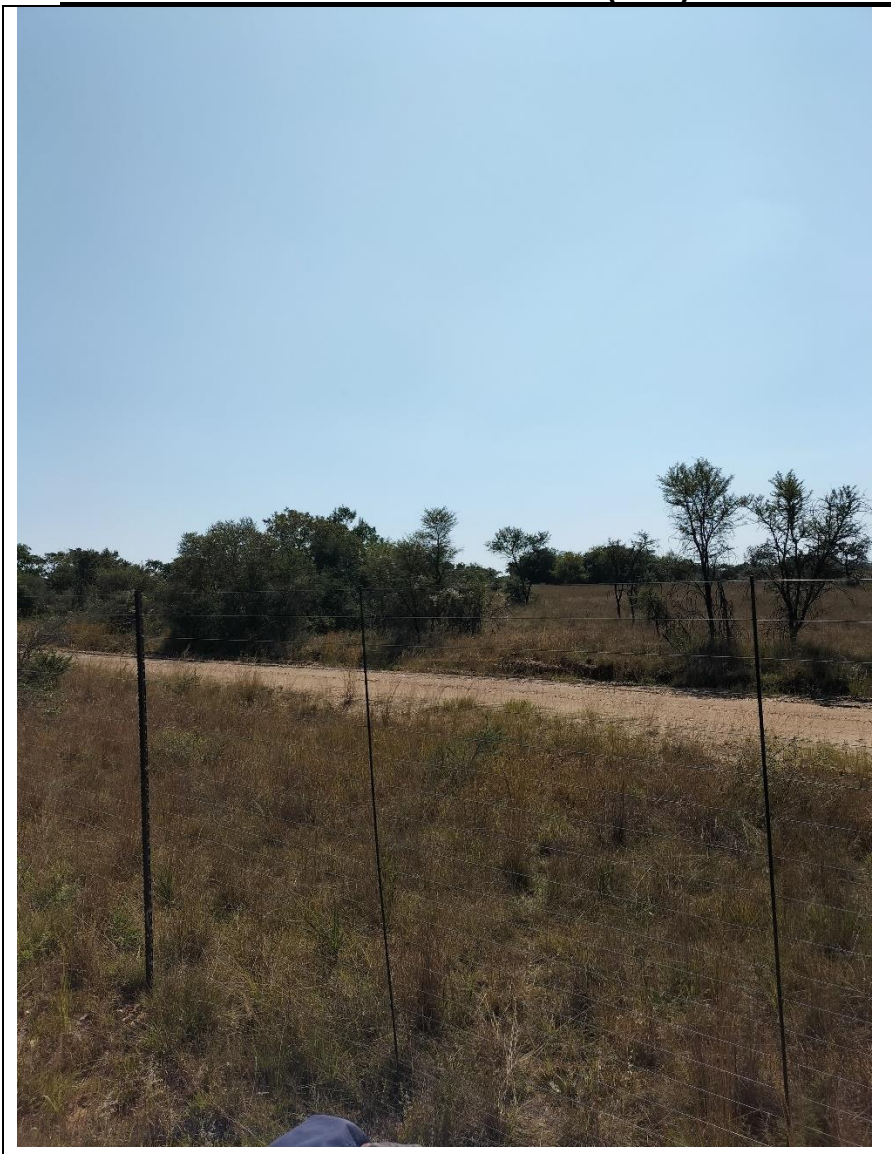
Figure 1: Ndau 2 SEF East Corner (Proposed Substation Location) – North View (GPS 24°1'19.74"S 29°13'21.29"E)