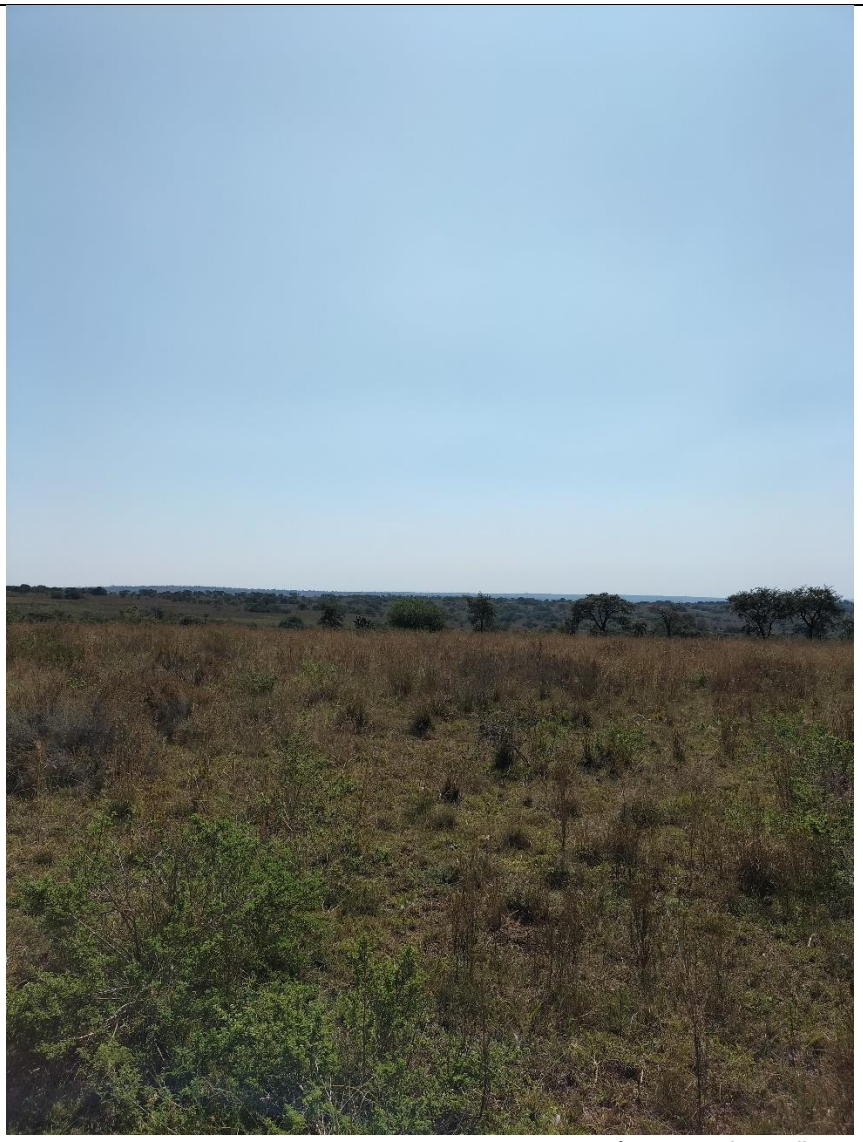
Figure 20: Ndau 2 SEF North Corner — South East-View (GPS 24° 1'10.59"S 29°12'55.31"E)