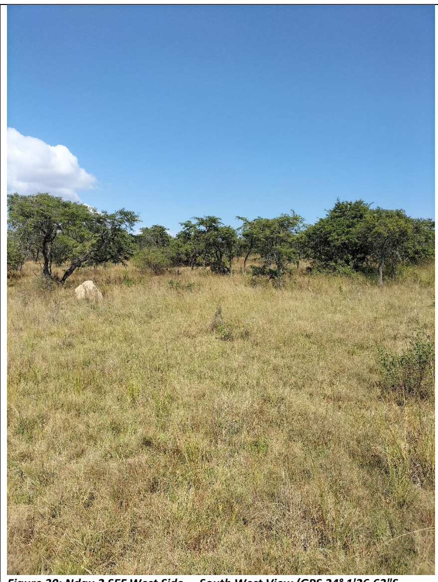
Figure 30: Ndau 2 SEF West Side - South West View (GPS 24° 1'26.63"S 29°12'41.03"E)