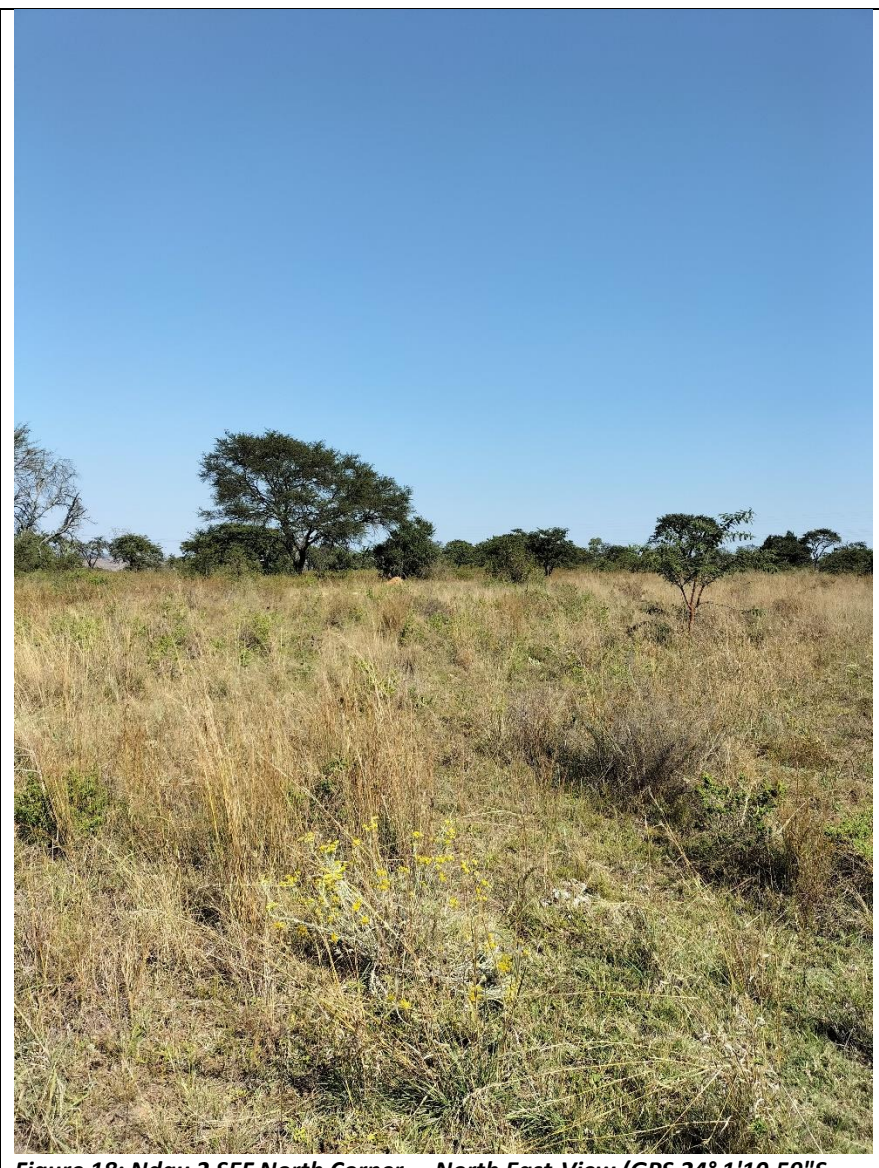
Figure 18: Ndau 2 SEF North Corner — North East-View (GPS 24° 1'10.59"S 29°12'55.31"E)