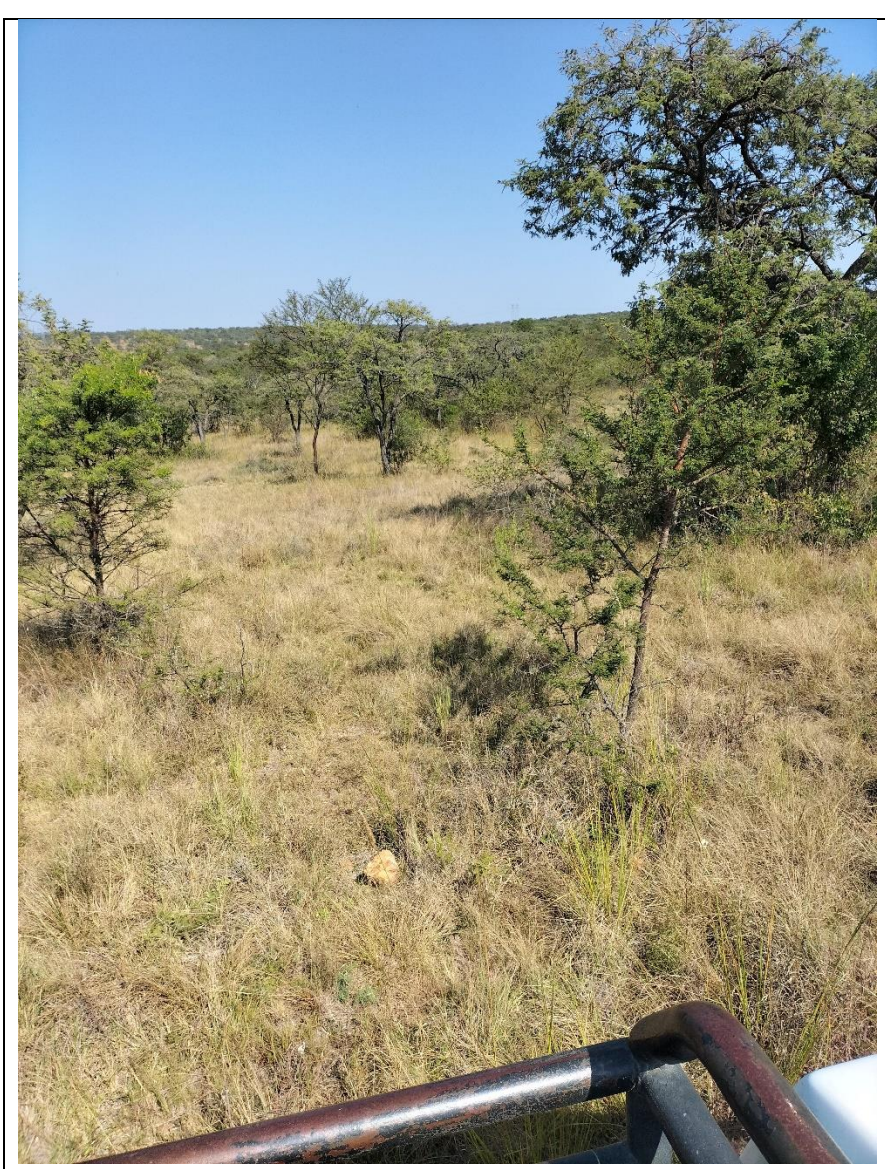
Figure 15: Ndau 2 SEF Southern Side – West View (GPS 24° 1'35.12"S 29°13'5.48"E)