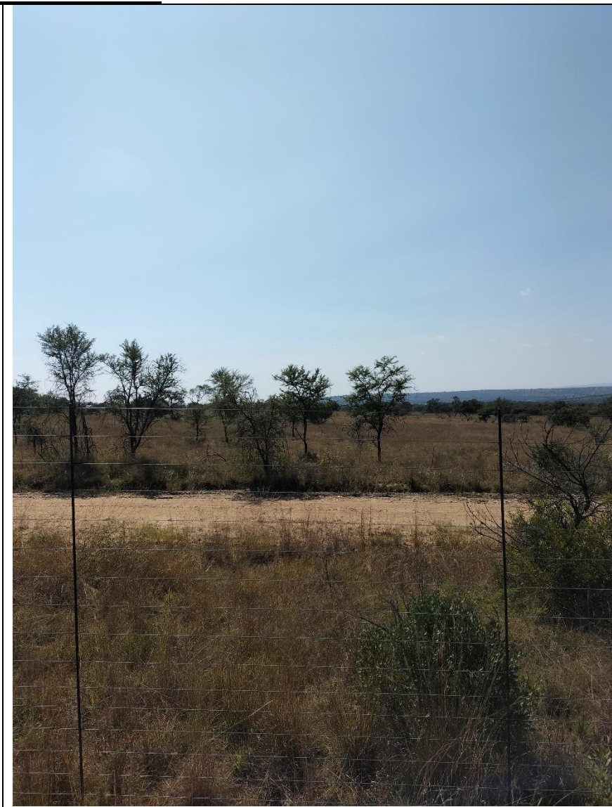
Figure 2: Ndau 2 SEF East Corner (Proposed Substation Location) – North East View (GPS 24°1'19.74"S 29°13'21.29"E)