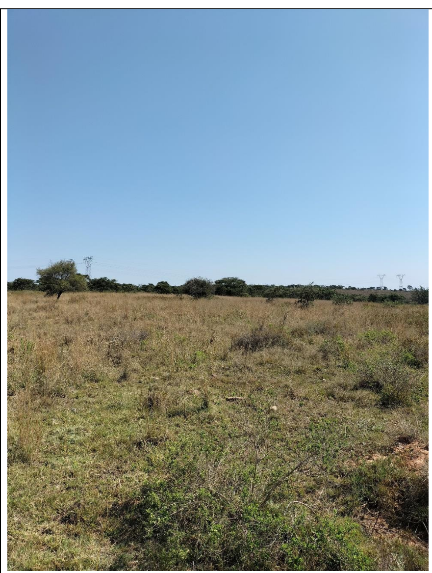
Figure 40: Ndau 2 SEF South West Corner (Alternative Substation Location) – North West View (GPS 24° 1'47.36"S 29°12'42.98"E)