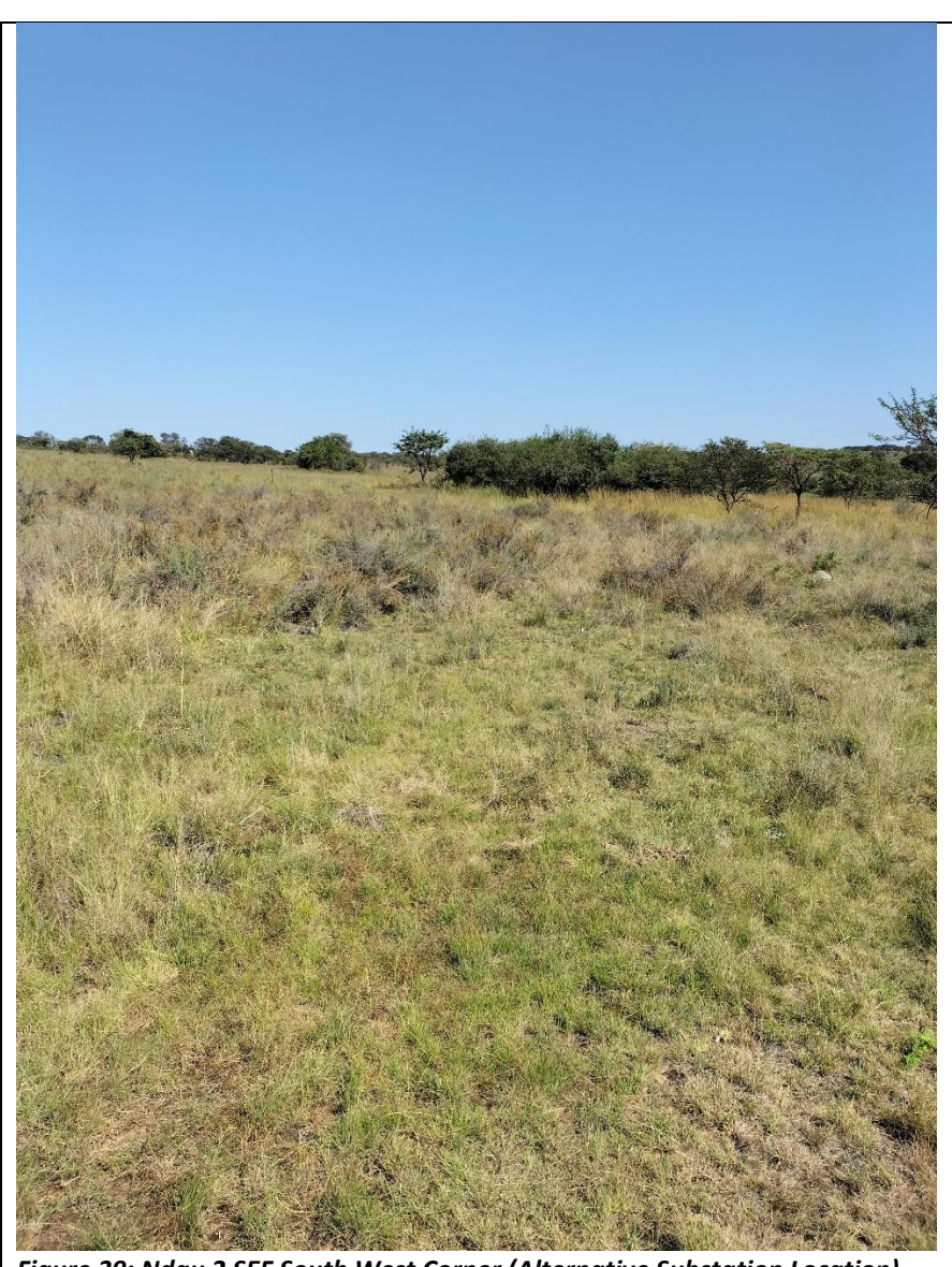
Figure 39: Ndau 2 SEF South West Corner (Alternative Substation Location) – West View (GPS 24° 1'47.36"S 29°12'42.98"E)