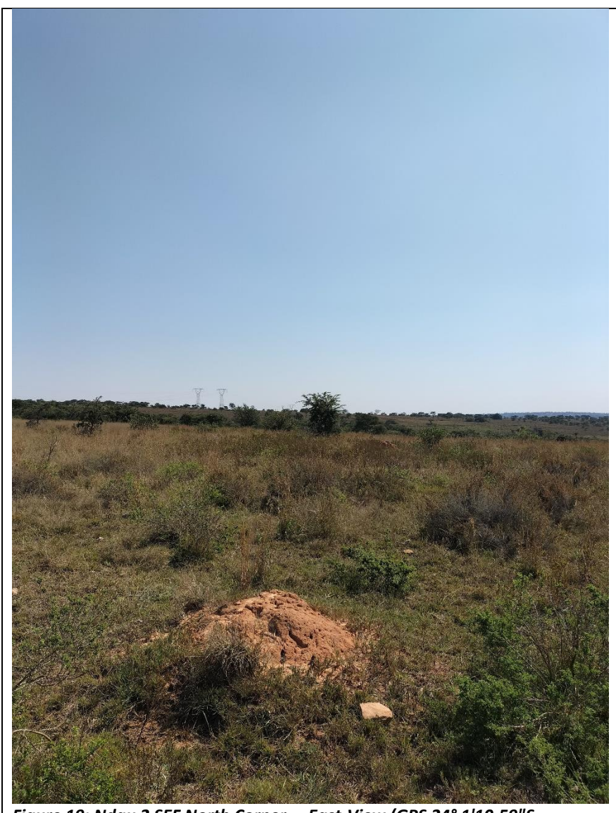
Figure 19: Ndau 2 SEF North Corner – East-View (GPS 24° 1'10.59"S 29°12'55.31"E)