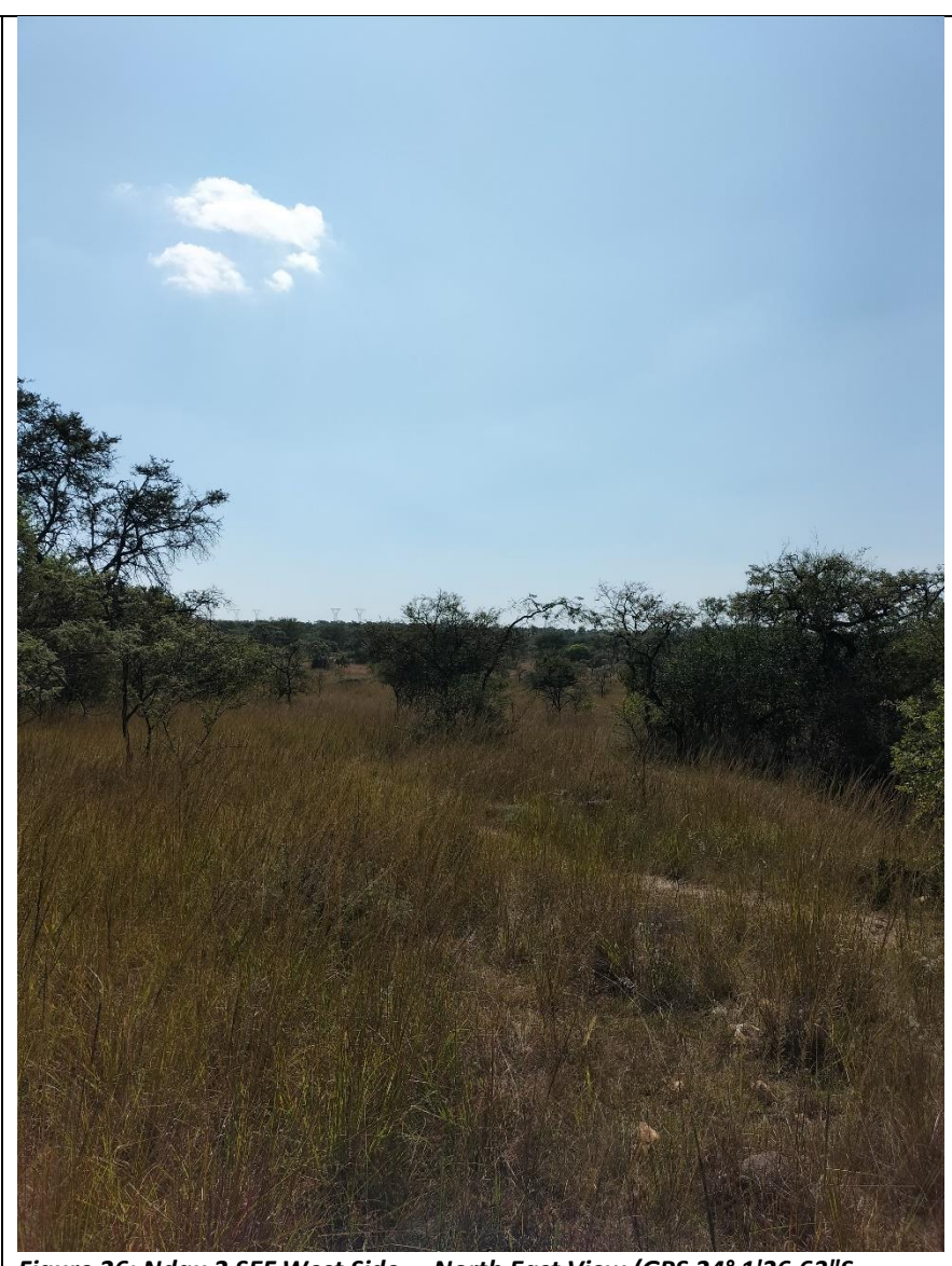
Figure 26: Ndau 2 SEF West Side – North East View (GPS 24° 1'26.63"S 29°12'41.03"E)