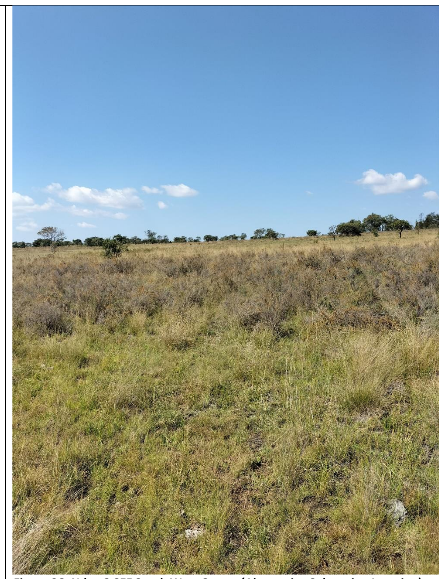
Figure 36: Ndau 2 SEF South West Corner (Alternative Substation Location) – South East View (GPS 24° 1'47.36"S 29°12'42.98"E)