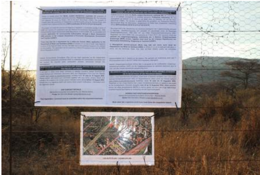
e) Fence line of Portion 129, farm Doornhoek 318-KQ, along Medivet Road, Thabazimbi