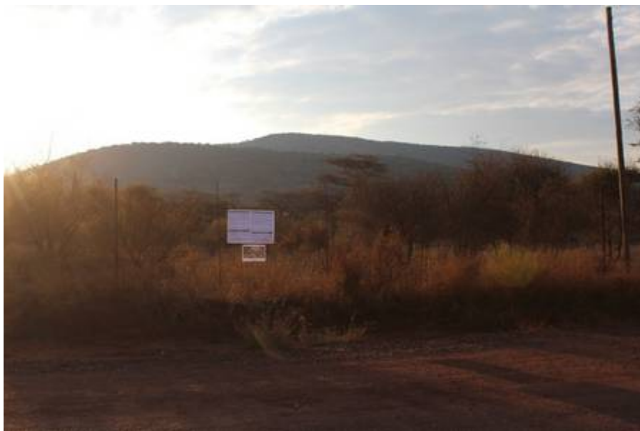
f) Site notice placed next to the Medivet Road across from Medivet Animal Clinic