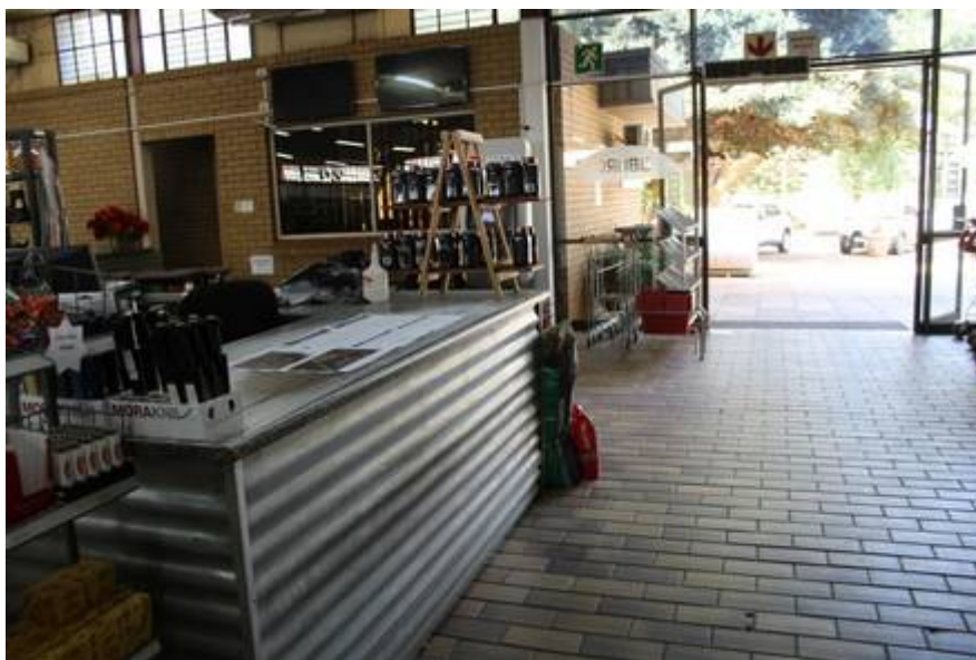
d) Obaro, Thabazimbi-Marakele Road, Thabazimbi