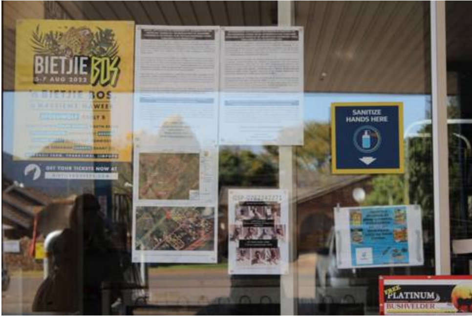
Figure 4: Close up of Site Notice 3