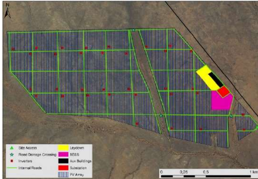
Figure 1: Position of the proposed BESS (in pink).