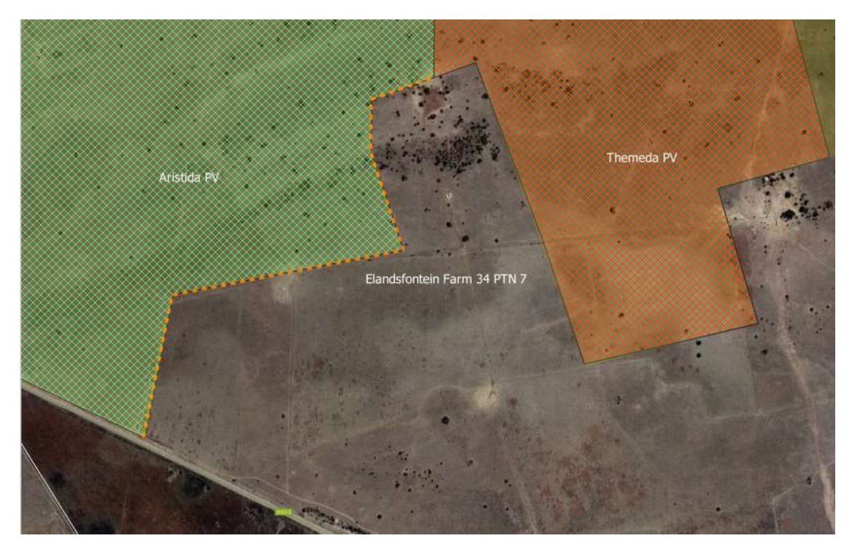
Figure 6: Envisioned Themeda PV Access Route (orange) in relation to Aristida PV Development Area