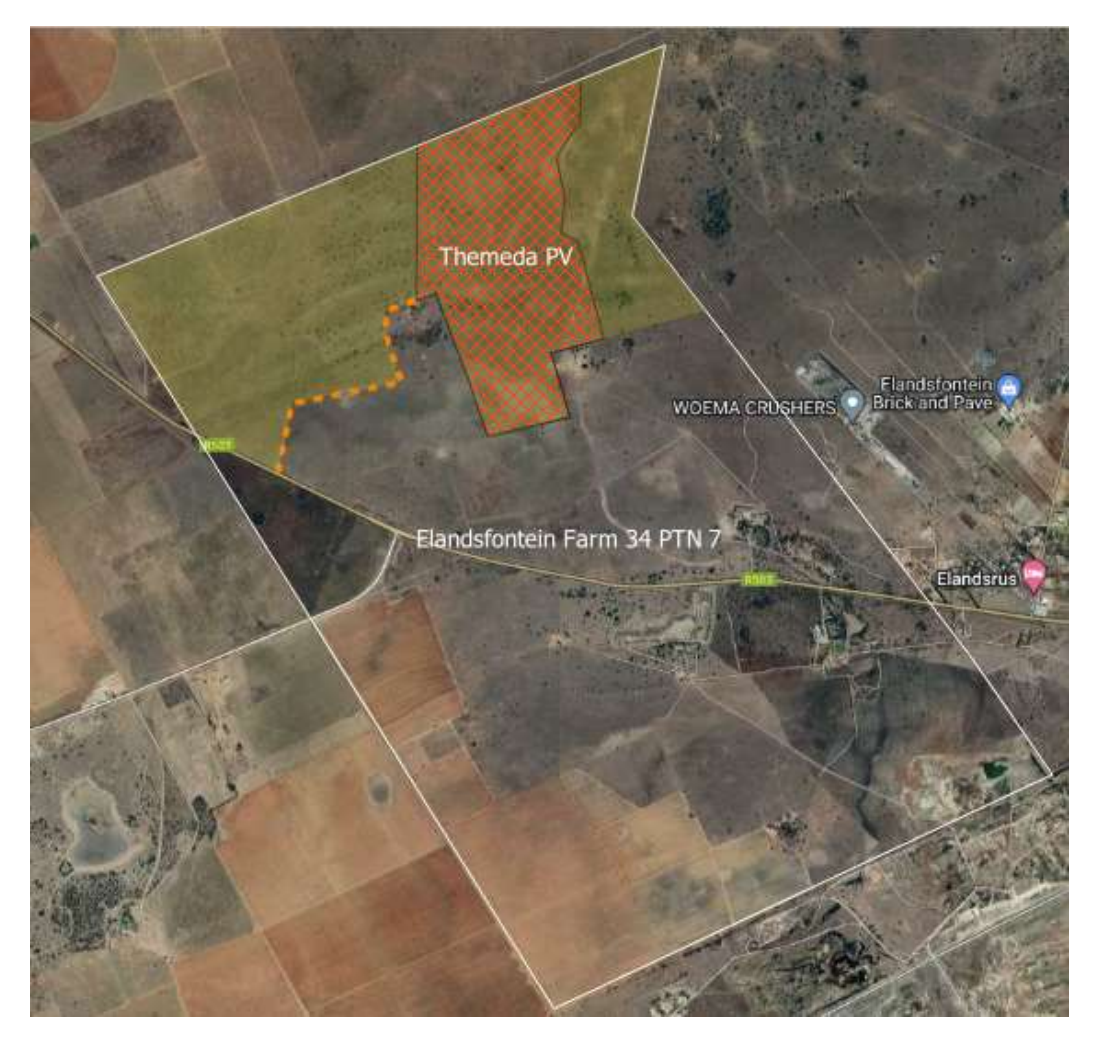
Figure 2: Property boundary (white), Themeda PV Study Area (yellow) & Proposed Development Area (orange)