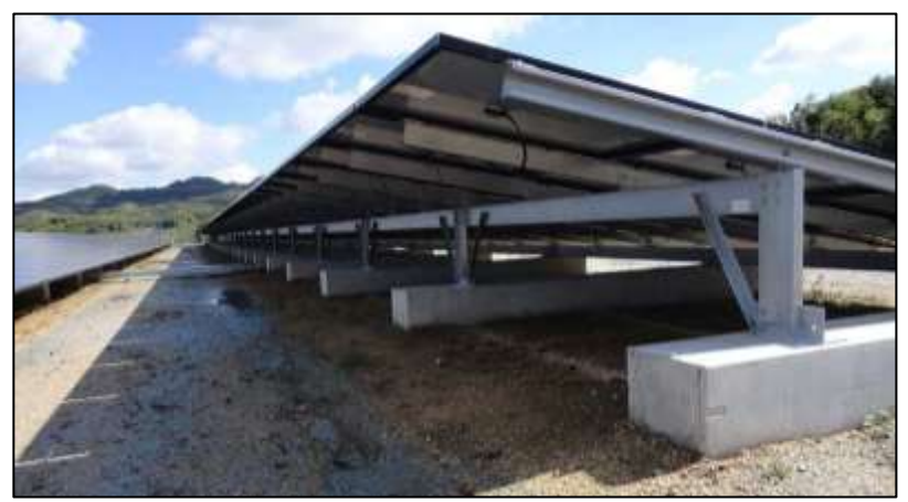
Figure 3: Cast Concrete Foundation

Various options exist for mounting structure foundations, which include cast/ pre-cast concrete (shown in Figure 3), driven/ rammed piles (Figure 4), or ground/ earth screws mounting systems (Figure 8).