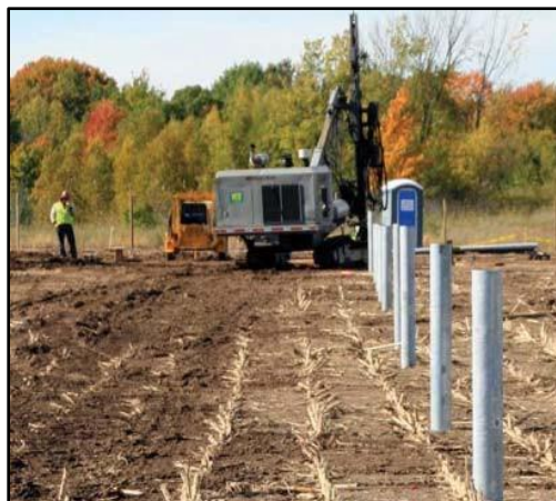
Figure 4: Driven/ Rammed Steel Pile