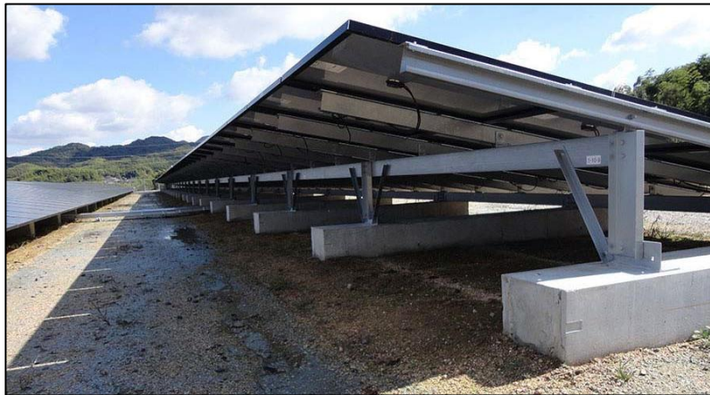
Figure 3: Cast Concrete Foundation

Various options exist for mounting structure foundations, which include cast/ pre-cast concrete (shown in Figure 3), driven/ rammed piles (Figure 4), or ground/ earth screws mounting systems (Figure 8).