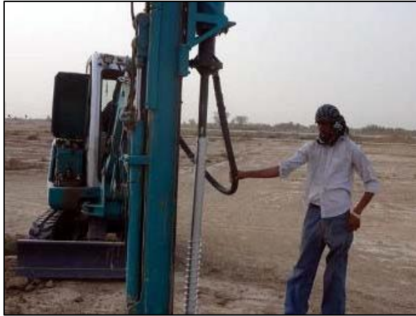
Figure 5: Ground Screw