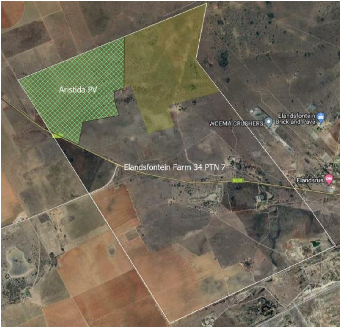
Figure 2: Property boundary (white), Aristida PV Study Area (yellow) & Proposed Development Area (green)