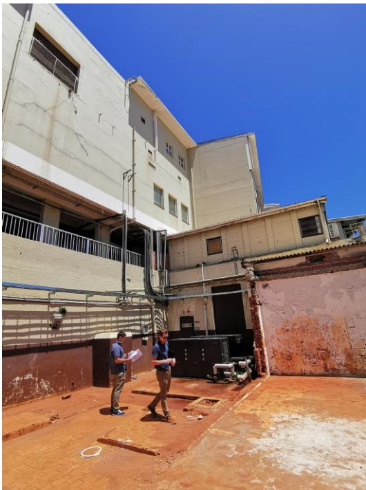
Image 4: View of the existing Parklands Hospital where plant is to be built to feed the Theatre