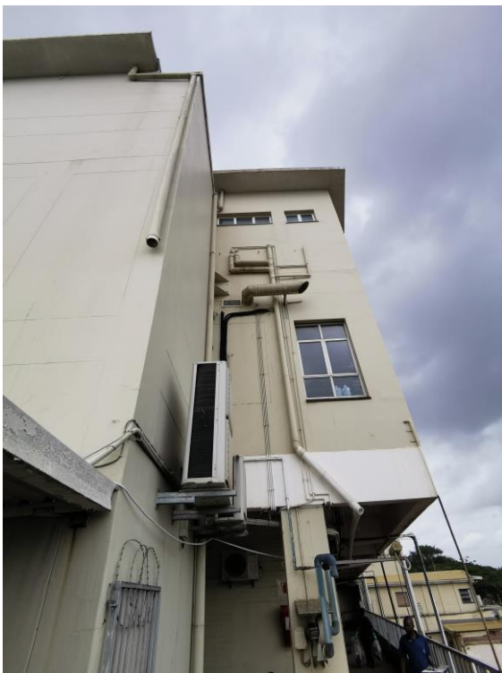
Image 2: View of existing HParklands Hospital where lin passage is to be built.