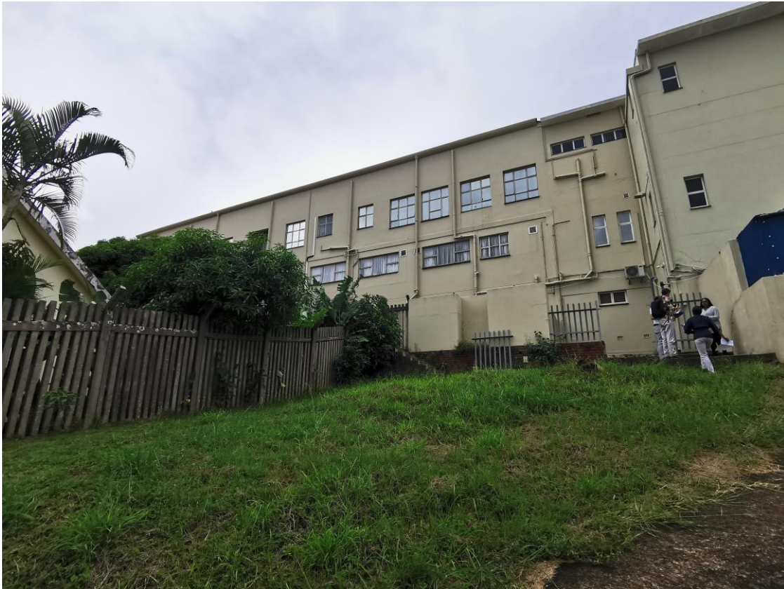
Image 1: View of the existing Parklands Hospital where new AC plant room is to be built.