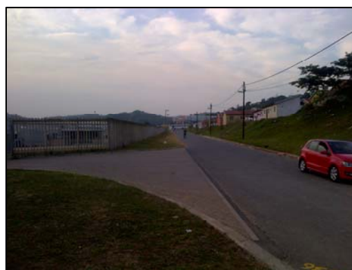
Site Photo 4: Access Road to proposed bridge location