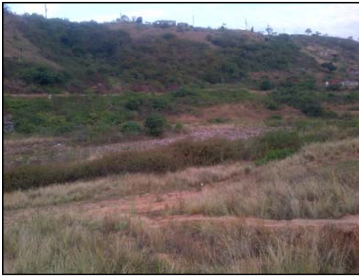
Site Photo 1: Banks of Mbokodweni River