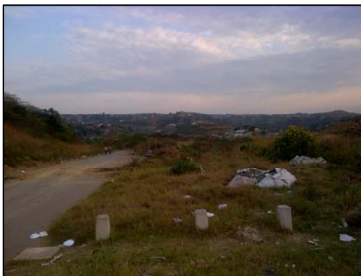
Site Photo 3: Road leading to proposed bridge location