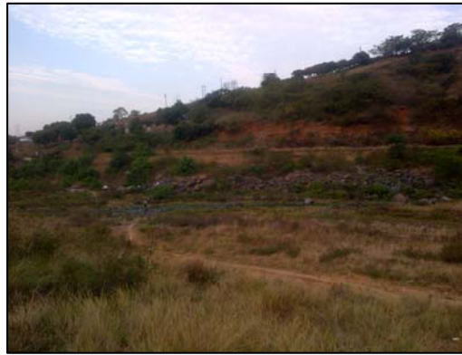
Site Photo 2: Mbokodweni River