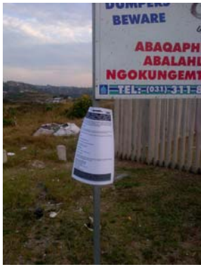
Site Notice 1