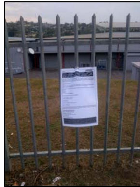
Site Notice 4