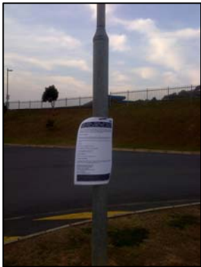
Site Notice 3