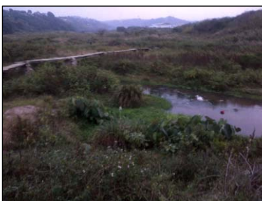
Site Photo 7: Existing pedestrian bridge