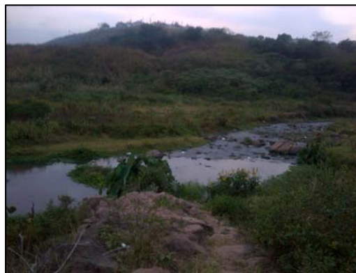
Site Photo 6: Mbokodweni River