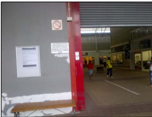
Site Notice 5