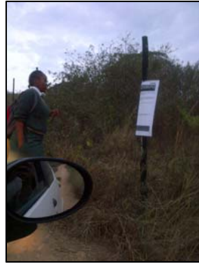
Site Notice 2