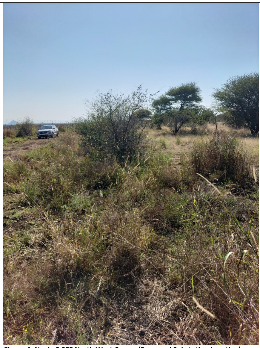
Figure 4: Nyala 2 SEF North West Corner (Proposed Substation Location) – South East View (GPS 24°55'42.89"S 27°18'29.43"E)