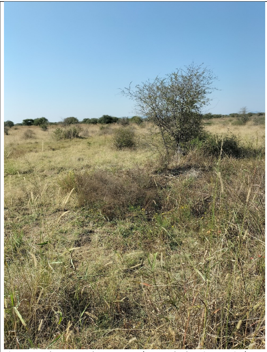
Figure 6: Nyala 2 SEF North West Corner (Proposed Substation Location) – South West View (GPS 24°55'42.89"S 27°18'29.43"E)