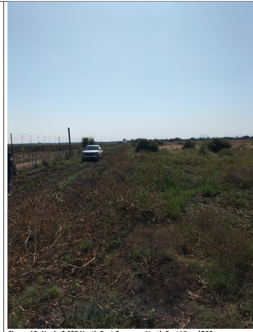
Figure 10: Nyala 2 SEF North East Corner - North East View (GPS 24°55'12.08"S 27°18'52.56"E)