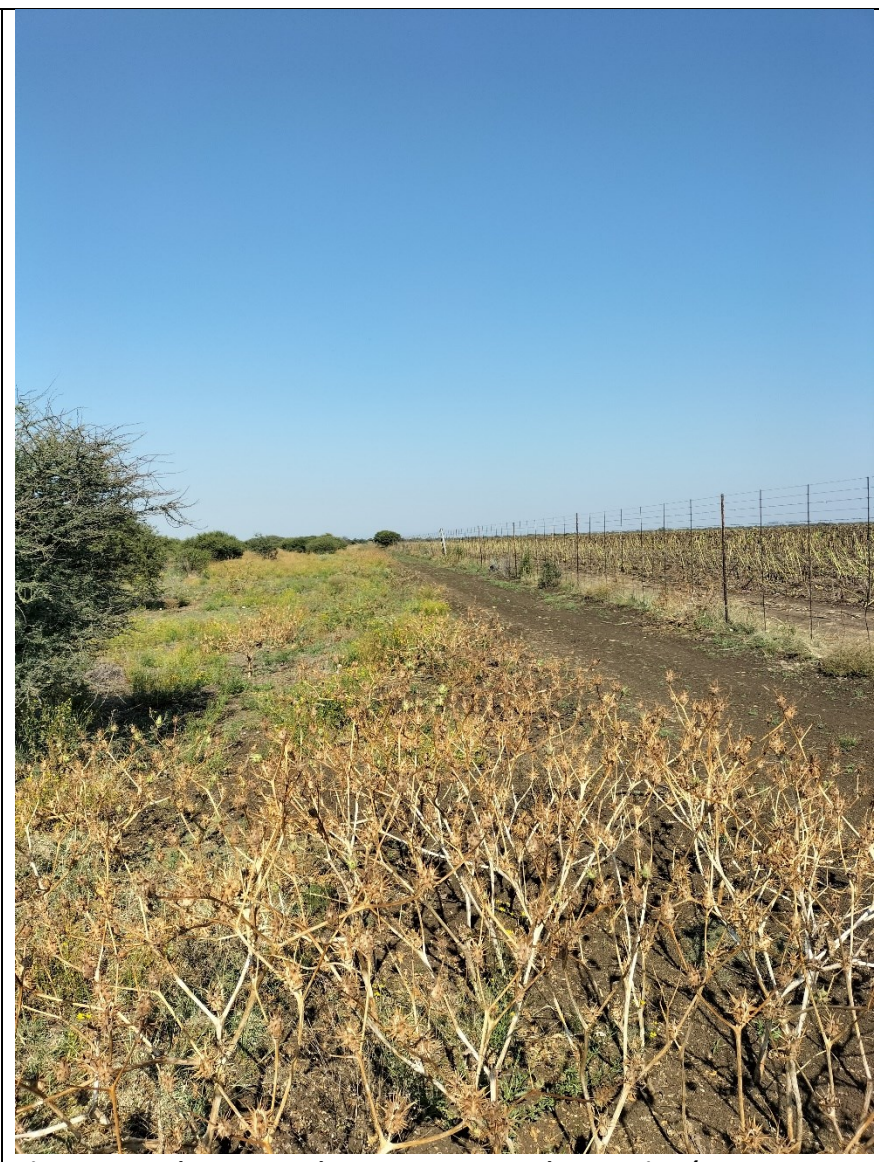
Figure 14: Nyala 2 SEF North East Corner – South West View (GPS 24°55'12.08"S 27°18'52.56"E)