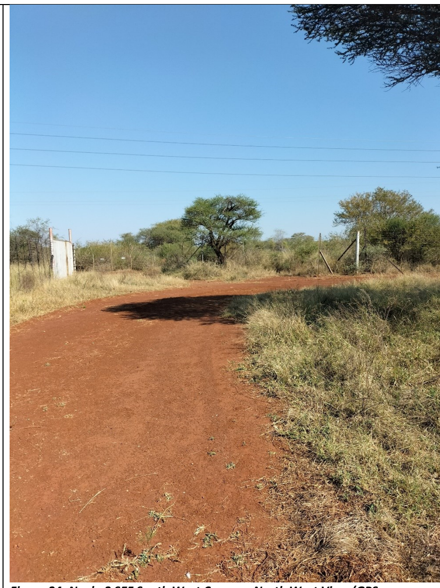
Figure 24: Nyala 2 SEF South West Corner – North West View (GPS 24°56'11.35"S 27°18'34.45"E) Potential Entrance Point