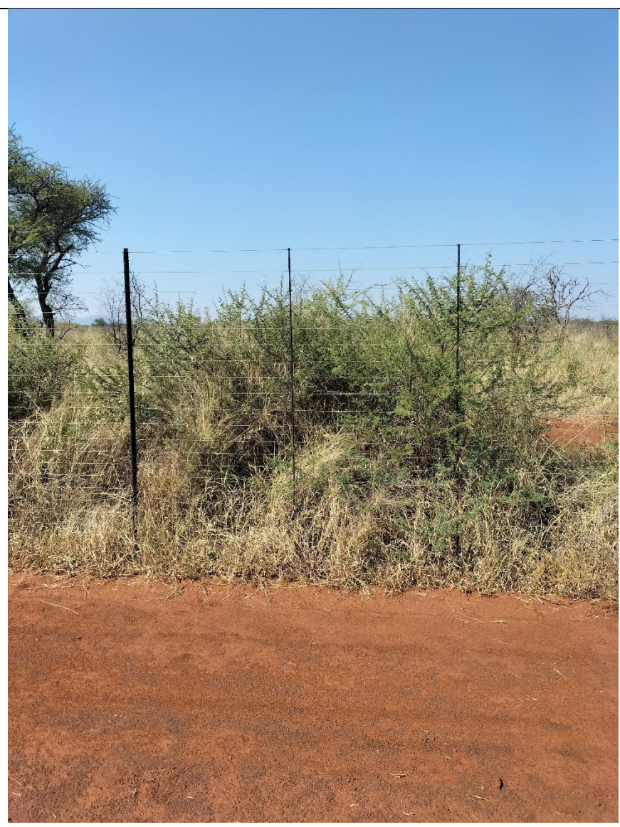
Figure 30: Nyala 2 SEF South East Corner—South West View (GPS 24°56'3.53"S 27°19'6.81"E)