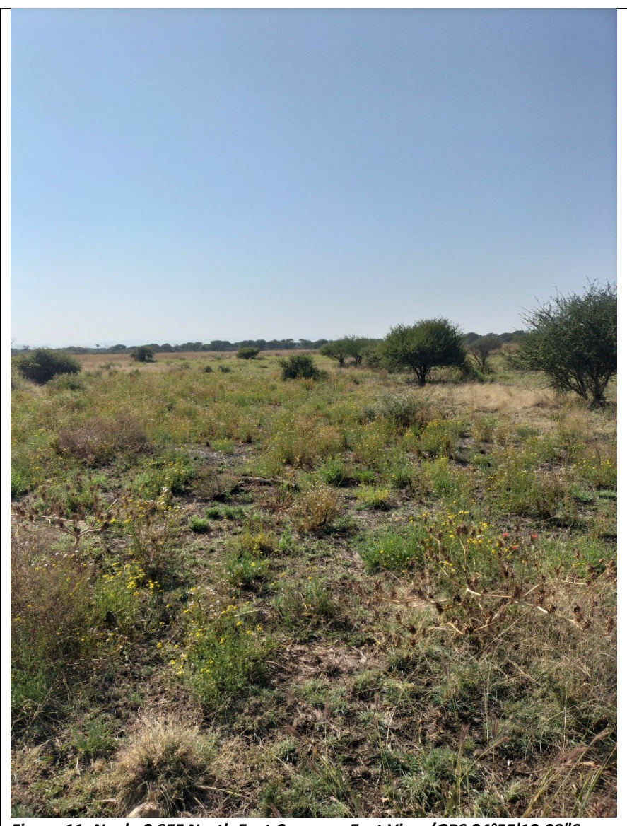
Figure 11: Nyala 2 SEF North East Corner – East View (GPS 24°55'12.08"S 27°18'52.56"E)