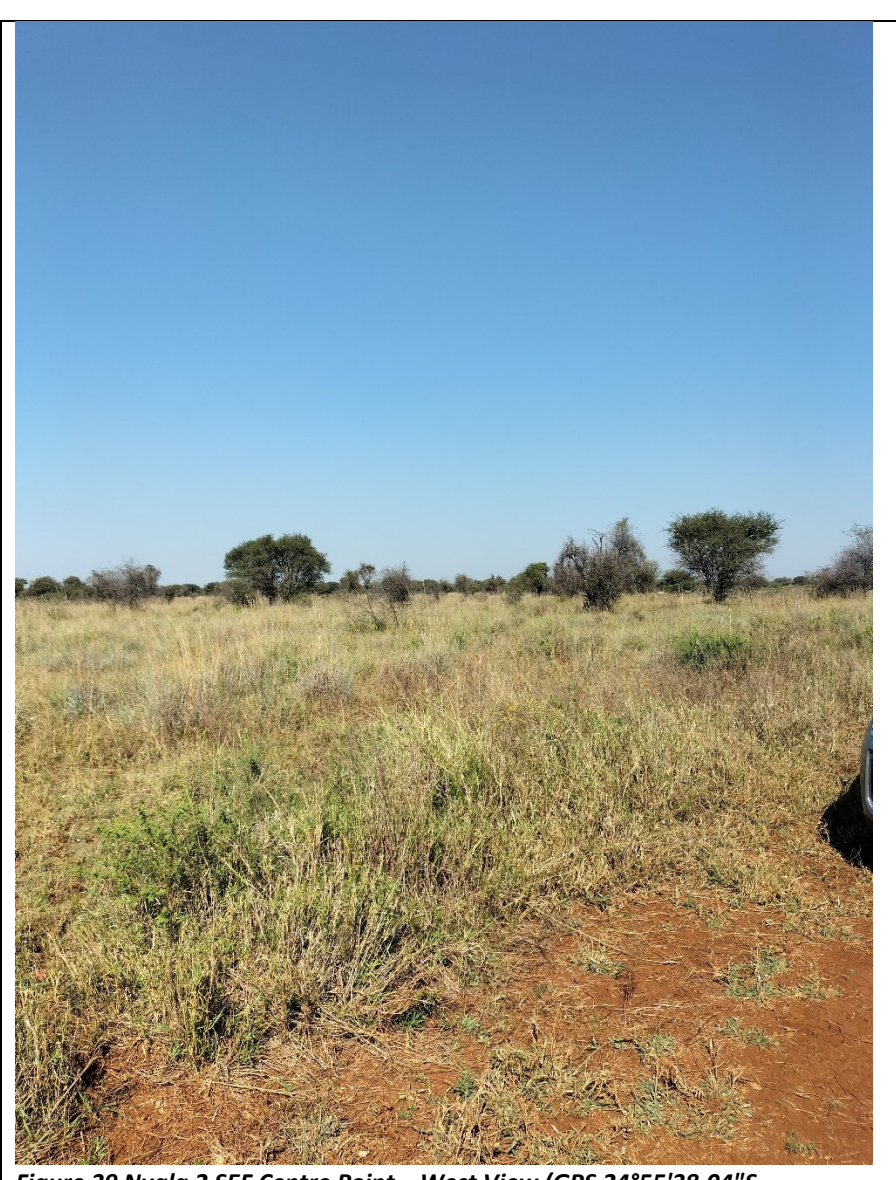
Figure 39 Nyala 2 SEF Centre Point – West View (GPS 24°55'38.04"S 27°18'50.14"E)