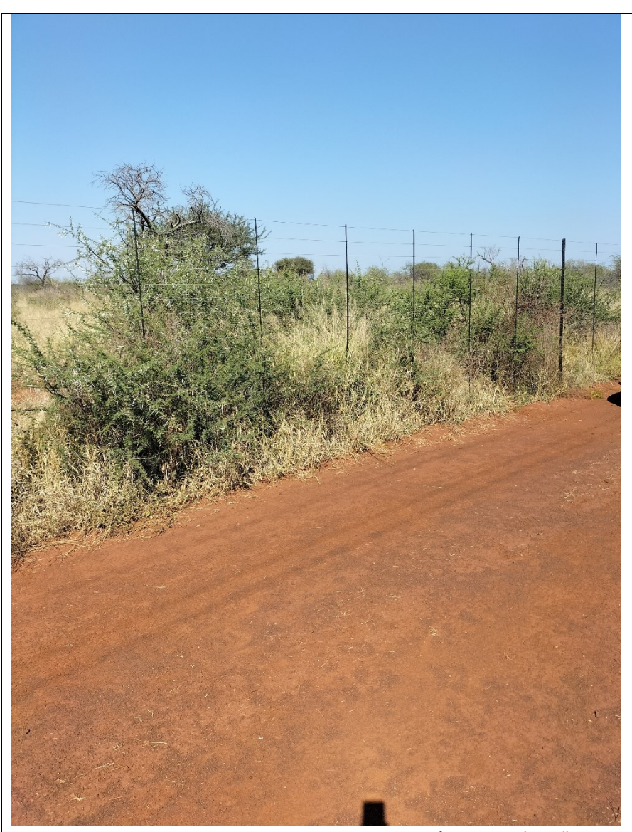
Figure 31: Nyala 2 SEF South East Corner – West View (GPS 24°56'3.53"S 27°19'6.81"E)