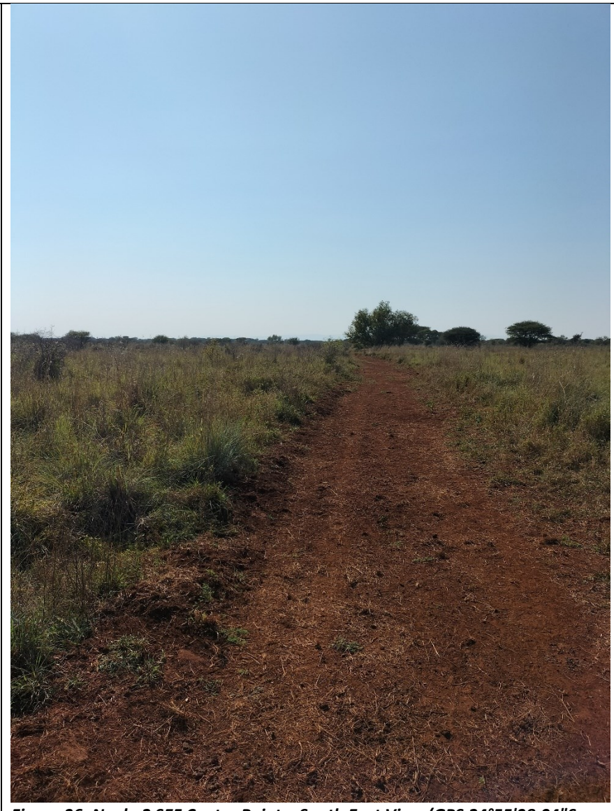
Figure 36: Nyala 2 SEF Centre Point – South East View (GPS 24°55'38.04"S 27°18'50.14"E)