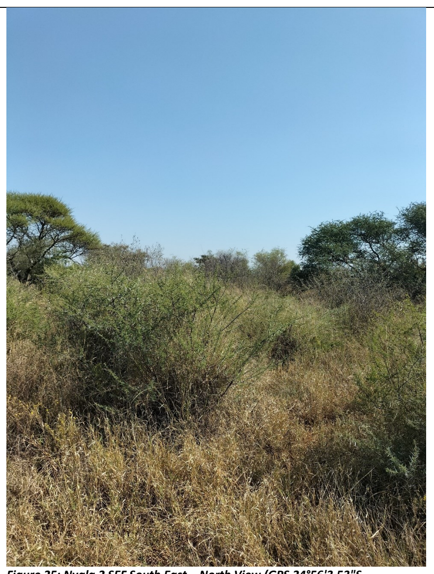
Figure 25: Nyala 2 SEF South East – North View (GPS 24°56'3.53"S 27°19'6.81"E)