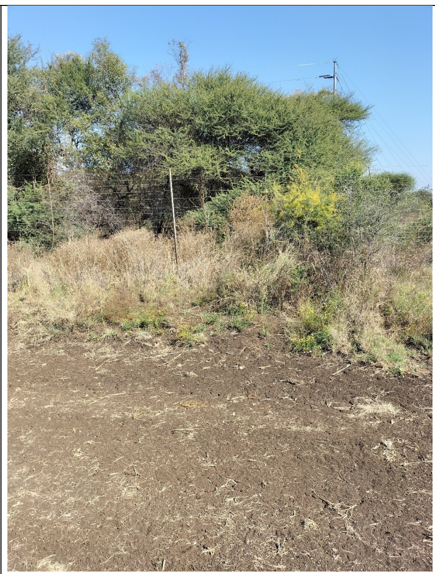
Figure 16: Nyala 2 SEF North East Corner – North West View (GPS 24°55'12.08"S 27°18'52.56"E)