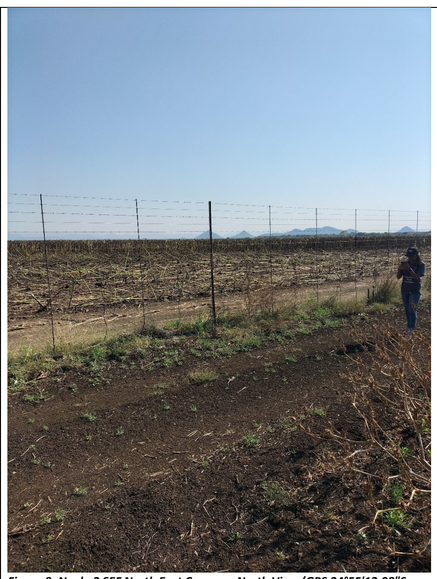
Figure 9: Nyala 2 SEF North East Corner – North View (GPS 24°55'12.08"S 27°18'52.56"E)