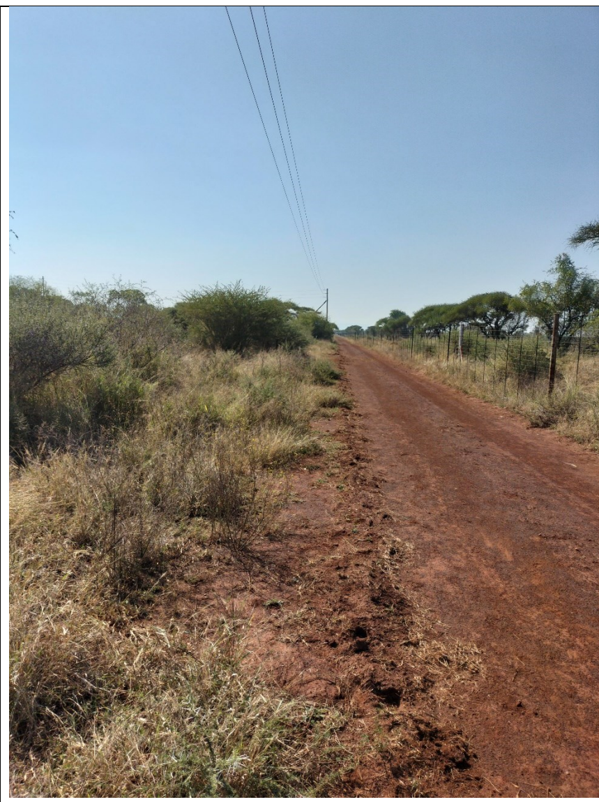
Figure 28: Nyala 2 SEF South East Corner – South East View (GPS 24°56'3.53"S 27°19'6.81"E)