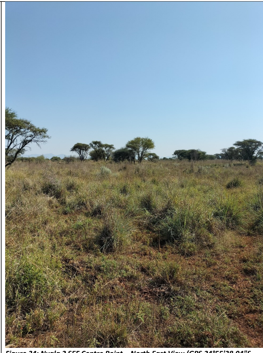
Figure 34: Nyala 2 SEF Centre Point – North East View (GPS 24°55'38.04"S 27°18'50.14"E)