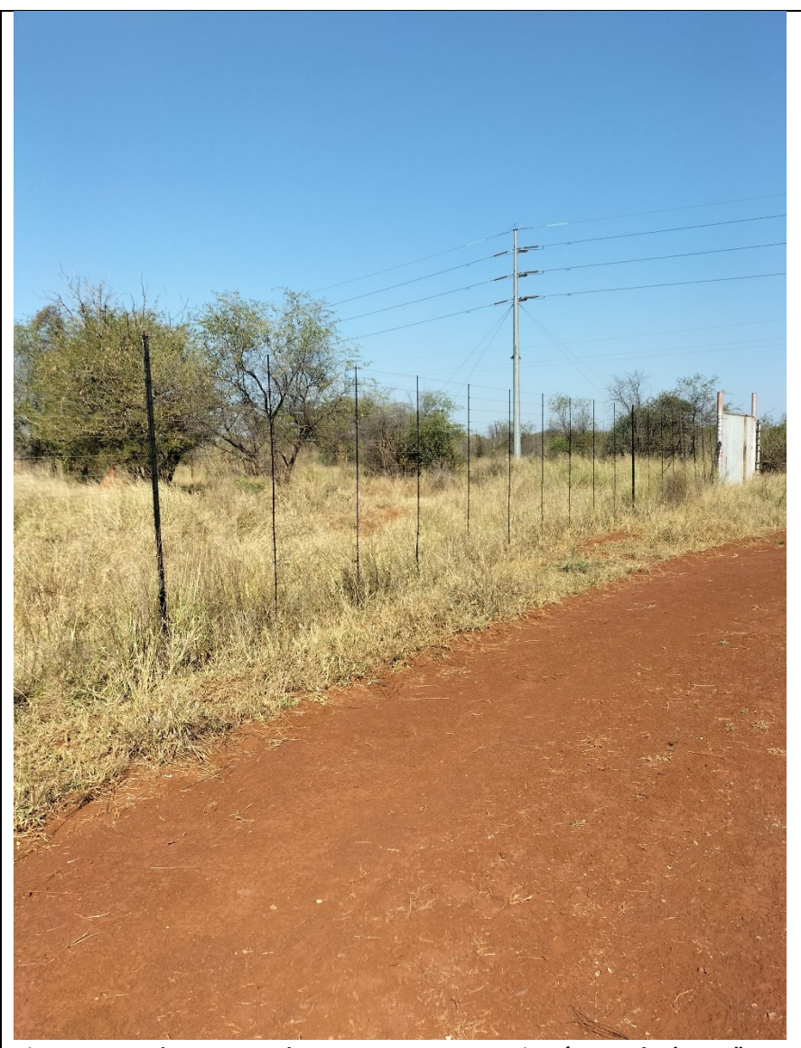
Figure 23: Nyala 2 SEF South West Corner – West View (GPS 24°56'11.35"S 27°18'34.45"E) Potential Entrance Point