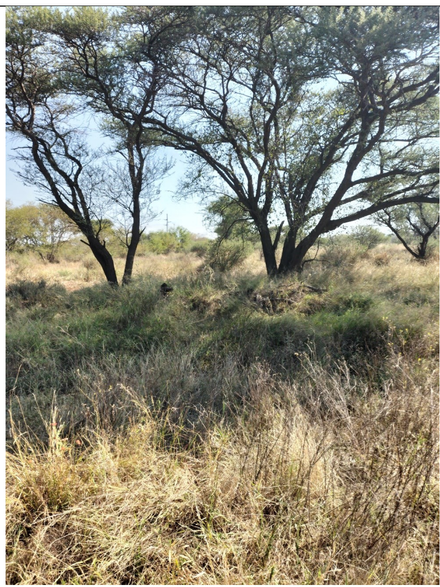
Figure 18: Nyala 2 SEF South West Corner – North East View (GPS 24°56'11.35"S 27°18'34.45"E)