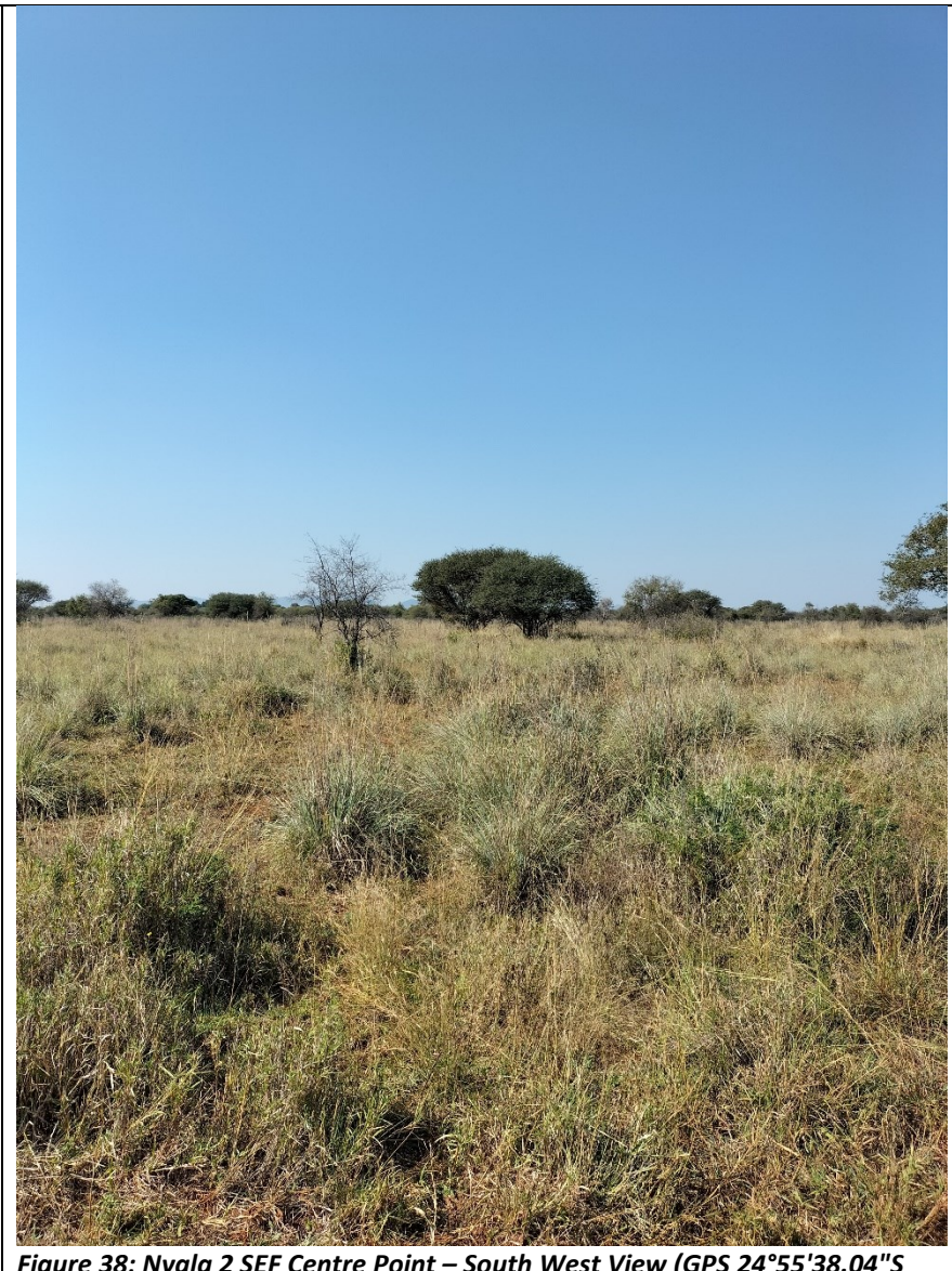
Figure 38: Nyala 2 SEF Centre Point – South West View (GPS 24°55'38.04"S 27°18'50.14"E)