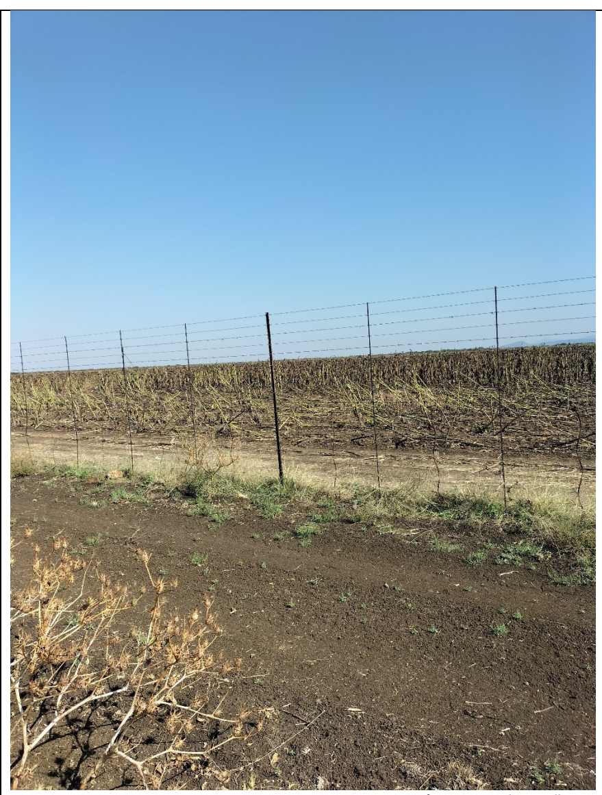
Figure 15: Nyala 2 SEF North East Corner – West View (GPS 24°55'12.08"S 27°18'52.56"E)