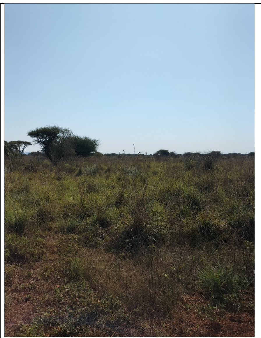
Figure 35: Nyala 2 SEF Centre Point – East View (GPS 24°55'38.04"S 27°18'50.14"E)