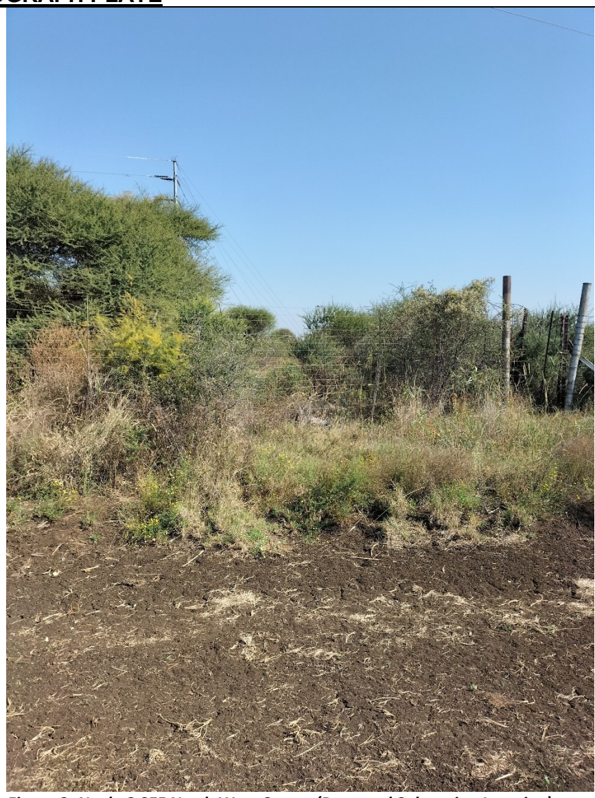
Figure 2: Nyala 2 SEF North West Corner (Proposed Substation Location) – North East View (GPS 24°55'42.89"S 27°18'29.43"E)