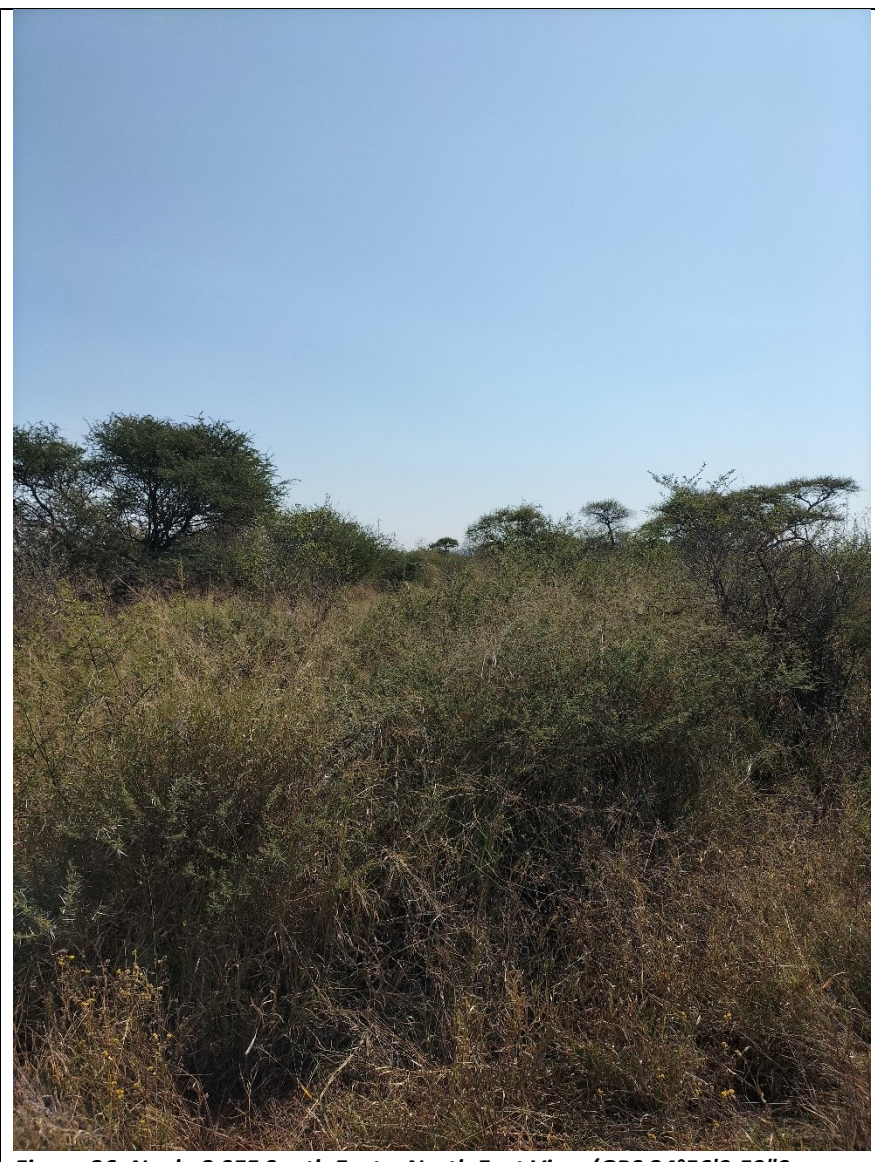
Figure 26: Nyala 2 SEF South East – North East View (GPS 24°56'3.53"S 27°19'6.81"E)