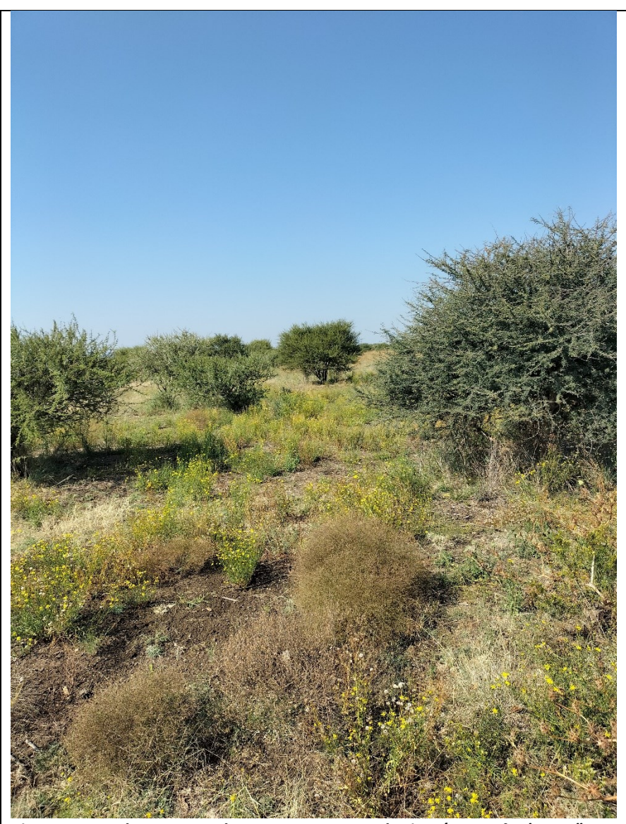
Figure 13: Nyala 2 SEF North East Corner – South View (GPS 24°55'12.08"S 27°18'52.56"E)