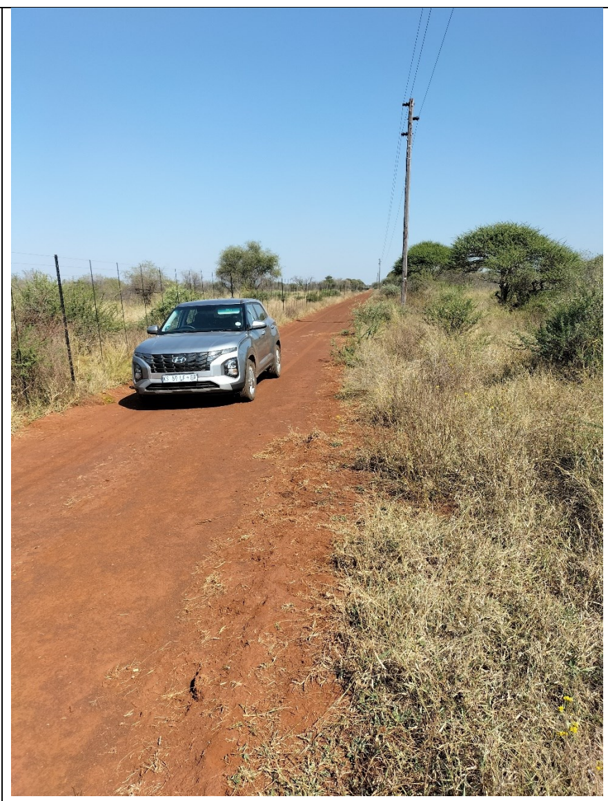
Figure 32: Nyala 2 SEF South East Corner – North West View (GPS 24°56'3.53"S 27°19'6.81"E)