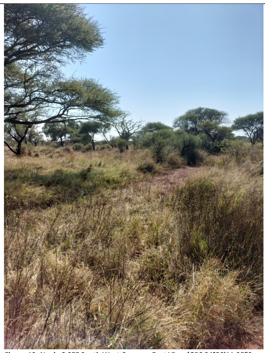
Figure 19: Nyala 2 SEF South West Corner – East View (GPS 24°56'11.35"S 27°18'34.45"E)