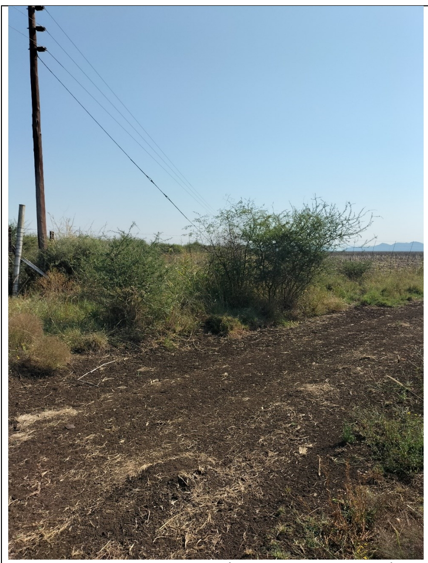
Figure 3: Nyala 2 SEF North West Corner (Proposed Substation Location) – East View (GPS 24°55'42.89"S 27°18'29.43"E)