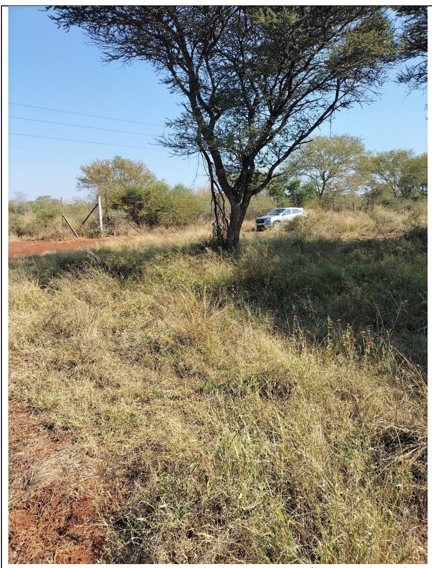
Figure 17: Nyala 2 SEF South West Corner – North View (GPS 24°56'11.35"S 27°18'34.45"E)