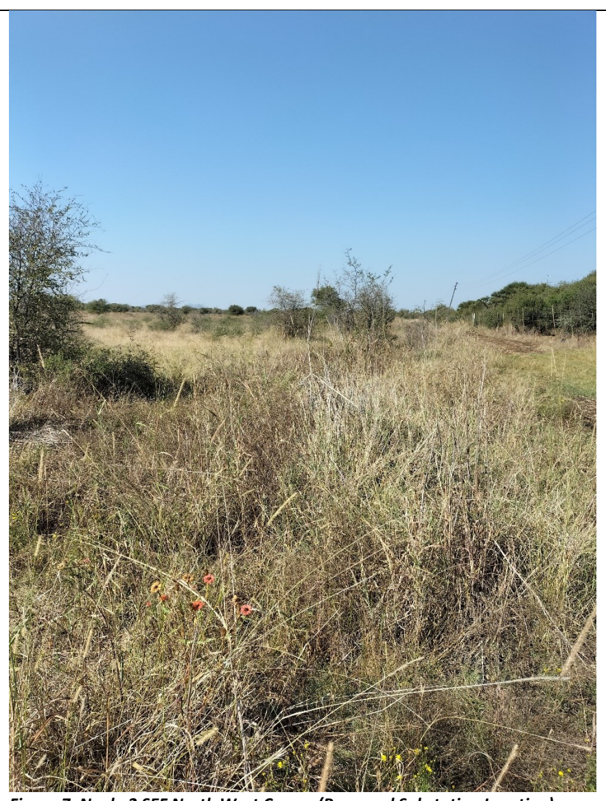
Figure 7: Nyala 2 SEF North West Corner (Proposed Substation Location) – West View (GPS 24°55'42.89"S 27°18'29.43"E)