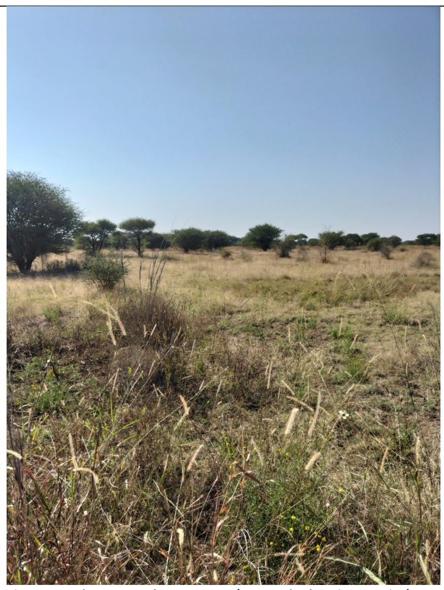
Figure 5: Nyala 2 SEF North West Corner (Proposed Substation Location) – South View (GPS 24°55'42.89"S 27°18'29.43"E)