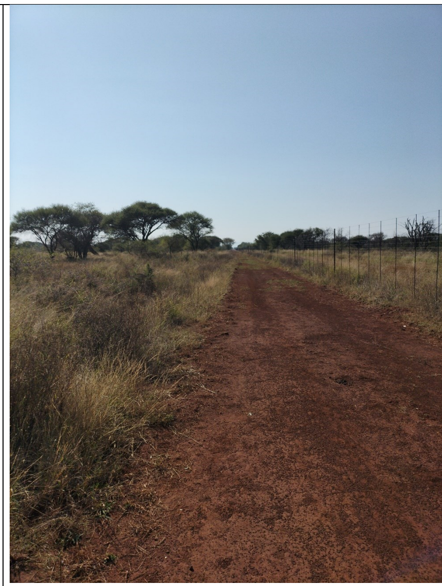
Figure 20: Nyala 2 SEF South West Corner – South East View (GPS 24°56'11.35"S 27°18'34.45"E)