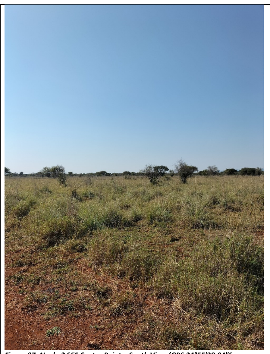
Figure 37: Nyala 2 SEF Centre Point – South View (GPS 24°55'38.04"S 27°18'50.14"E)