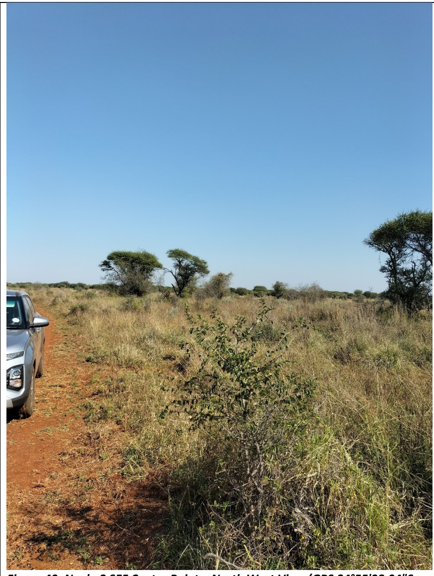
Figure 40: Nyala 2 SEF Centre Point – North West View (GPS 24°55'38.04"S 27°18'50.14"E)