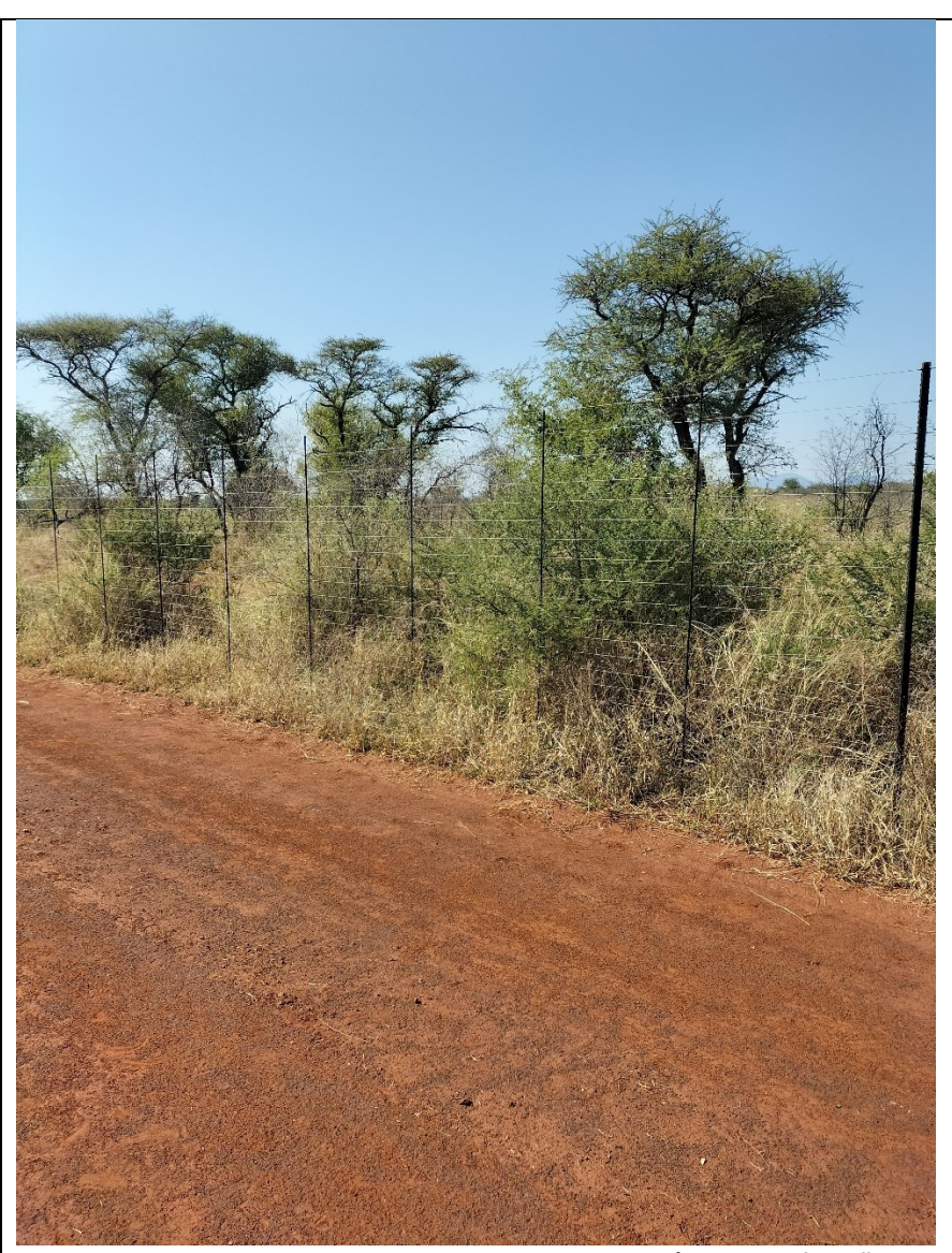
Figure 29: Nyala 2 SEF South East Corner – South View (GPS 24°56'3.53"S 27°19'6.81"E)