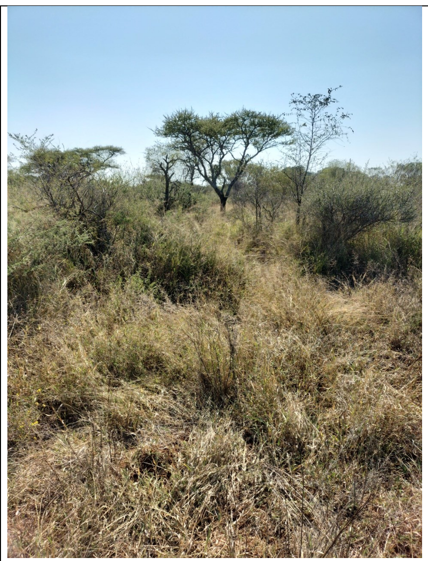
Figure 27: Nyala 2 SEF South East Corner – East View (GPS 24°56'3.53"S 27°19'6.81"E)