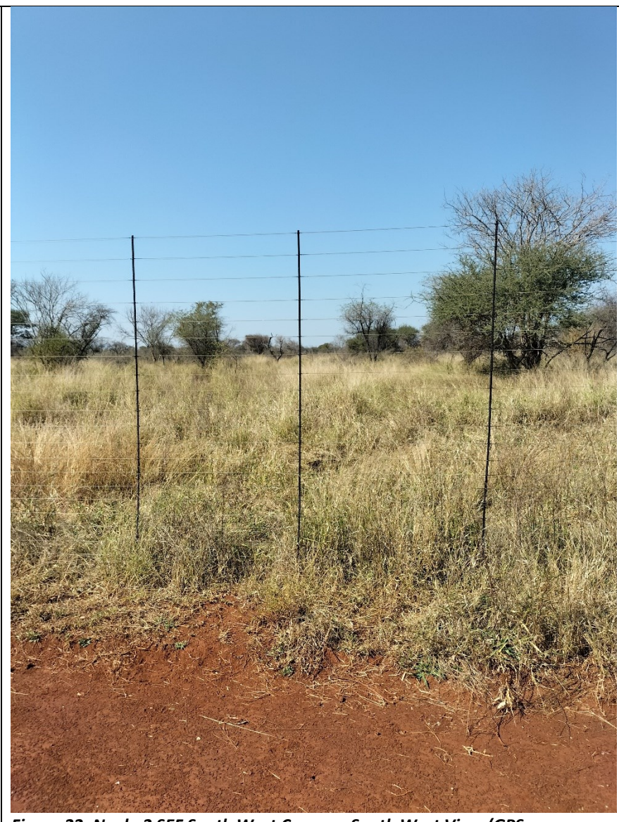
Figure 22: Nyala 2 SEF South West Corner – South West View (GPS 24°56'11.35"S 27°18'34.45"E)