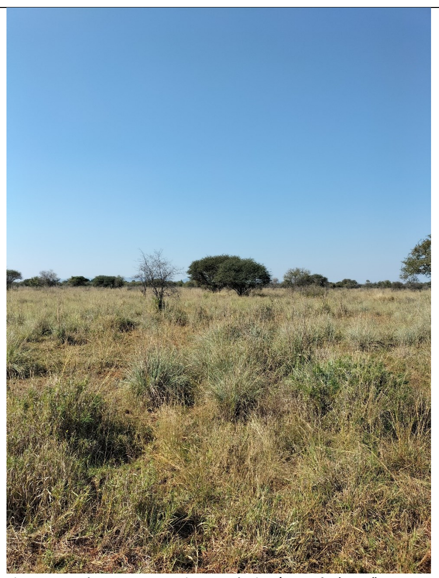
Figure 33: Nyala 2 SEF Centre Point – North View (GPS 24°55'38.04"S 27°18'50.14"E)