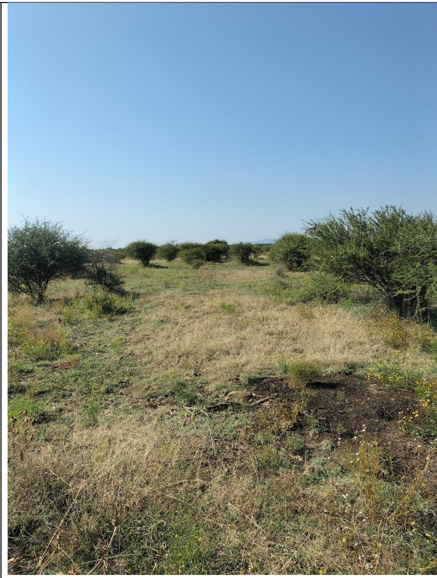
Figure 12: Nyala 2 SEF North East Corner - South East View (GPS 24°55'12.08"S 27°18'52.56"E)