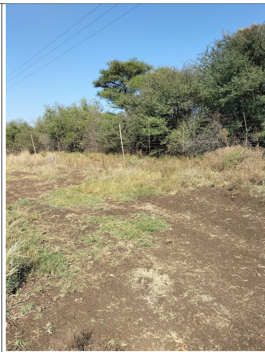
Figure 8: Nyala 2 SEF North West Corner (Proposed Substation Location) – North West View (GPS 24°55'42.89"S 27°18'29.43"E)