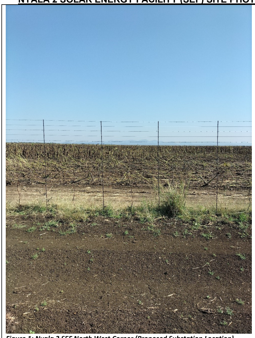
Figure 1: Nyala 2 SEF North West Corner (Proposed Substation Location) – North View (GPS 24°55'42.89"S 27°18'29.43"E)

NYALA 2 SOLAR ENERGY FACILITY (SEF) SITE PHOTOGRAPH PLATE