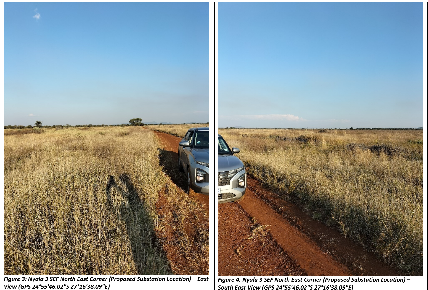
South East View (GPS 24°55'46.02"S 27°16'38.09"E)