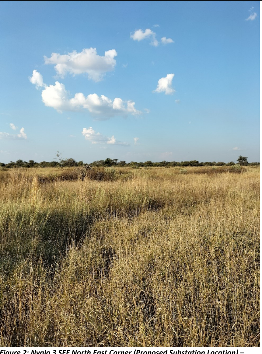
Figure 2: Nyala 3 SEF North East Corner (Proposed Substation Location) – North East View (GPS 24°55'46.02"S 27°16'38.09"E)

Figure 1: Nyala 3 SEF North East Corner (Proposed Substation Location) – North View (GPS 24°55'46.02"S 27°16'38.09"E)