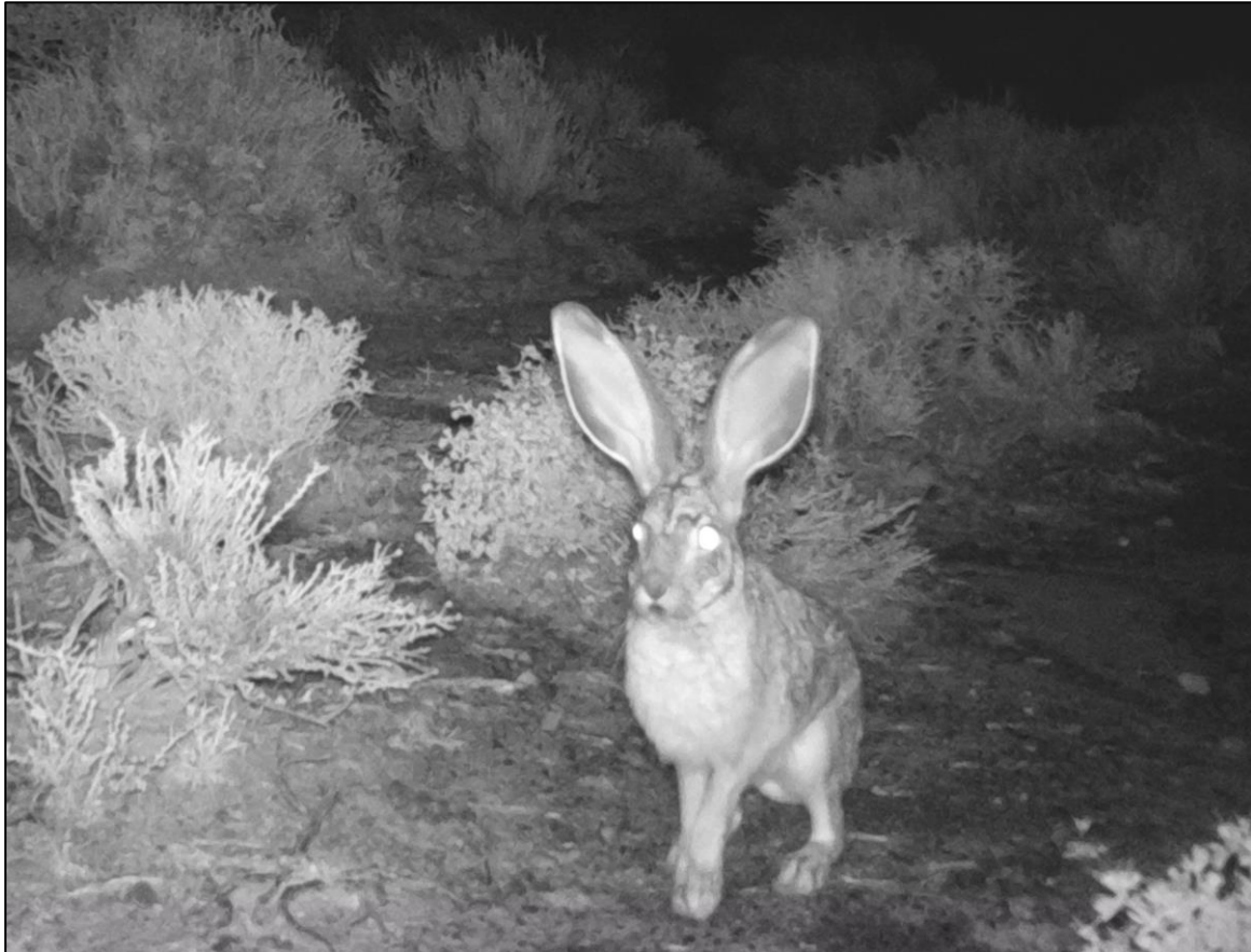
Figure 4. Example of a camera trap image from the site, showing a Cape Hare which can easily be differentiated from a Riverine Rabbit by the shape of the face, long legs and the lack of black line along the jaw.