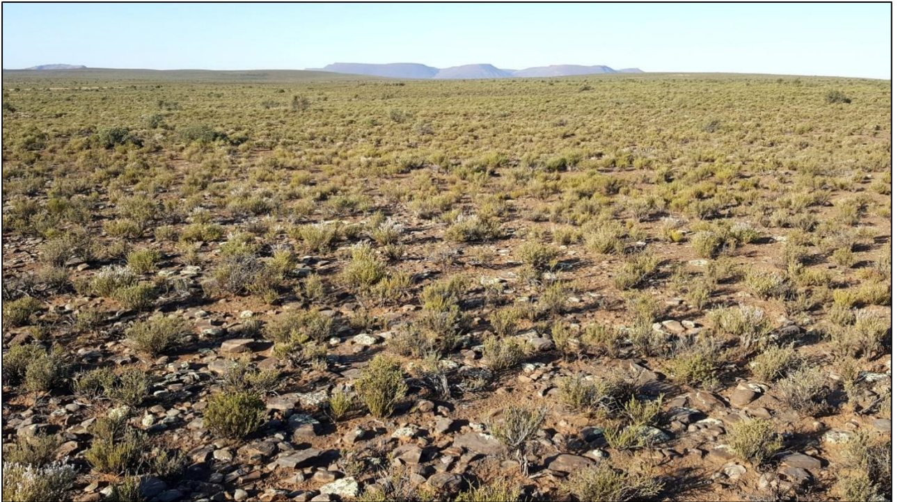
Figure 3. Typical open plains on stony soils within the Mura 1 Solar PV Facility, representative of the Eastern Upper Karoo vegetation type, showing the homogenous nature of the site.