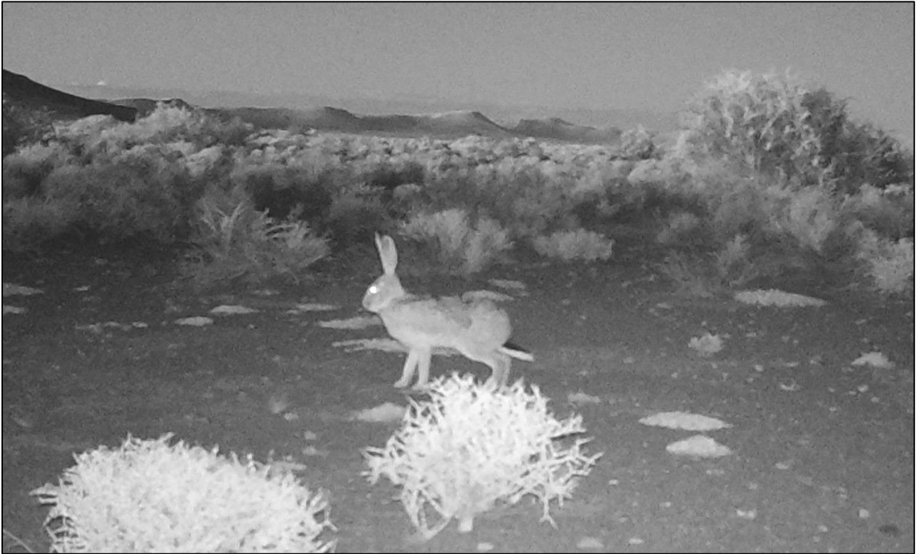
Figure 4. Example of a camera trap image from the site, showing a Cape Hare which can easily be differentiated from a Riverine Rabbit by the shape of the face and the black and white tail.