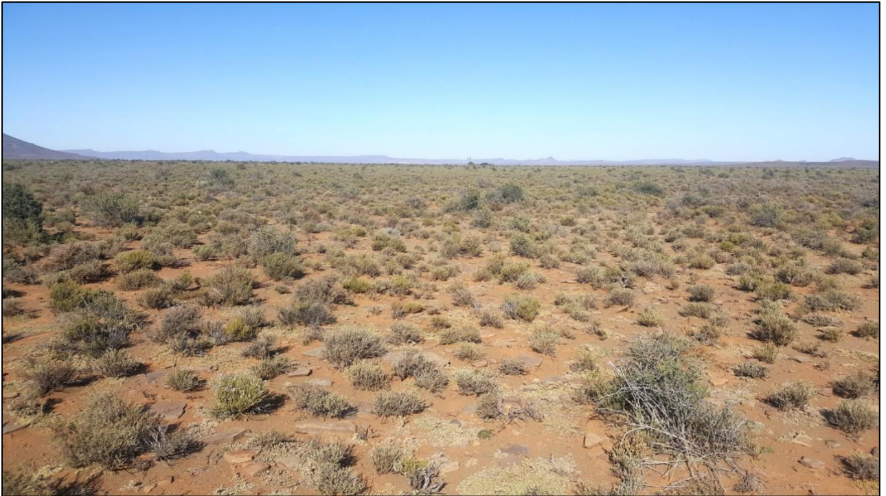
Figure 3. Typical open plains on silty soils within the Mura 3 Solar PV Facility, representative of the Eastern Upper Karoo vegetation type, showing the relatively low cover and homogenous nature of the site.