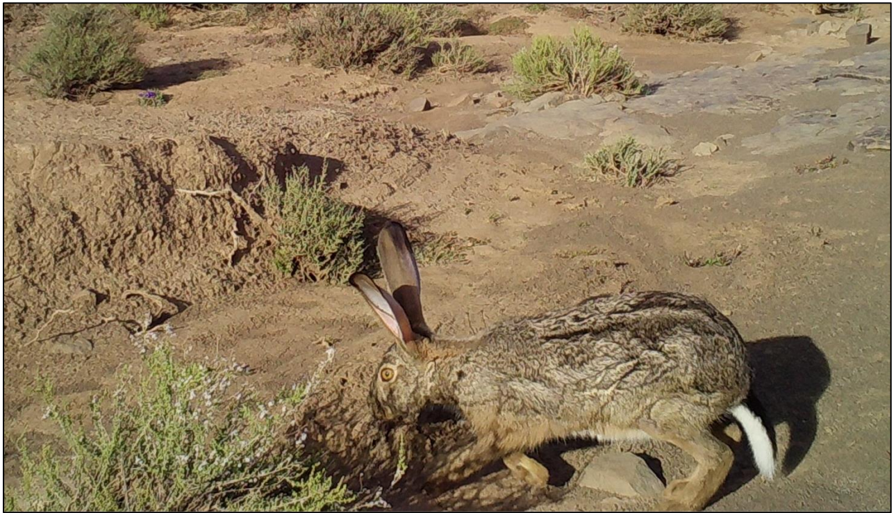
Figure 4. Example of a camera trap image from the site, showing a Cape Hare which can easily be differentiated from a Riverine Rabbit by the shape of the face and the black and white tail.