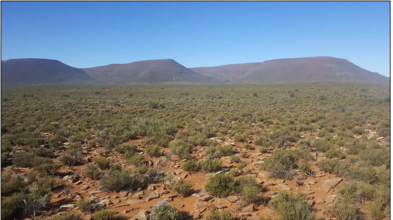
Figure 3. Typical open plains on silty soils within the Mura 4 Solar PV Facility, representative of the Eastern Upper Karoo vegetation type, showing the homogenous nature of the site.