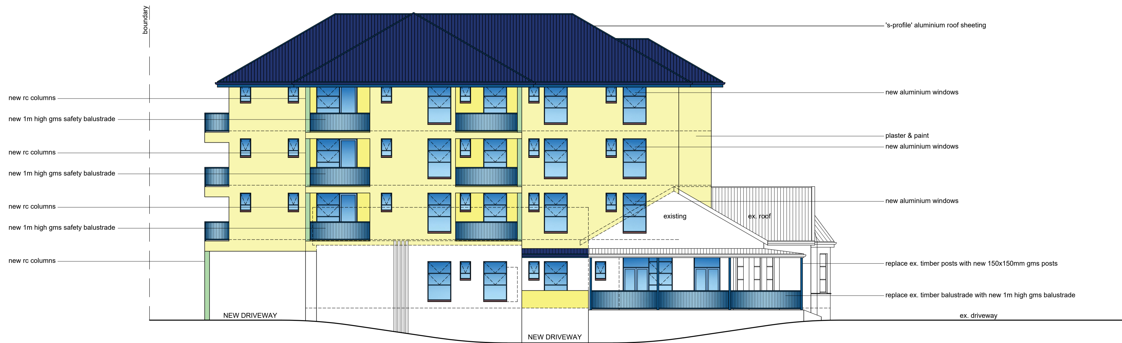
NORTH EAST ELEVATION (1 : 100)