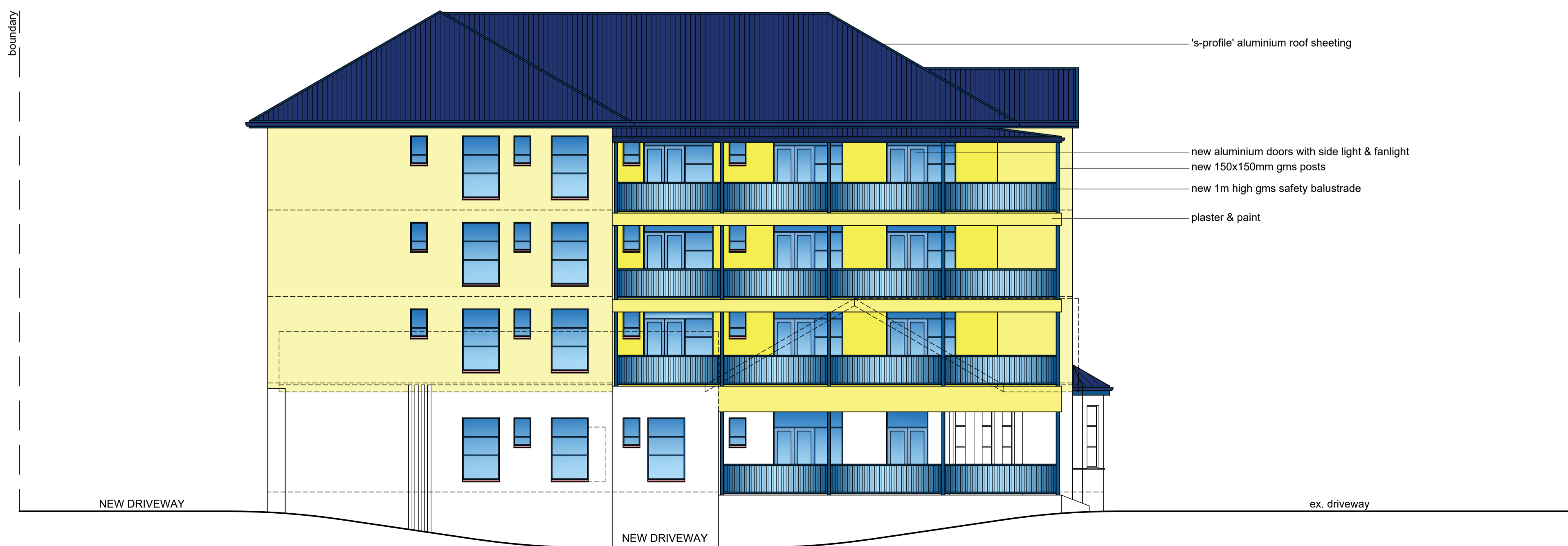
NORTH EAST ELEVATION (1 : 100)