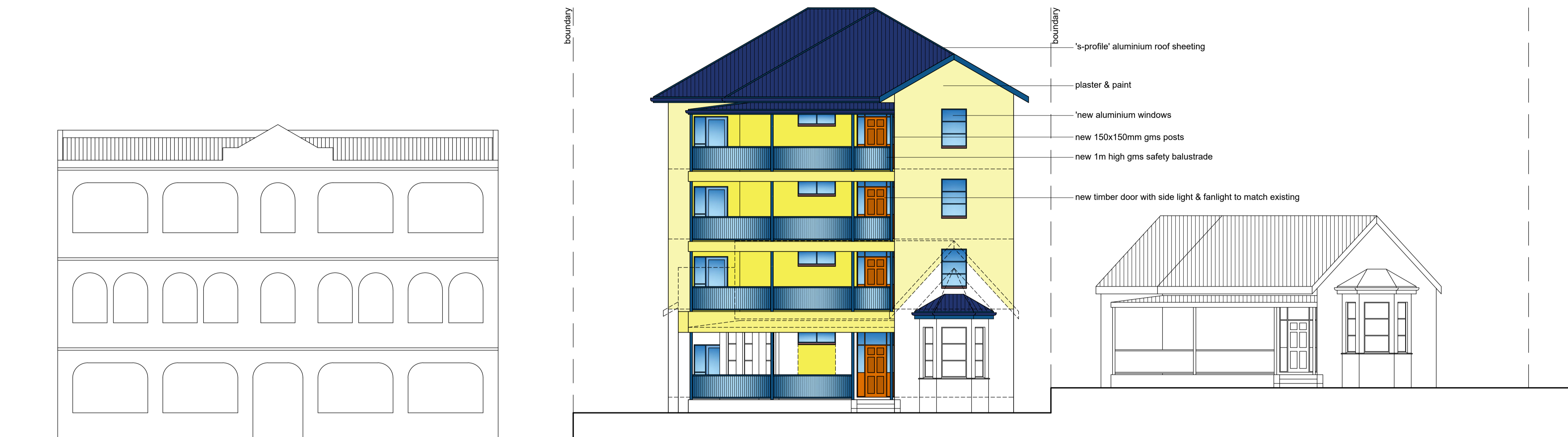
NORTH WEST ELEVATION/ STREETScape (1 : 100)