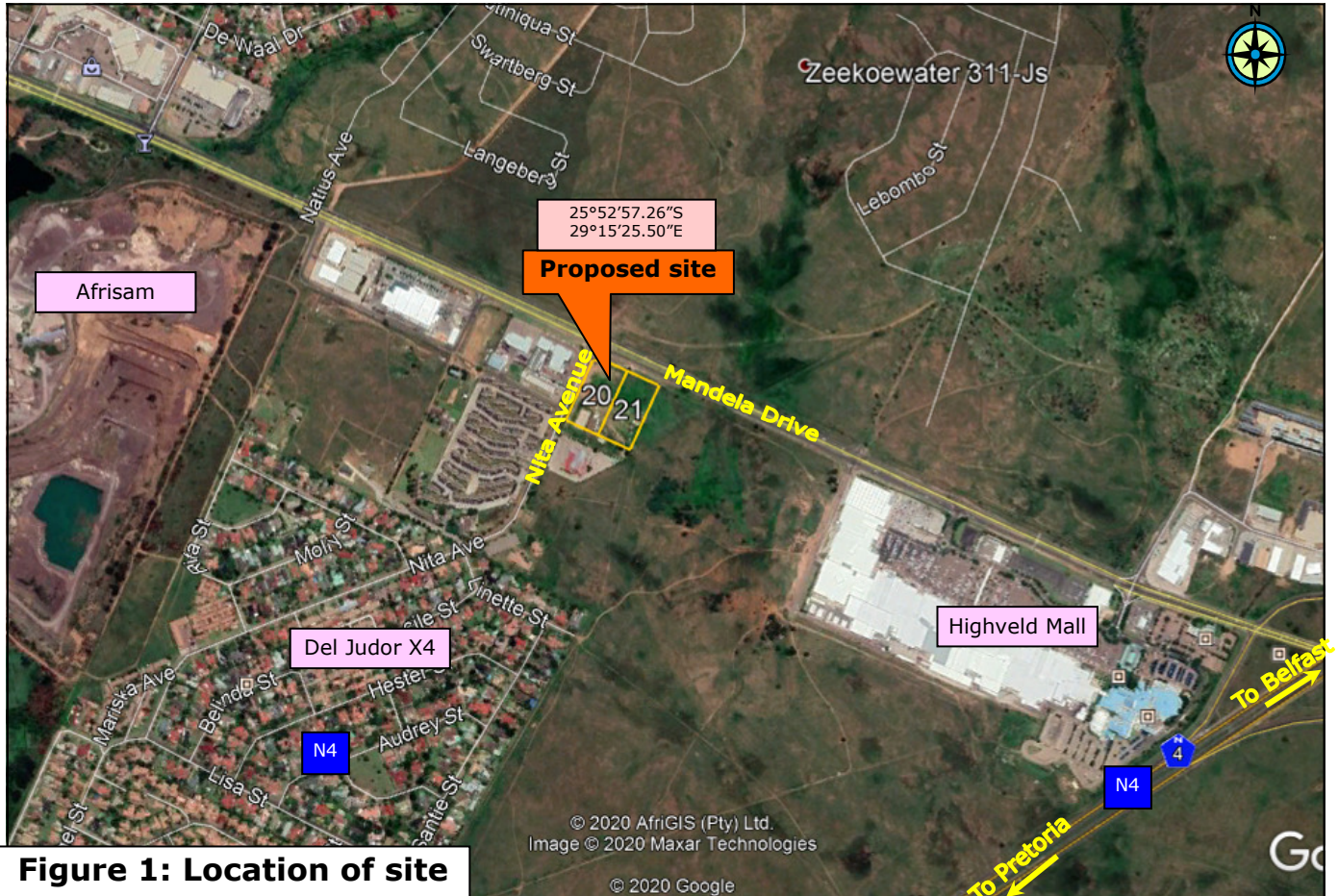
Figure 1: Location of site

The proposed filling station site would be highly visible and easily accessible to passing road users. It would thus be ideally situated for business purposes.