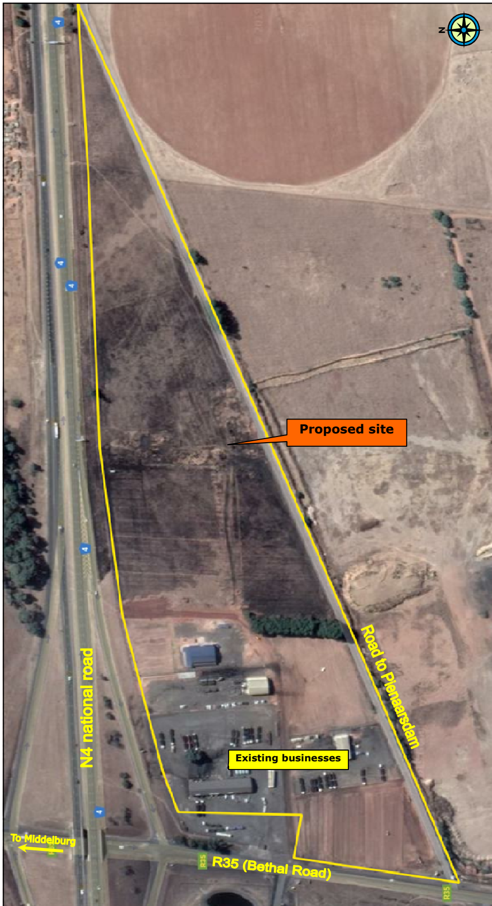
Figure 2: Aerial view of the site