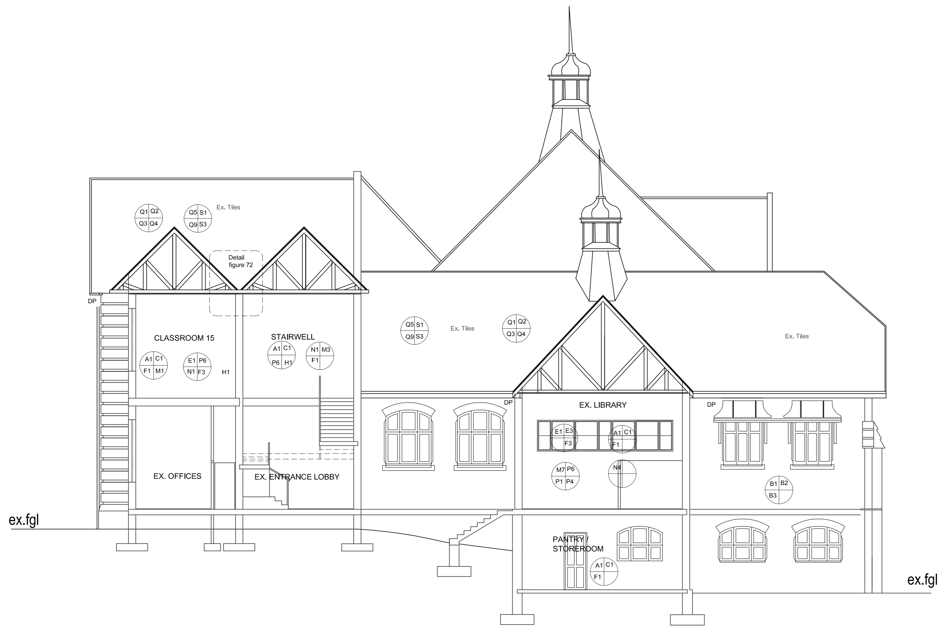
SECTION A-A Scale 1:100