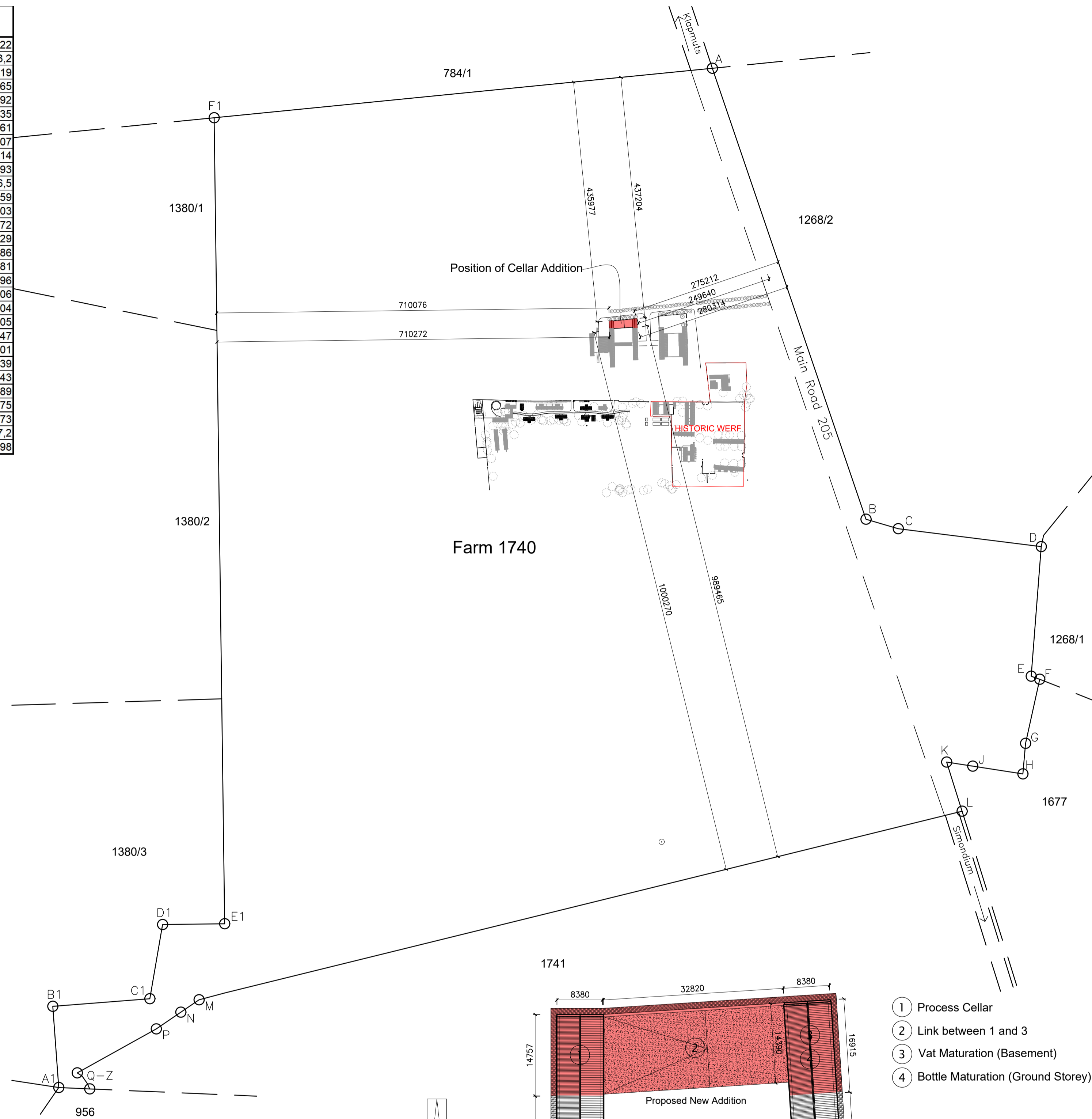
SITE PLAN scale 1:5000 (A1) scale 1:10000 (A3)