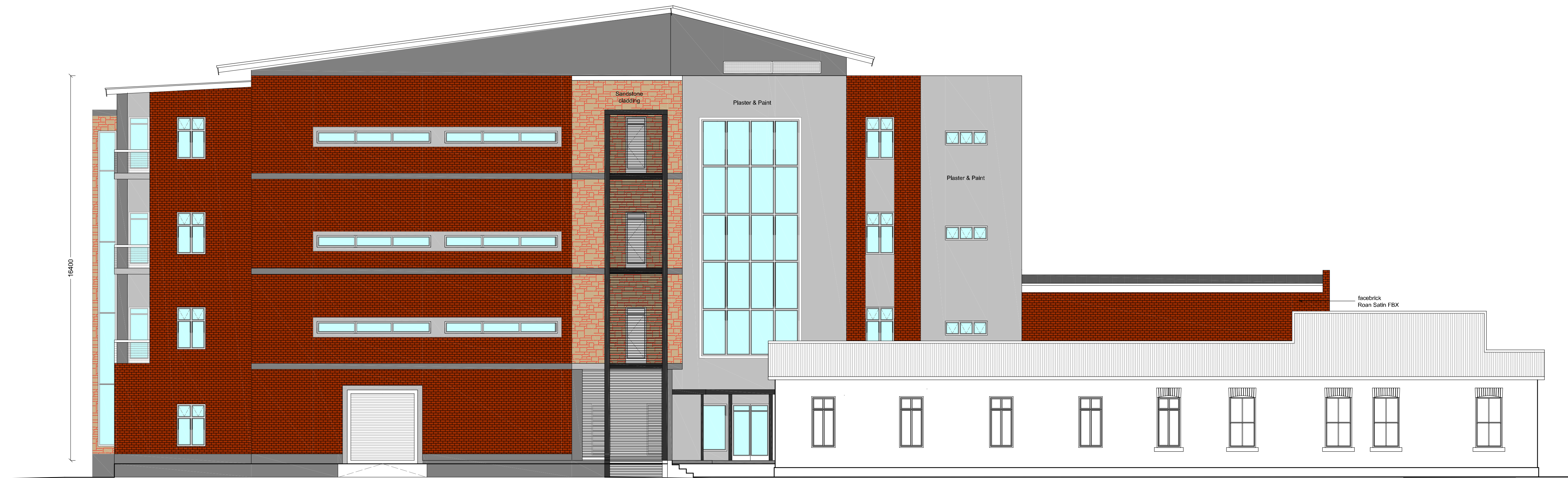
NORTH EASTERN ELEVATION Scale 1:100