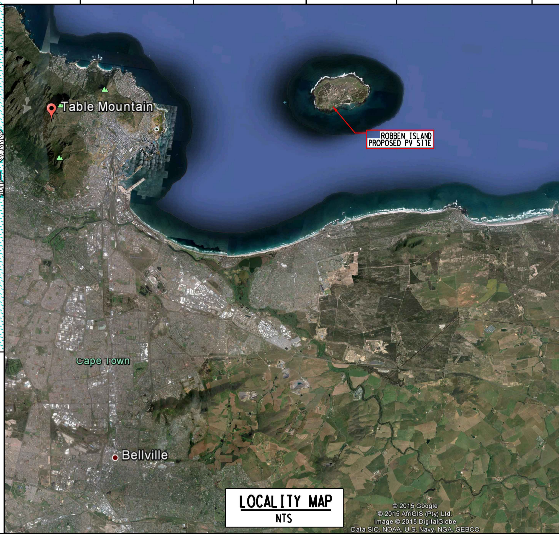
LOCALITY MAP NTS