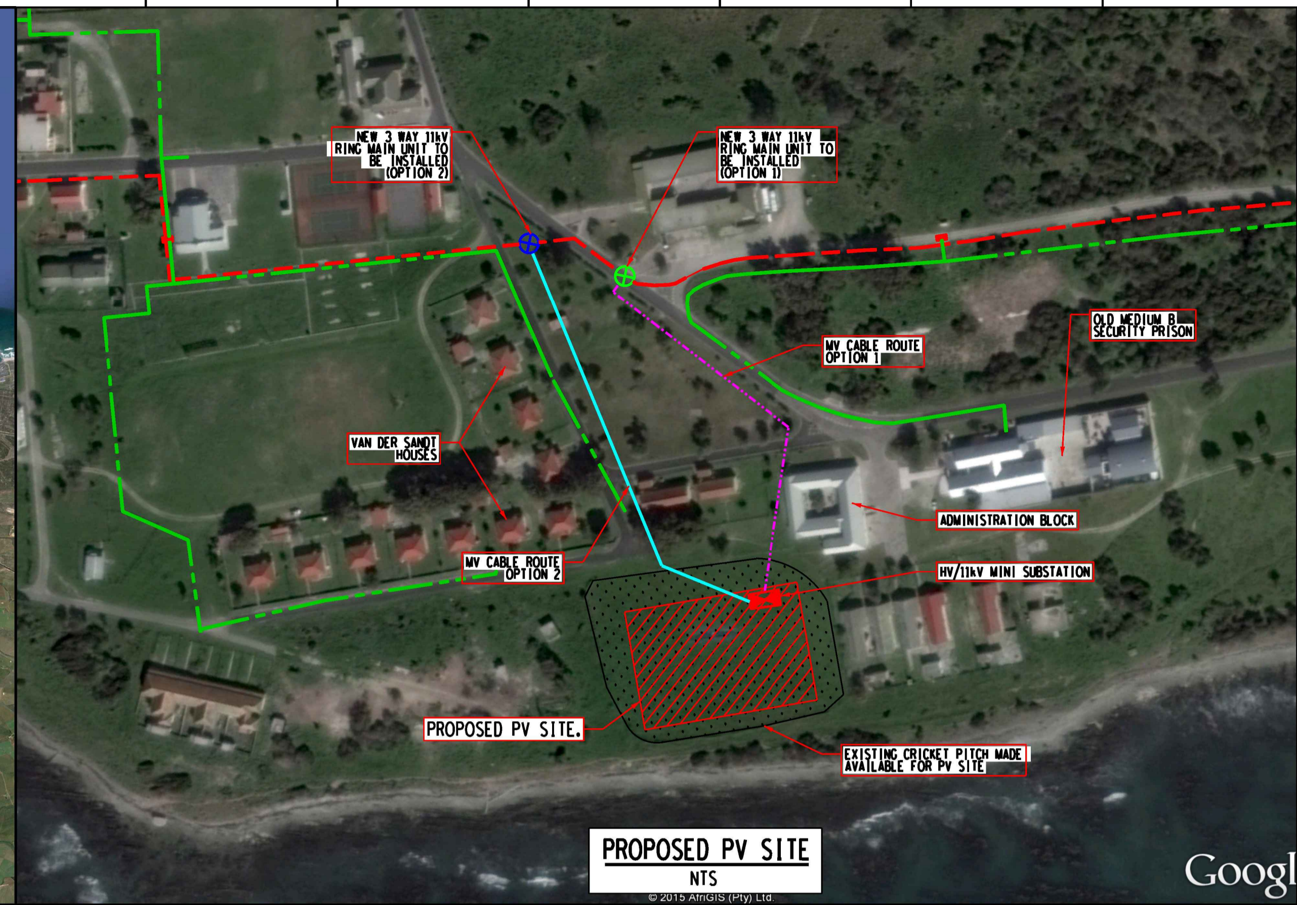
PROPOSED PV SITE NTS